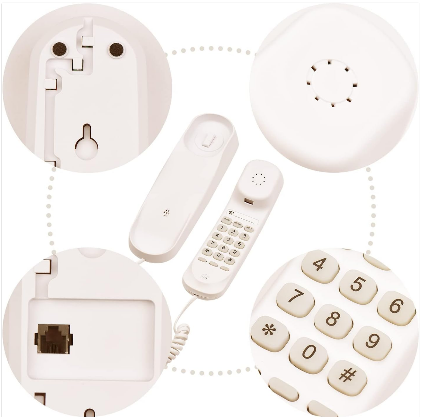
Figure 4: Key Components (Bottom, Speaker, RJ11 Port, Keypad)