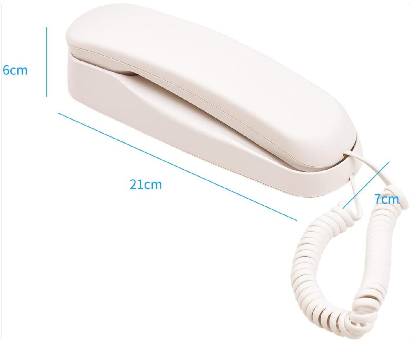
Figure 3: Product Dimensions (Approximate: 21cm length, 6cm height, 7cm cord width)