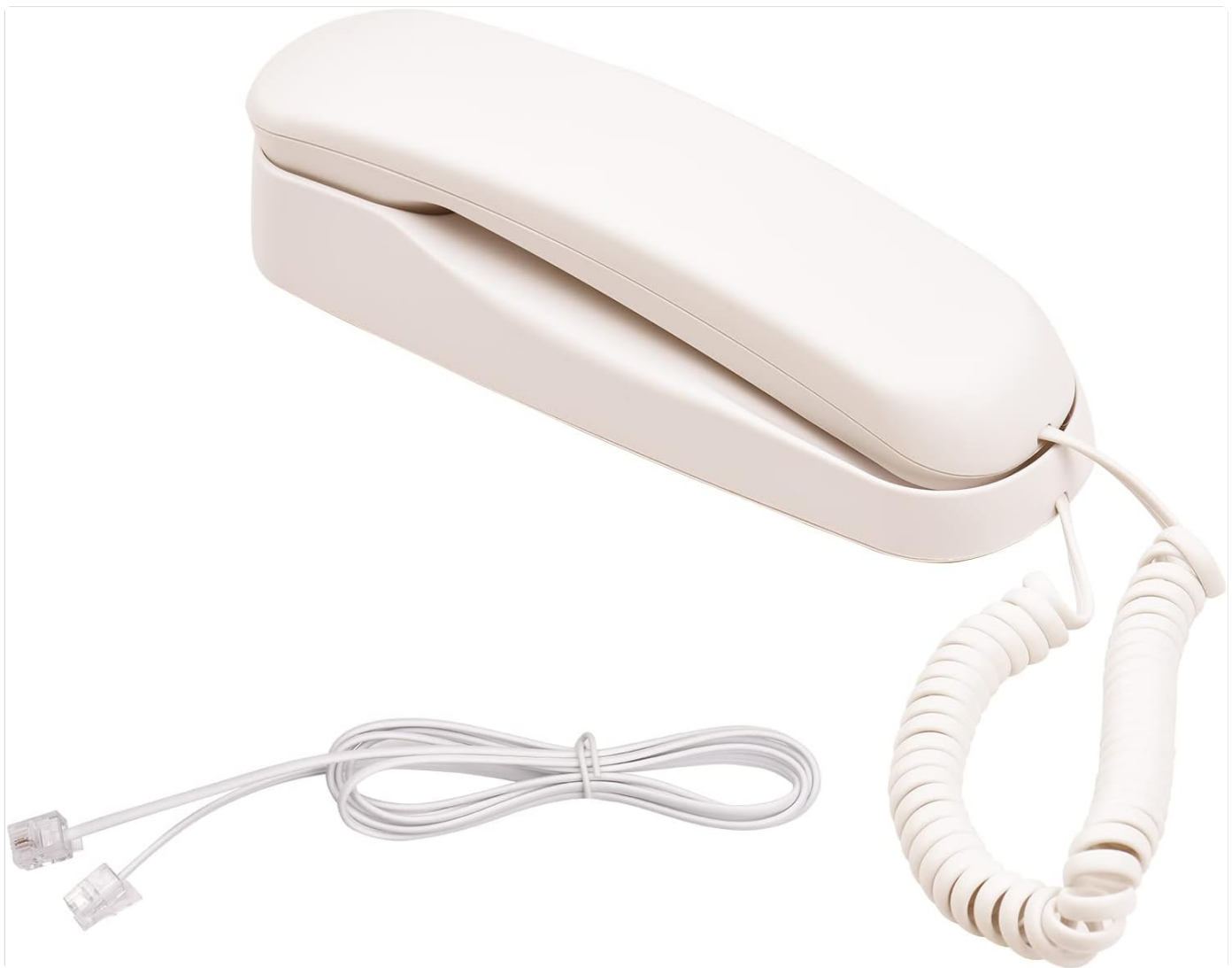
Figure 5: Phone Unit and Included Line Cord