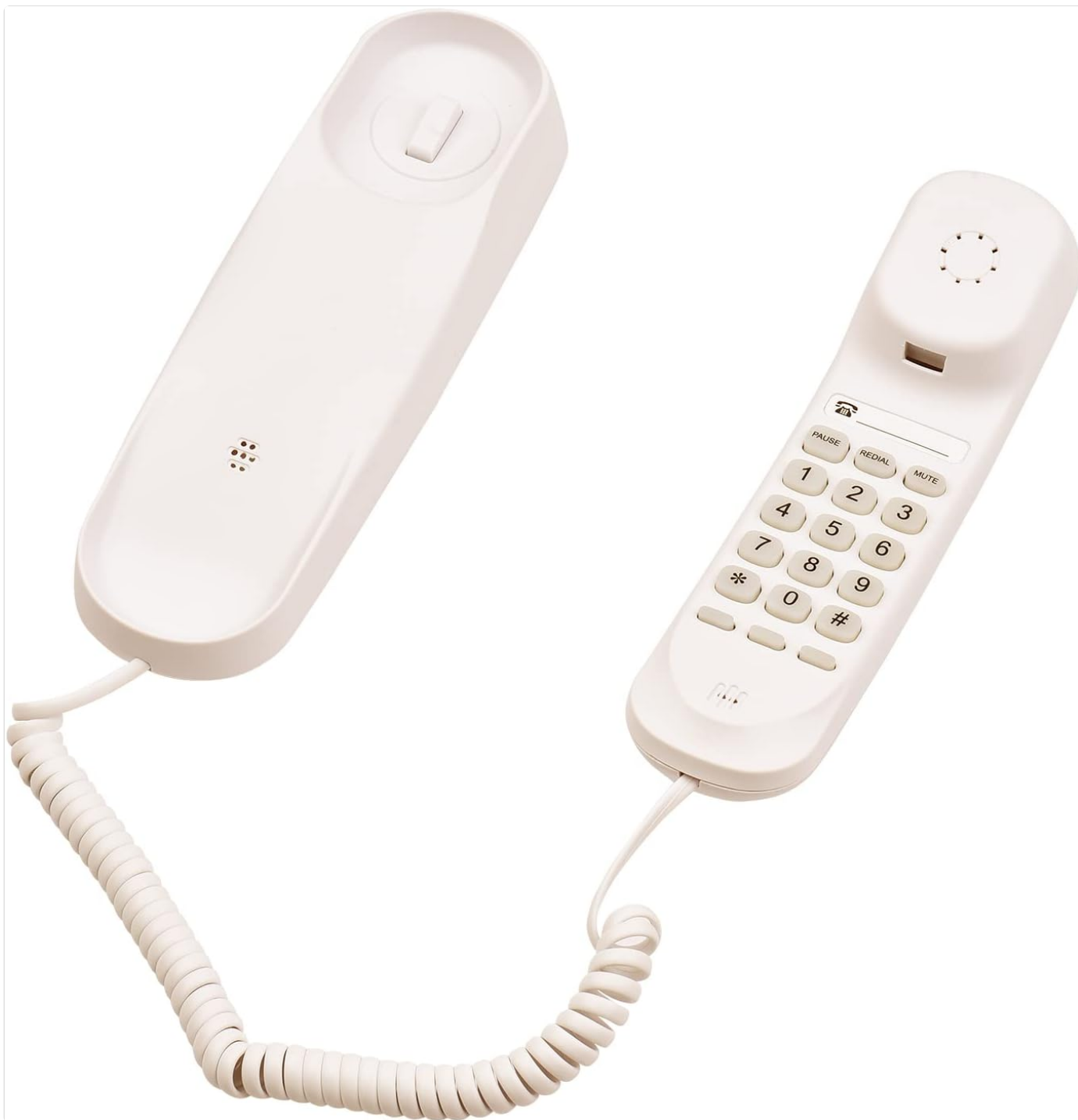
Figure 2: Handset and Base Unit