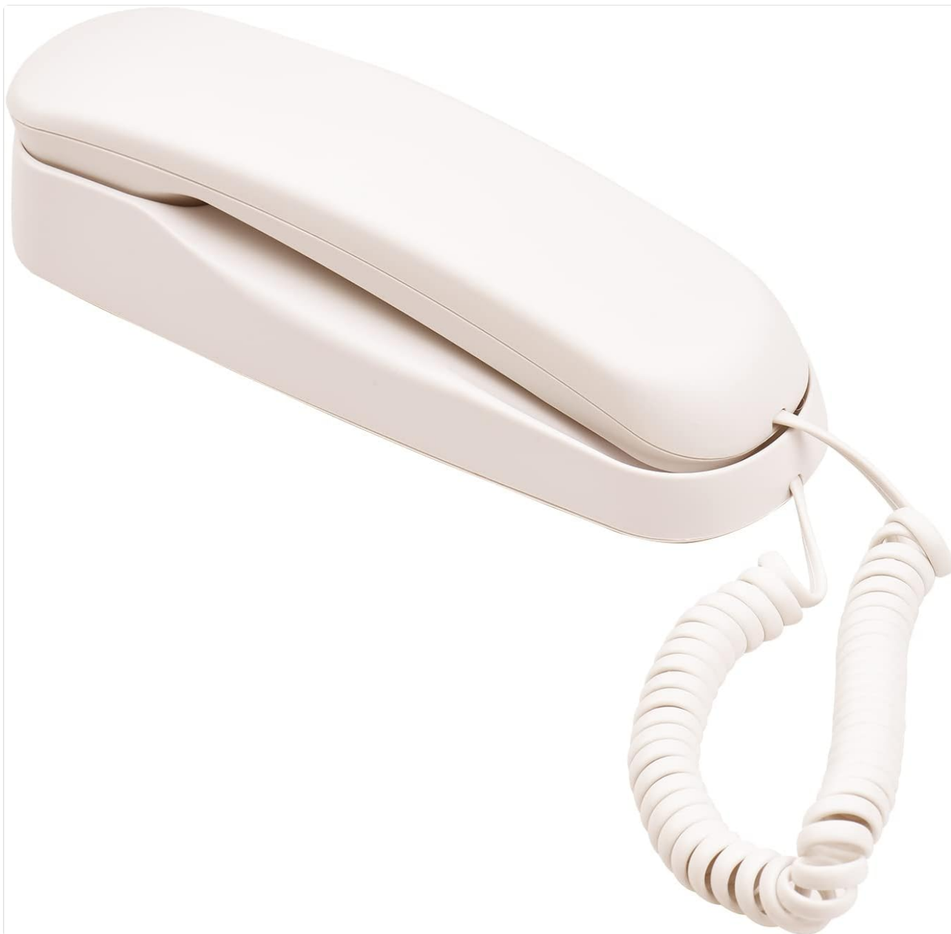
Figure 1: BISOVICE Corded Phone (Beige)