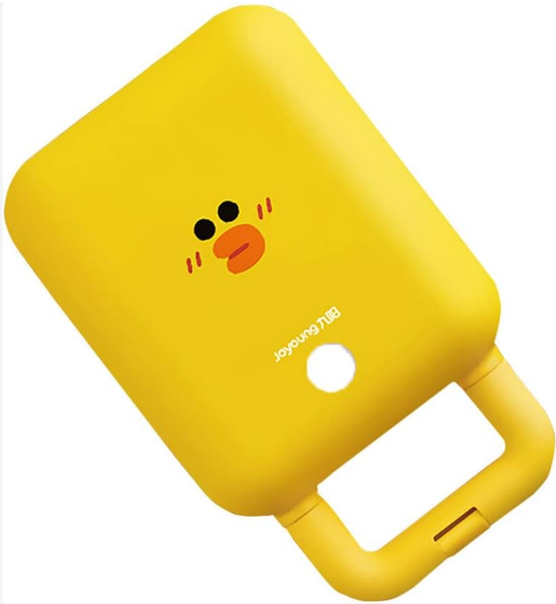
Figure 1.1: The Joyoung x Line Friends 2-in-1 Sandwich and Waffle Maker in its closed position, showcasing the yellow Sally design.