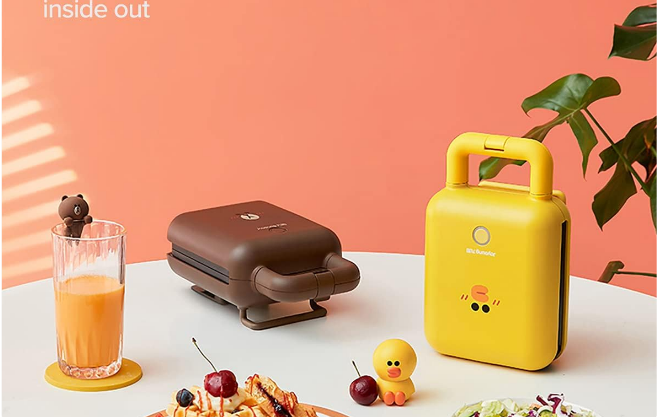
Figure 1.2: The compact and portable design of the Joyoung Sandwich and Waffle Maker, resembling a handbag.

Handbag-like shape, small and cute Kitchen utensils should also be good inside out