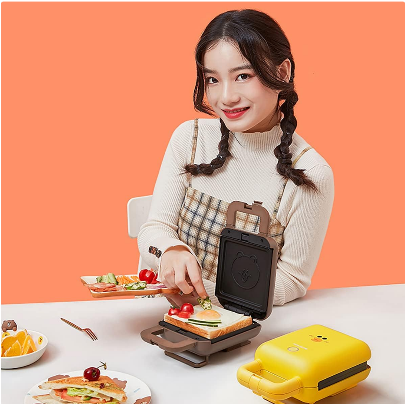
Figure 5.1: A user demonstrating the preparation of a sandwich using the appliance.