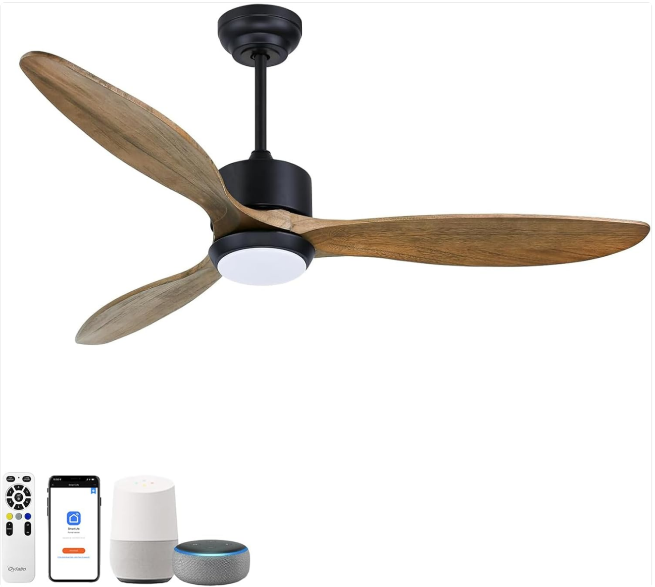
Image: Ovblaim 52 Inch Wood Ceiling Fan with remote control and smart home device compatibility.