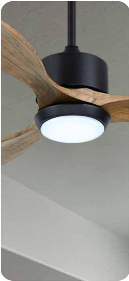
Cool White 6000K