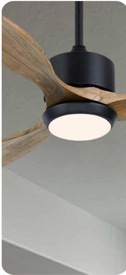
Natural Light 4500K