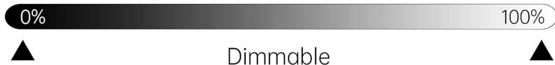
Image: Close-up of the fan's LED light, demonstrating dimming capabilities and three color temperature options: Cool White (6000K), Natural Light (4500K), and Warm White (3000K).