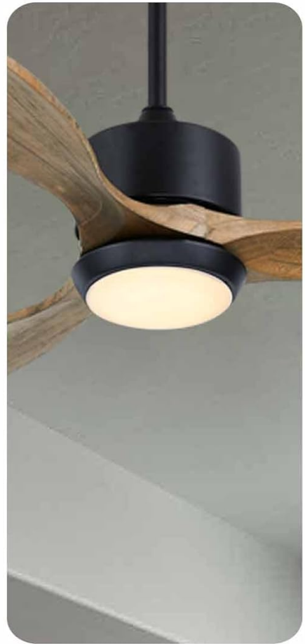
Warm White 3000K