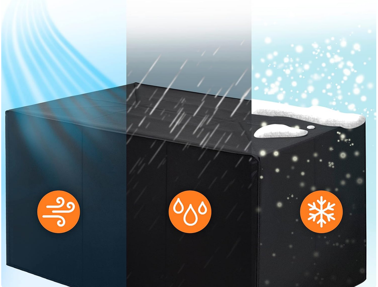
Image: The PVC-coated Oxford cover provides protection against wind, rain, and snow.

Protects the fire table from abnormal damage or heavy wind, rain and snow