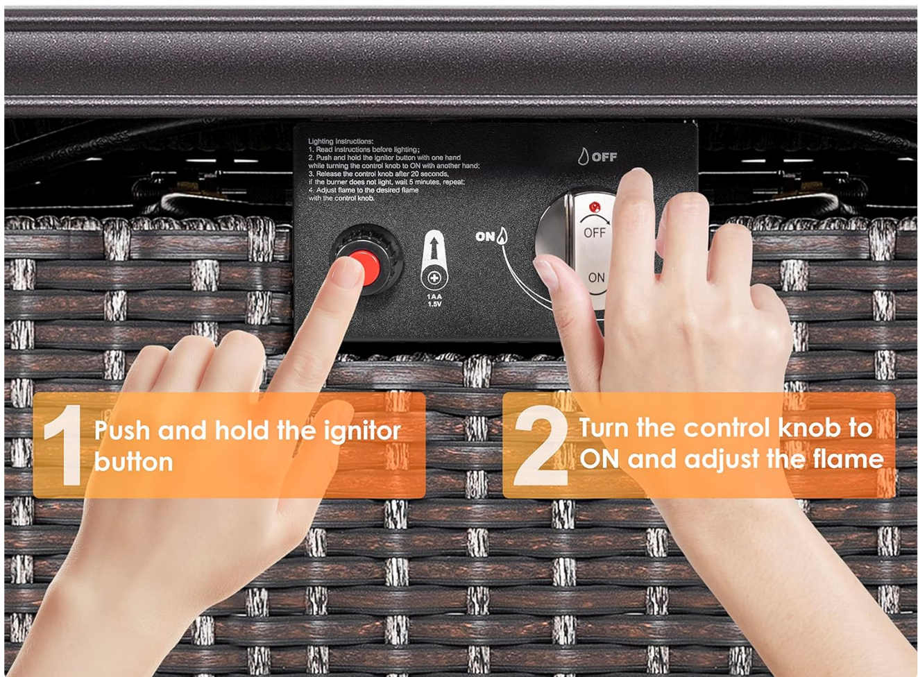
Image: Visual guide on how to use the safe ignition device and adjust the flame.

Easy pulse ignition and flame adjustment with the turn of a knob