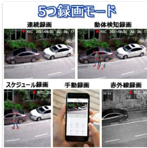
Figure 5: Visual representation of the various recording modes available.