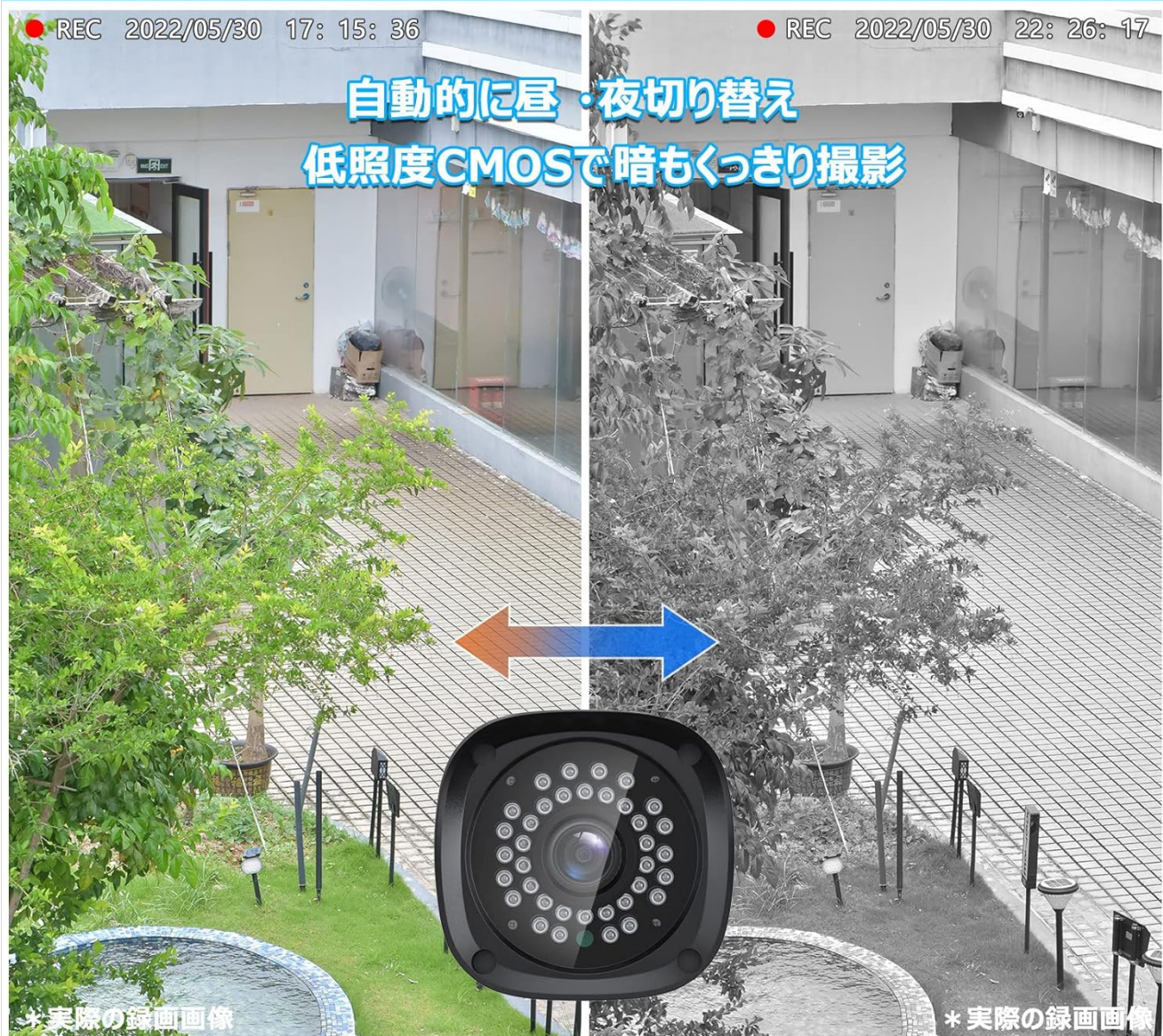
Figure 7: Comparison of day and night vision footage from the camera, demonstrating clarity in low-light conditions.