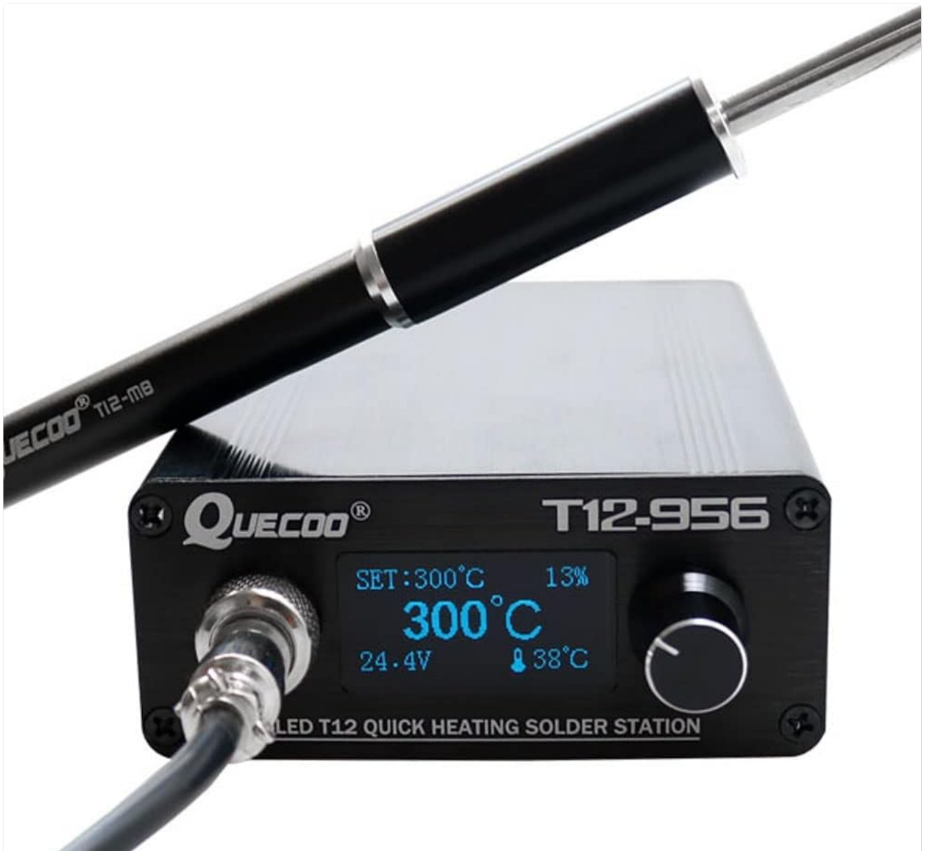
Figure 4.1: QUECOO T12-956 Soldering Station with M8 handle and T12-K tip connected.

The T12-956 soldering station features a compact design with an OLED display for clear information. It includes a rotary encoder for easy temperature adjustment and menu navigation.