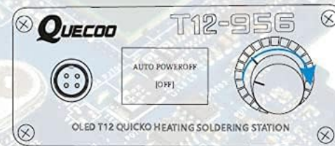
Figure 7.2: Navigating to and adjusting the Auto Power Off setting.