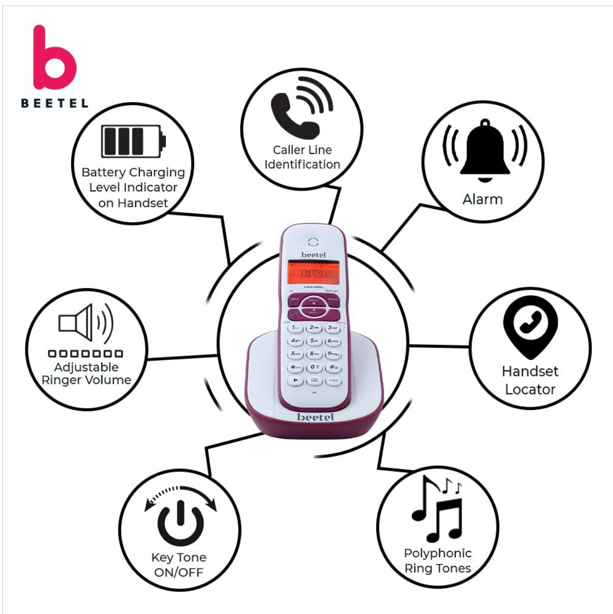
Image: A diagram illustrating key features such as battery charging indicator, caller line identification, alarm, handset locator, polyphonic ring tones, key tone ON/OFF, and adjustable ringer volume.

Video: This video highlights various features of the Beitel X73N, including its illuminated keypad, phonebook capacity, LCD display, 2-way speakerphone, out-of-range warning, and manufacturer warranty.