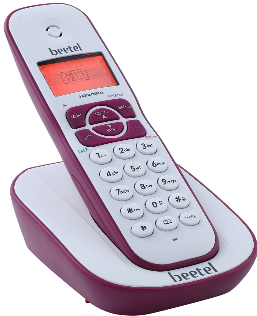
Image: Beetel X73N Cordless Phone Handset and Base Unit.