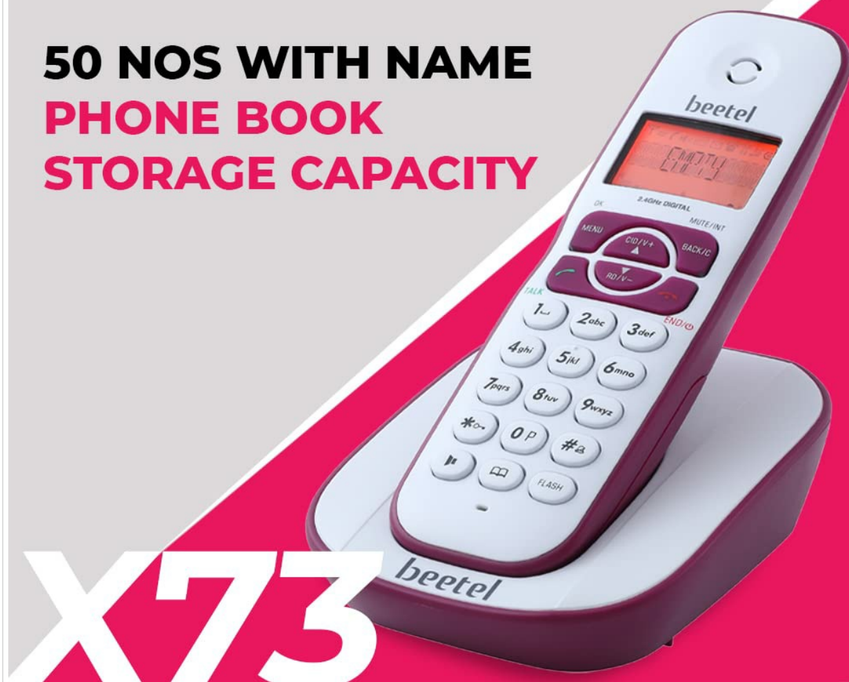
Image: The phone offers storage capacity for up to 50 numbers with names in its phonebook.