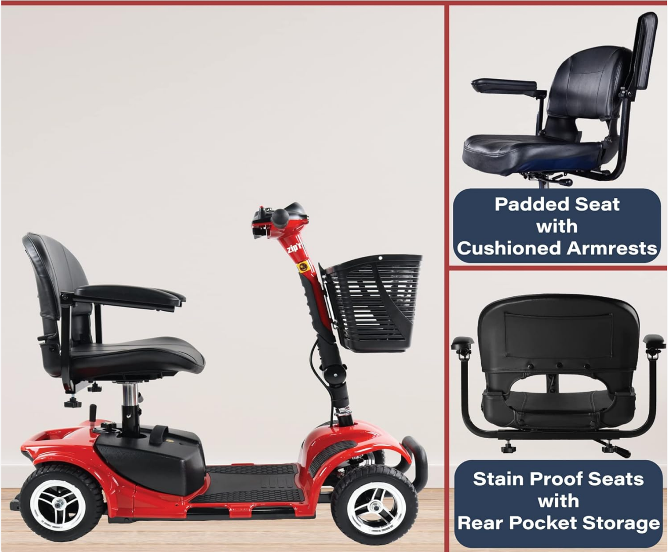
Figure 4.3: Details on the comfortable and supportive seating options.