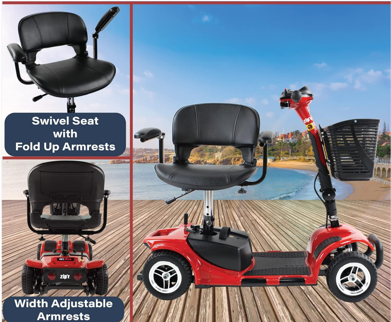
Figure 4.4: Features of the swivel seat for easy access and adjustable armrests.