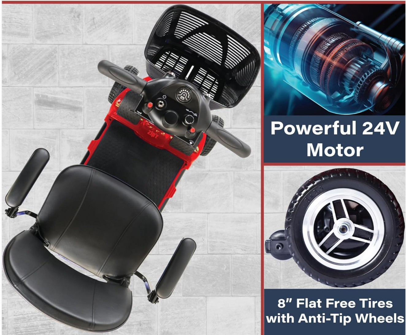
Figure 4.2: Components related to the scooter's powerful motor and durable tires.