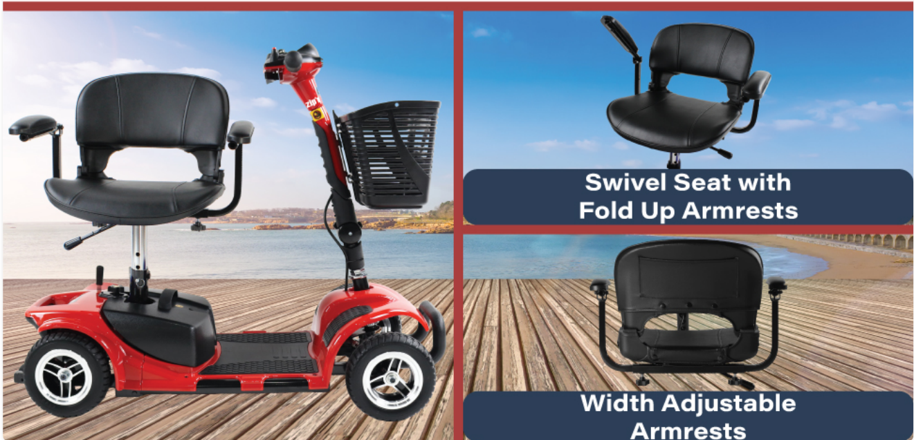
Figure 4.6: Labeled diagram of the Zipr Roo 4 Wheel Mobility Scooter's main components.