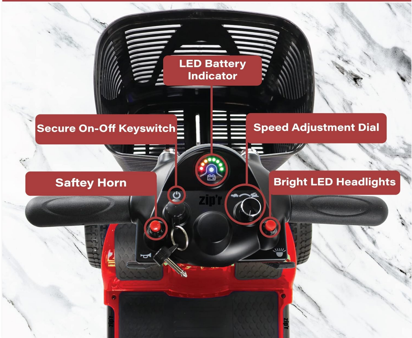
Figure 3.1: Detailed view of the easy-to-use control panel, highlighting the LED battery indicator, speed adjustment dial, on-off keyswitch, safety horn, and bright LED headlights.