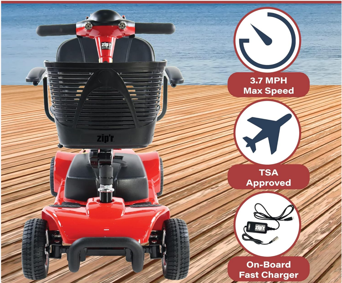
Figure 4.1: Key performance indicators including battery range, speed, and charging capabilities.