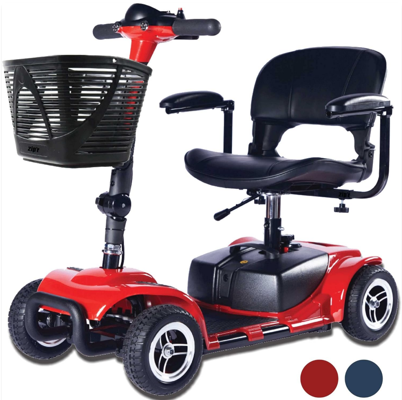
Figure 1.1: The Zipr Roo 4 Wheel Mobility Scooter, showcasing its compact design and integrated basket.