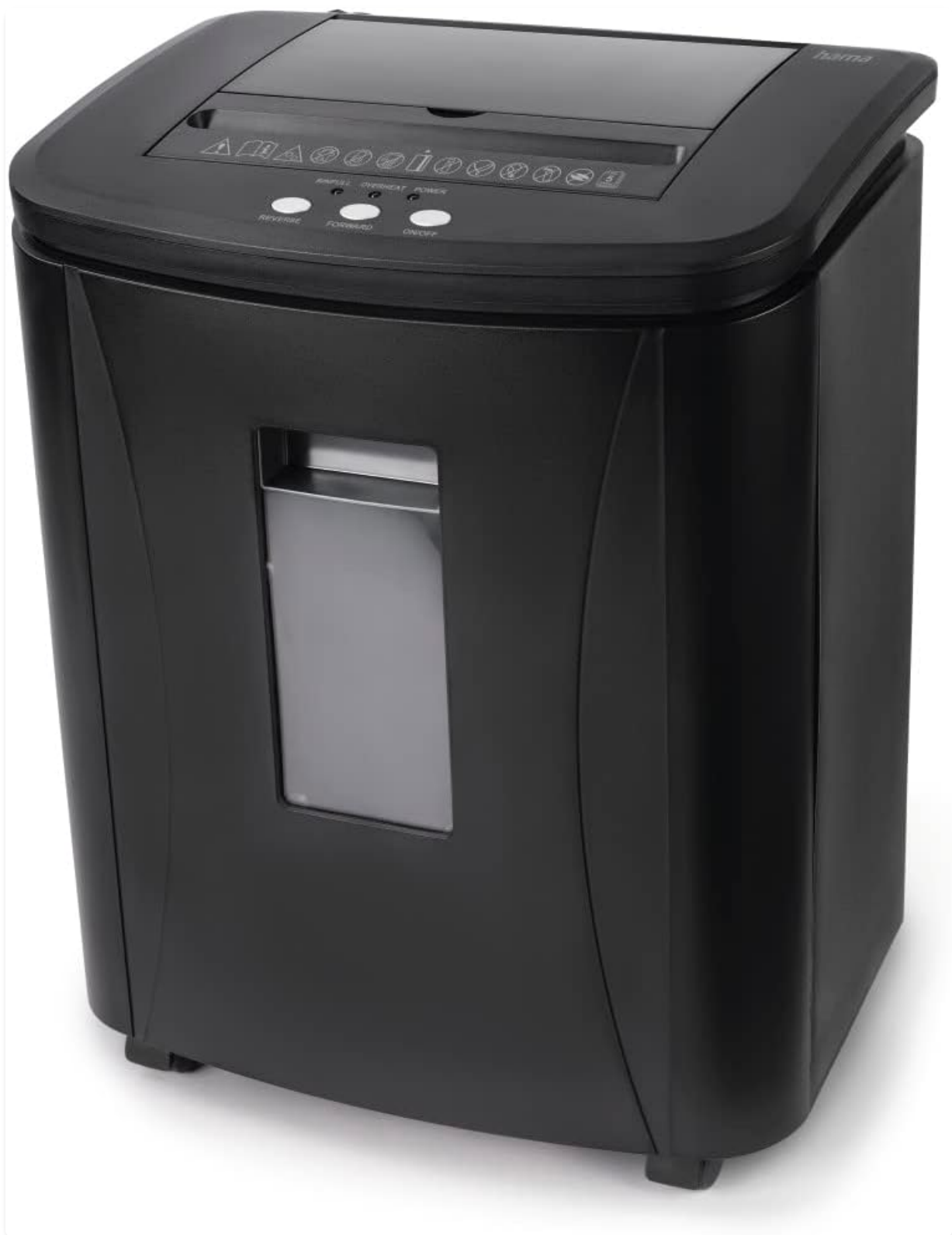
Image: The Hama Premium Auto M120 P-4 Document Shredder, a black, compact unit with a transparent window for the waste bin and a control panel on top.