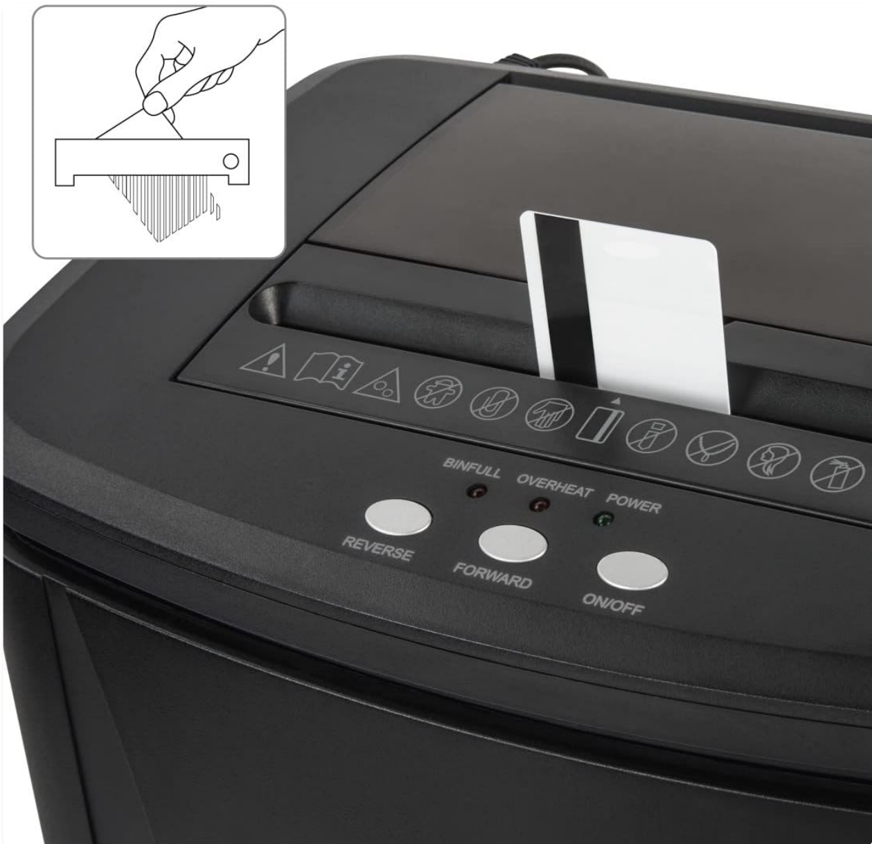
Image: A close-up of the Hama shredder's control panel and feed slot, with a credit card being inserted into the dedicated slot for shredding.