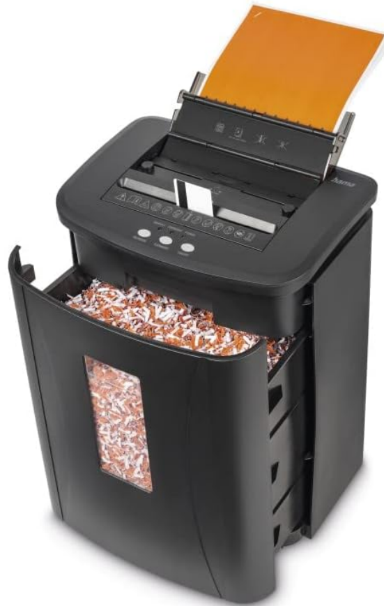
Image: The Hama shredder with its waste bin open, showing micro-cut shredded paper. Icons indicate Security Level P4 and GDPR compliance.