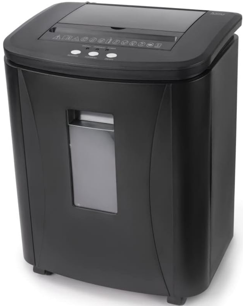
Image: A Hama shredder with a graphic indicating to keep fingers away from the shredding mechanism, emphasizing user safety.