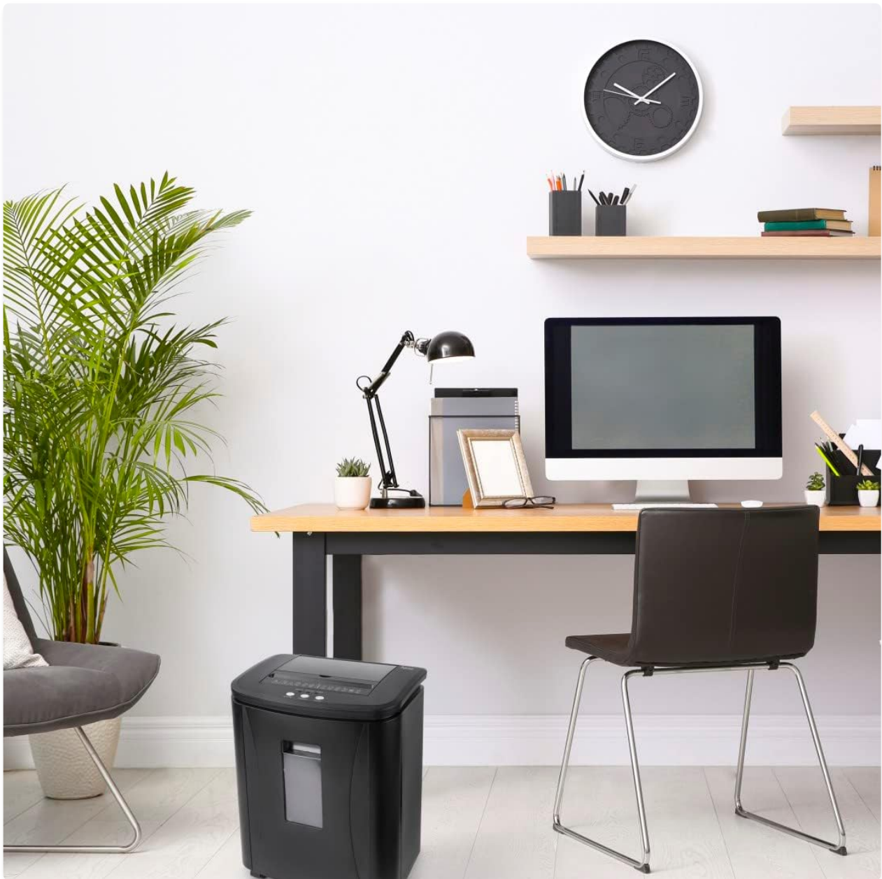
Image: A Hama shredder next to a symbol indicating to avoid fire and overheating, highlighting important operational precautions.