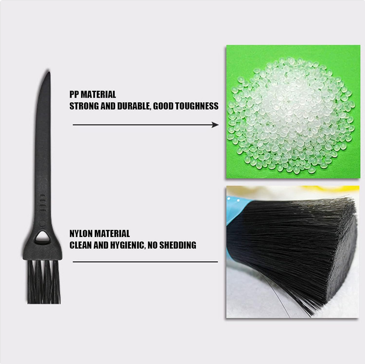
Figure 3: Material composition. This image illustrates the PP material used for the handle, emphasizing its strength and durability, and the nylon bristles, highlighting their cleanliness and non-shedding properties.