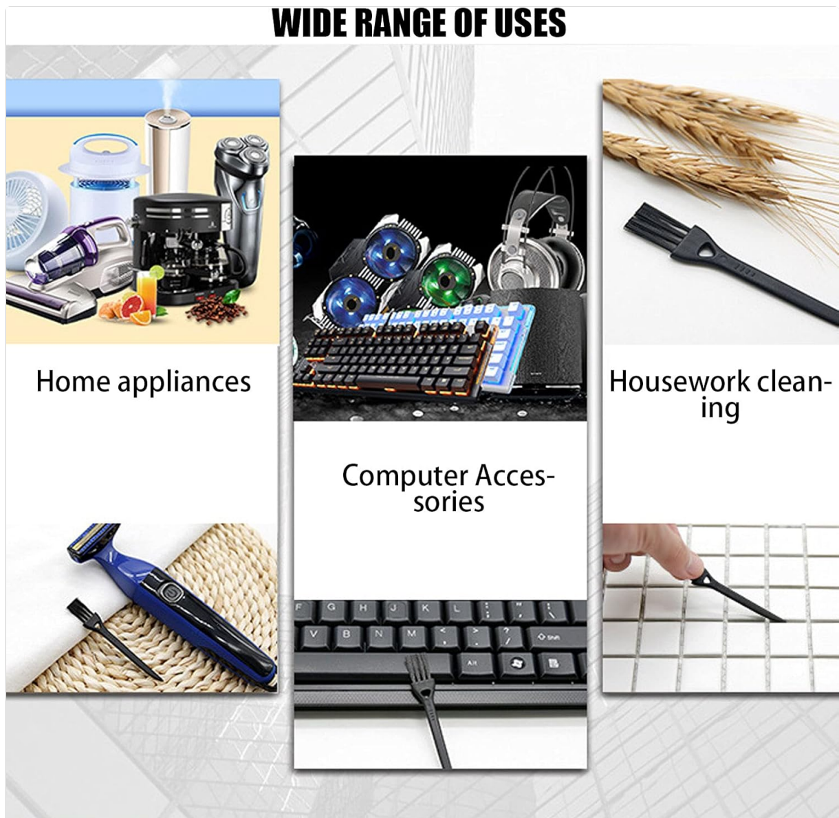
Figure 5: Versatile applications. This image demonstrates the brush's utility across various items, including home appliances like shavers and coffee makers, computer accessories, and for general household cleaning.