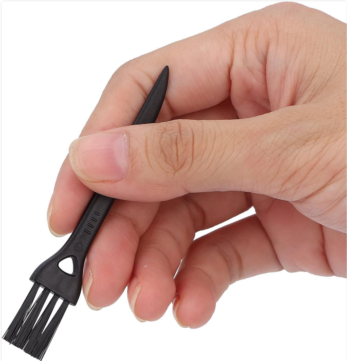
Figure 2: Brush held in hand. This image demonstrates the compact size of the brush, held comfortably in an adult's hand, highlighting its portability.