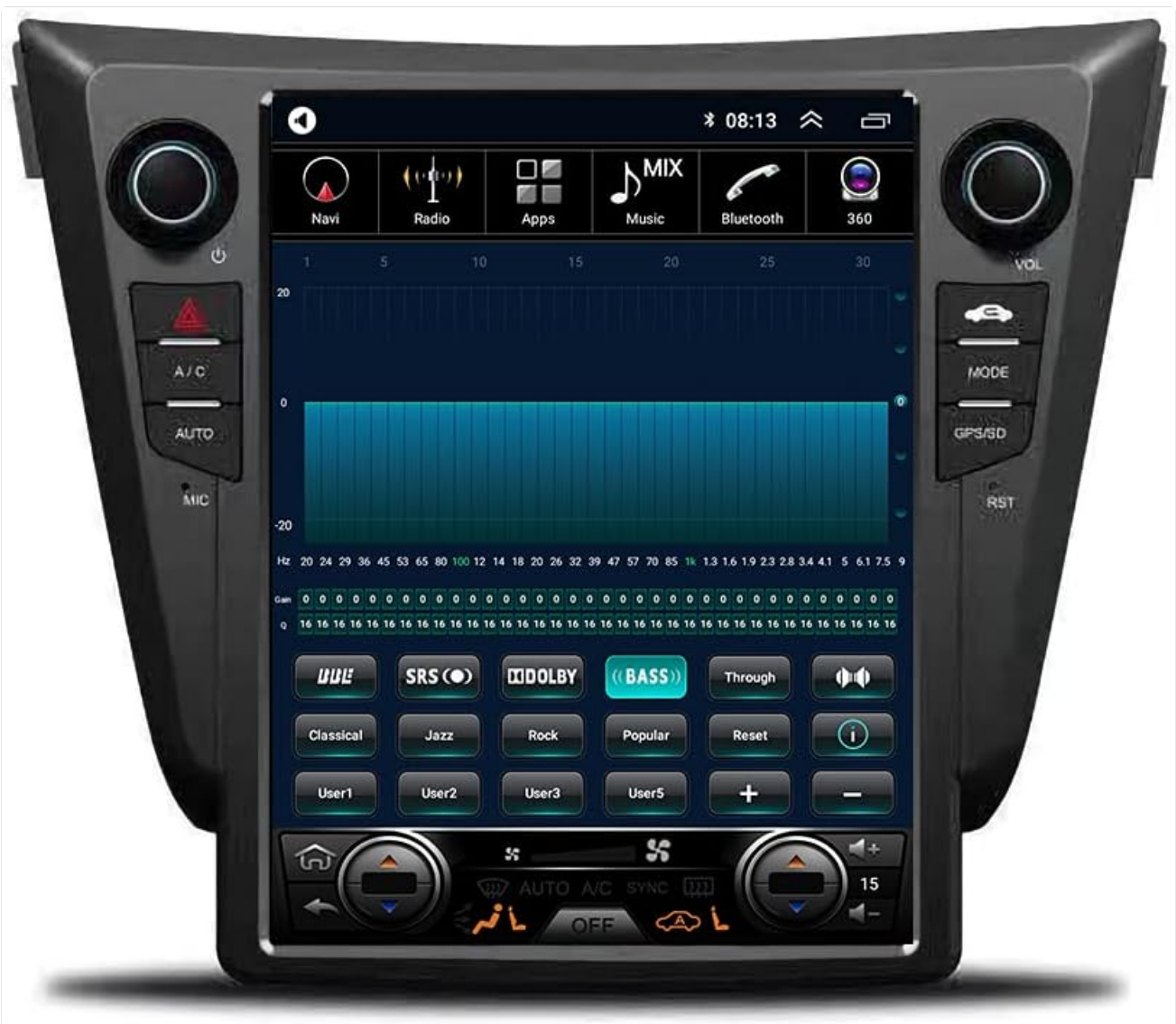
Image: The equalizer settings screen, showing adjustable frequency bands and preset sound modes like Classical, Jazz, Rock, and Popular, along with options for Dolby and Bass enhancement.