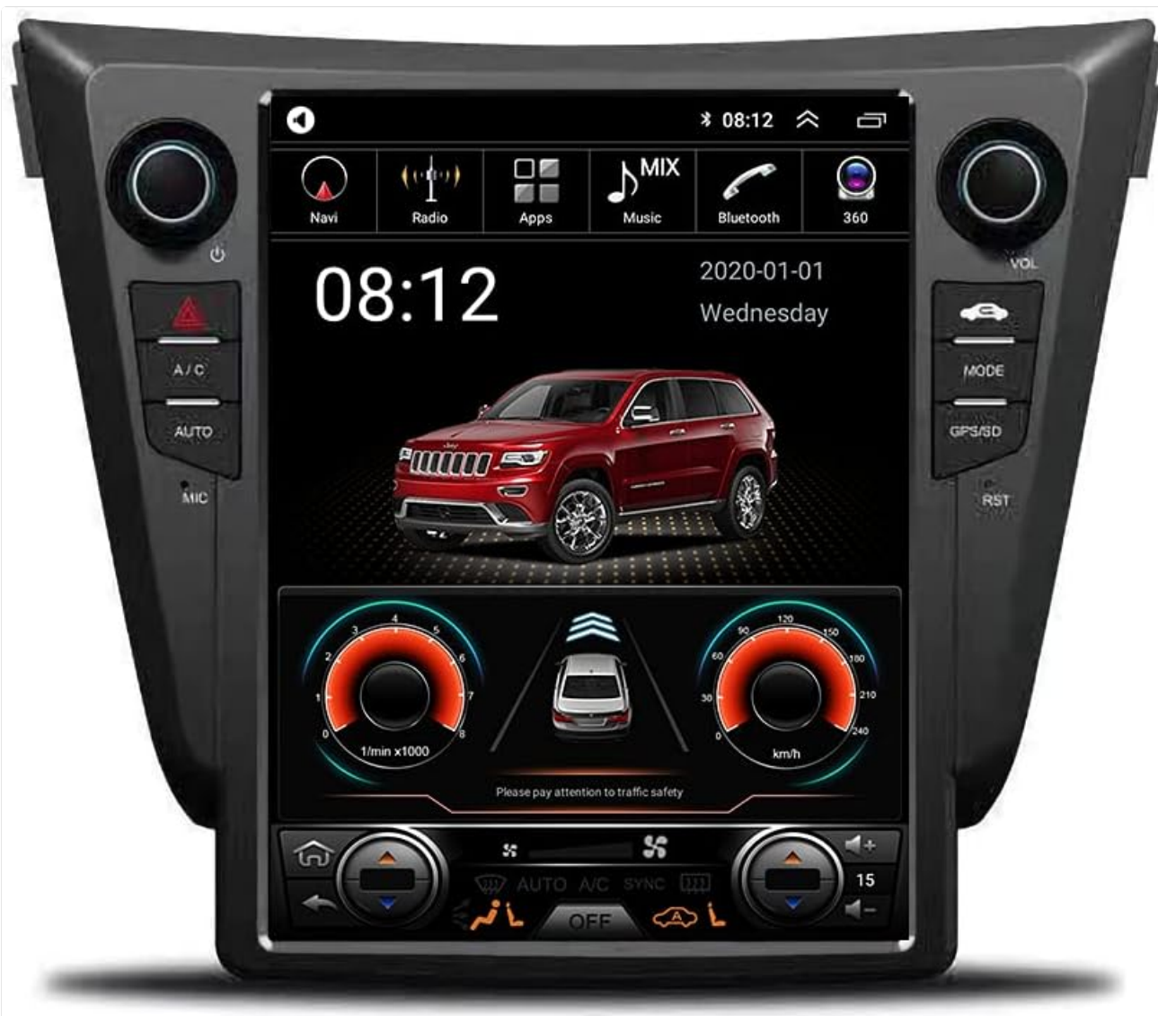
Image: A car information display screen showing digital gauges for RPM and speed, along with a visual representation of a car.