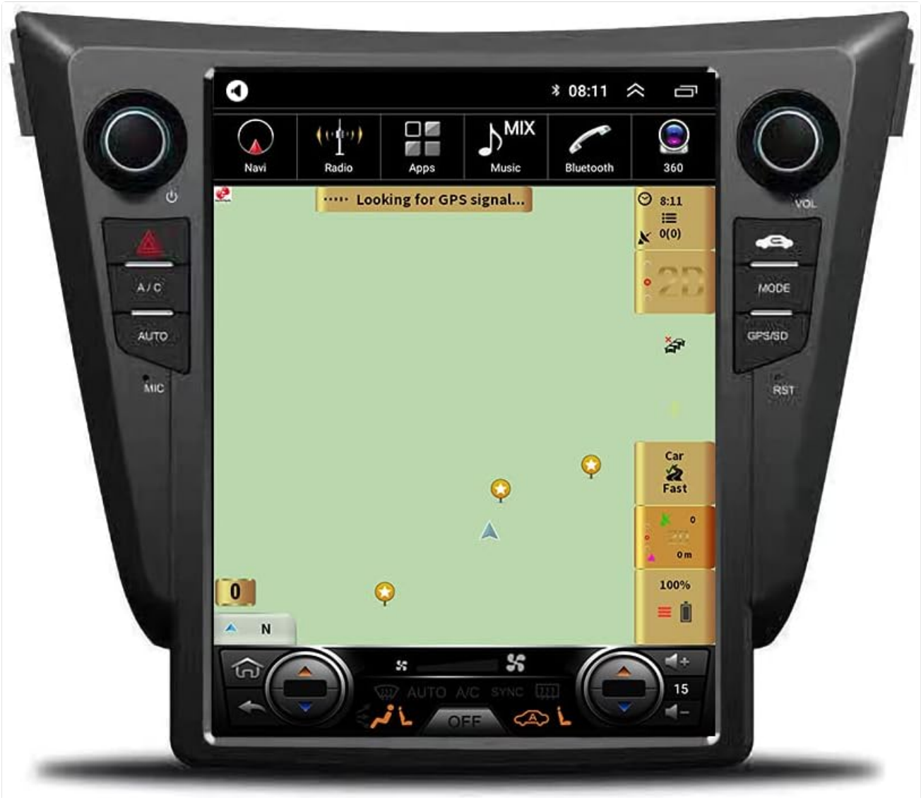
Image: The navigation interface showing a map and indicating that the system is searching for a GPS signal.

The unit includes built-in GPS functionality for precise navigation. Access pre-installed maps or download your preferred navigation applications from the Google Play Store.