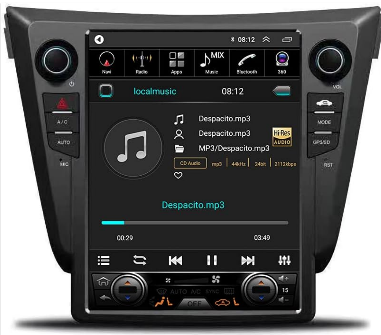
Image: The music player interface displaying details of a song titled 'Despacito.mp3' currently playing, with playback controls and audio quality indicators.