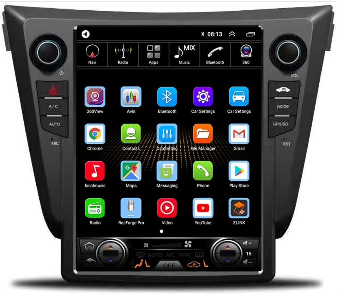
Image: The main application screen showing icons for various functions and apps, including Navigation, Radio, Music, Bluetooth, Car Settings, Chrome, Maps, Phone, and the Google Play Store.