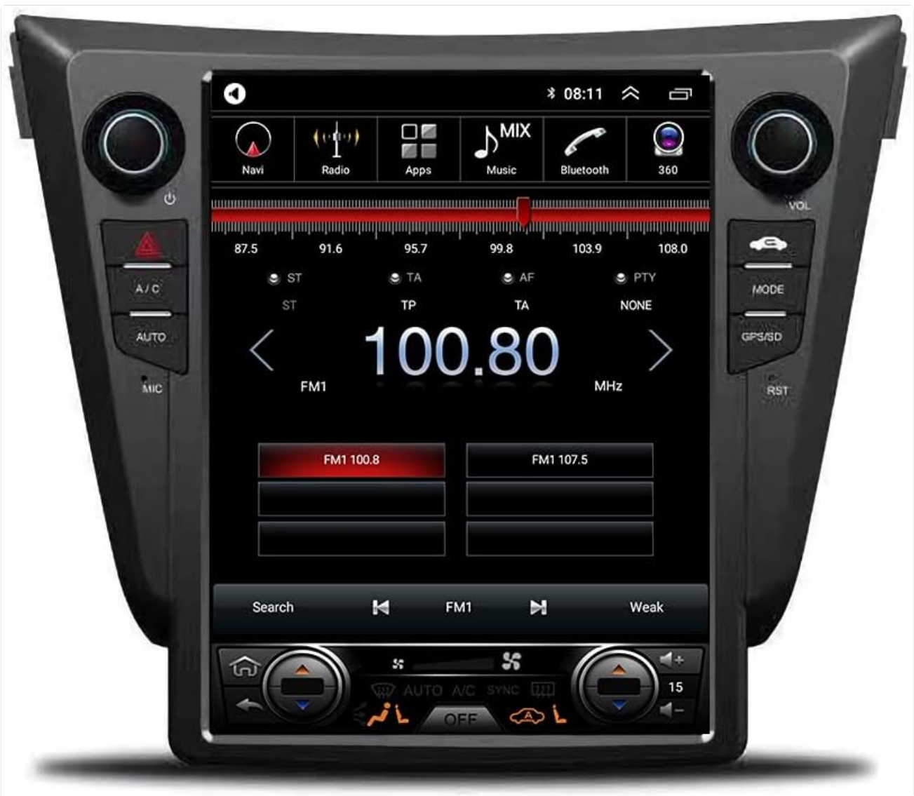
Image: The radio interface showing the current FM frequency tuned to 100.80 MHz, with options for station search and presets.