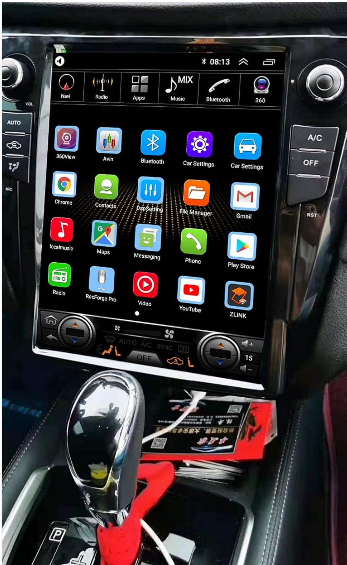
Image: The KUNFINE 12.1-inch Android Car Radio seamlessly integrated into a Nissan Qashqai dashboard, showcasing its large touchscreen display and physical controls.