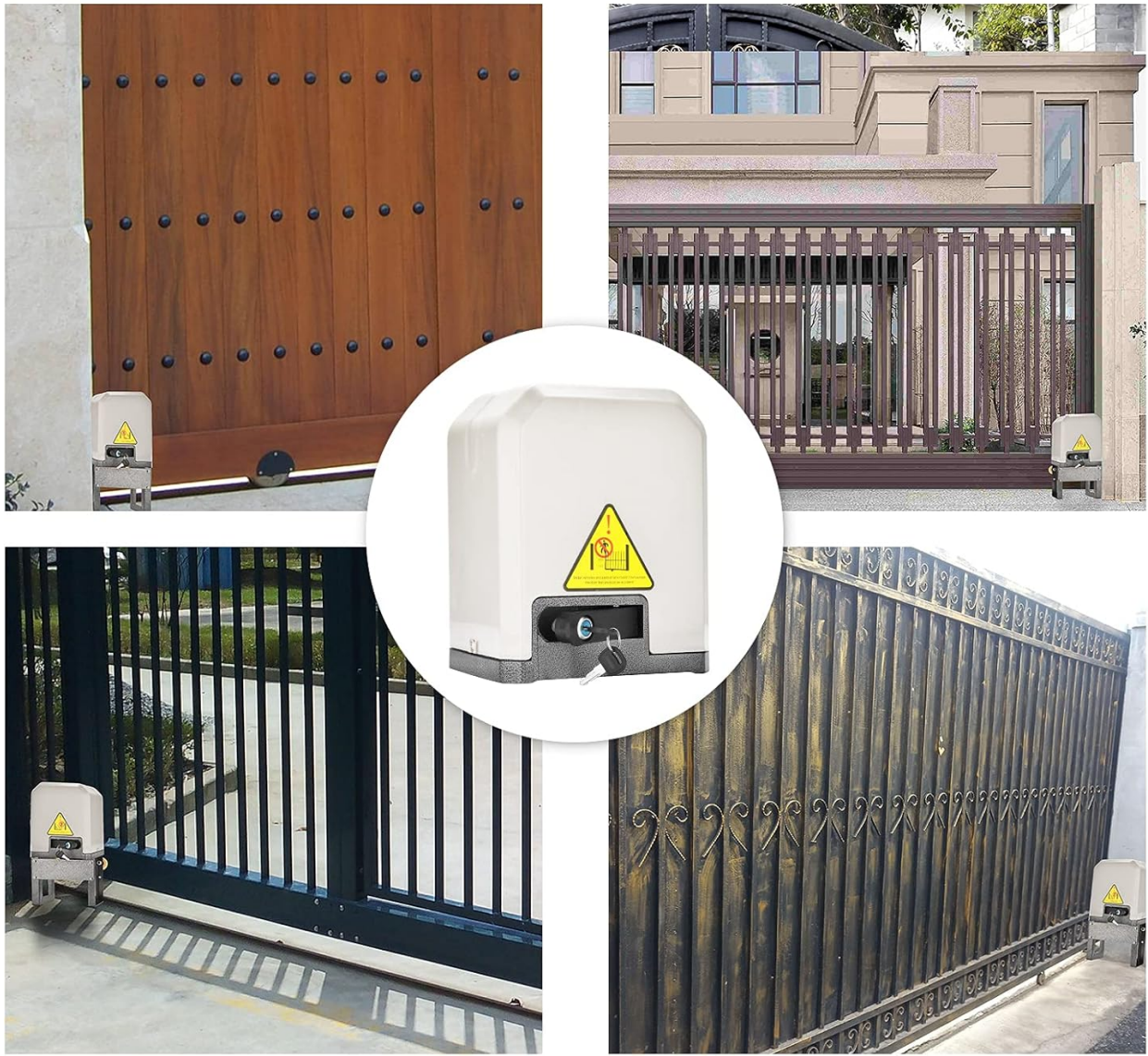
Figure 4.1: Visual representation of a gate opener's capacity. This JIELI JY7 model supports gates up to 1400 pounds and 20 feet in length.

Max Gate Weight: 1300lb Max Gate Length: 40 ft