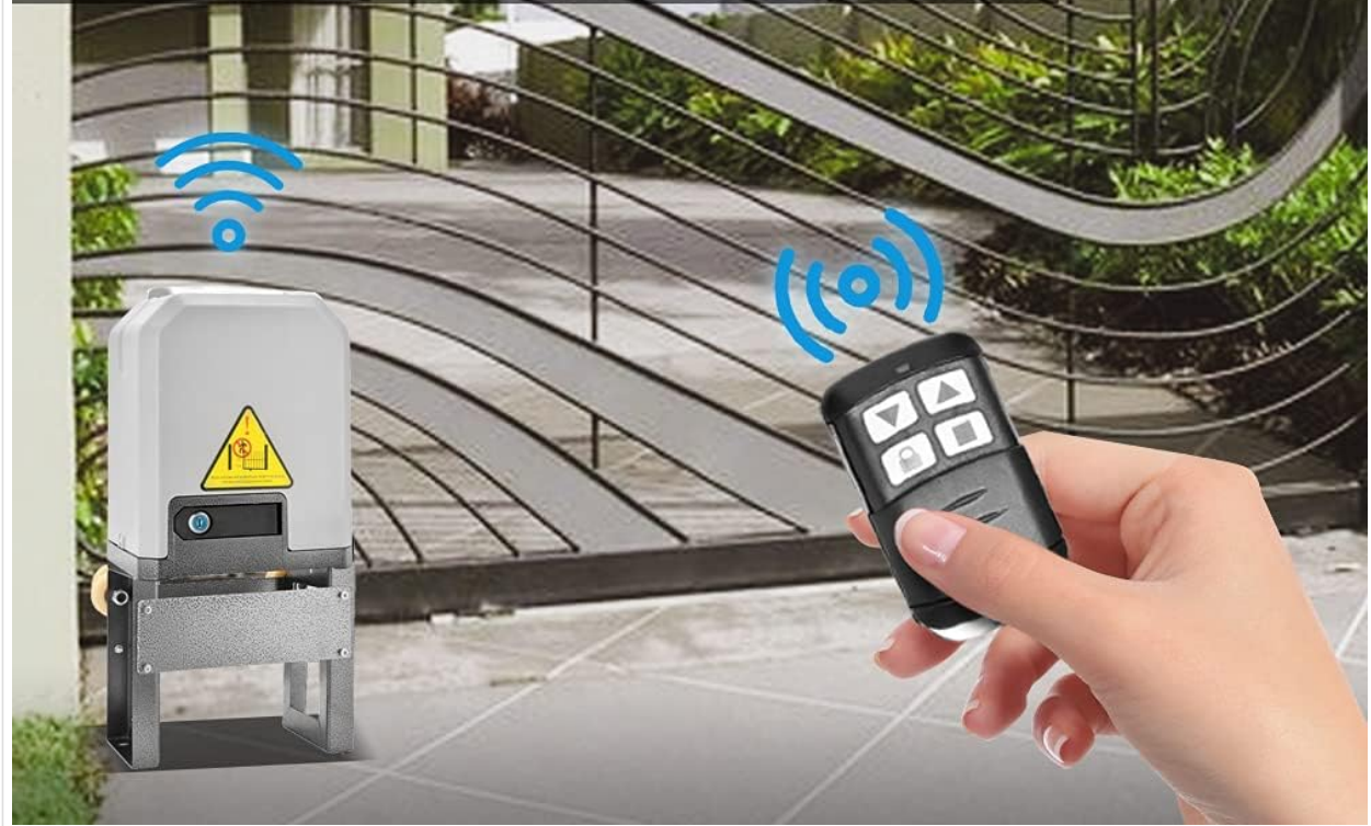
Figure 5.1: A hand holding a remote control, demonstrating the ease of operating the gate opener from a distance.

Chain Driven Sliding Gate Opener for Gates up to 1300 Pounds