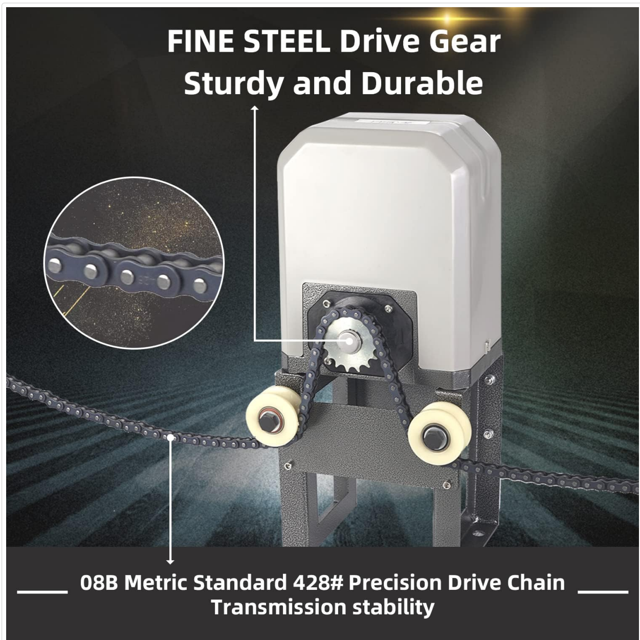
Figure 4.2: Close-up view of the fine steel drive gear and the 08B Metric Standard 428# Precision Drive Chain, highlighting the robust transmission system.