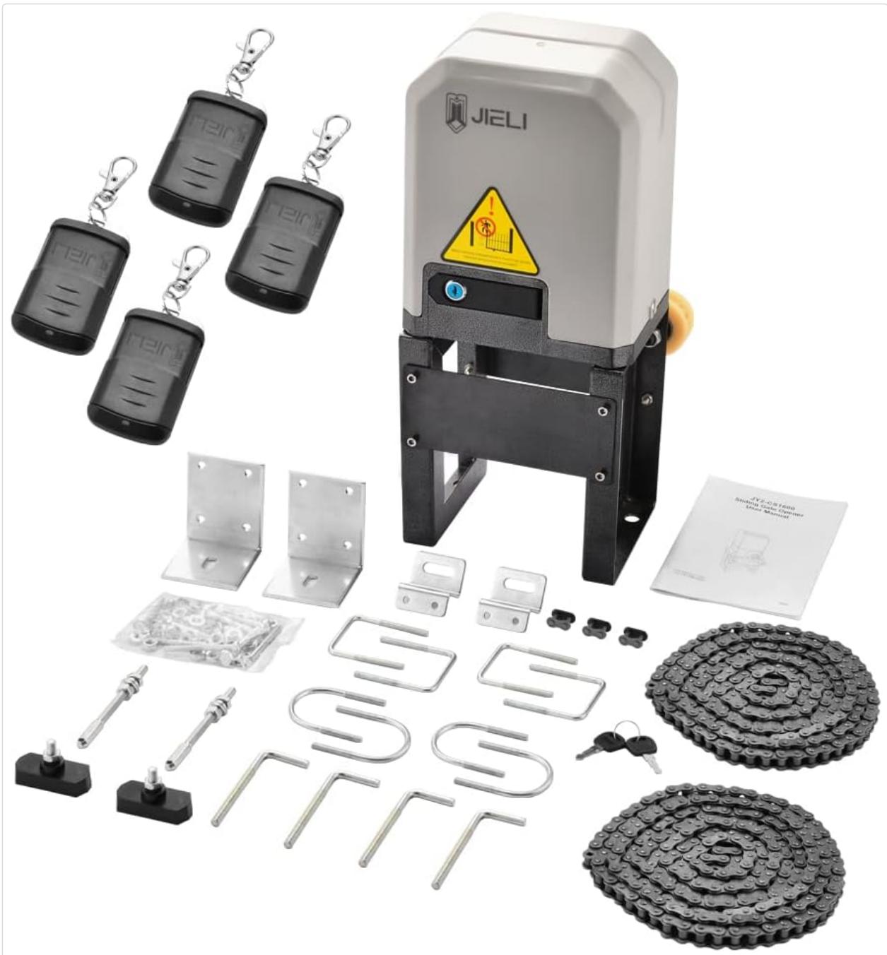
Figure 3.1: Overview of the JIELI JY7 Automatic Sliding Gate Opener kit, showing the main unit, four remote controls, mounting brackets, and chains.