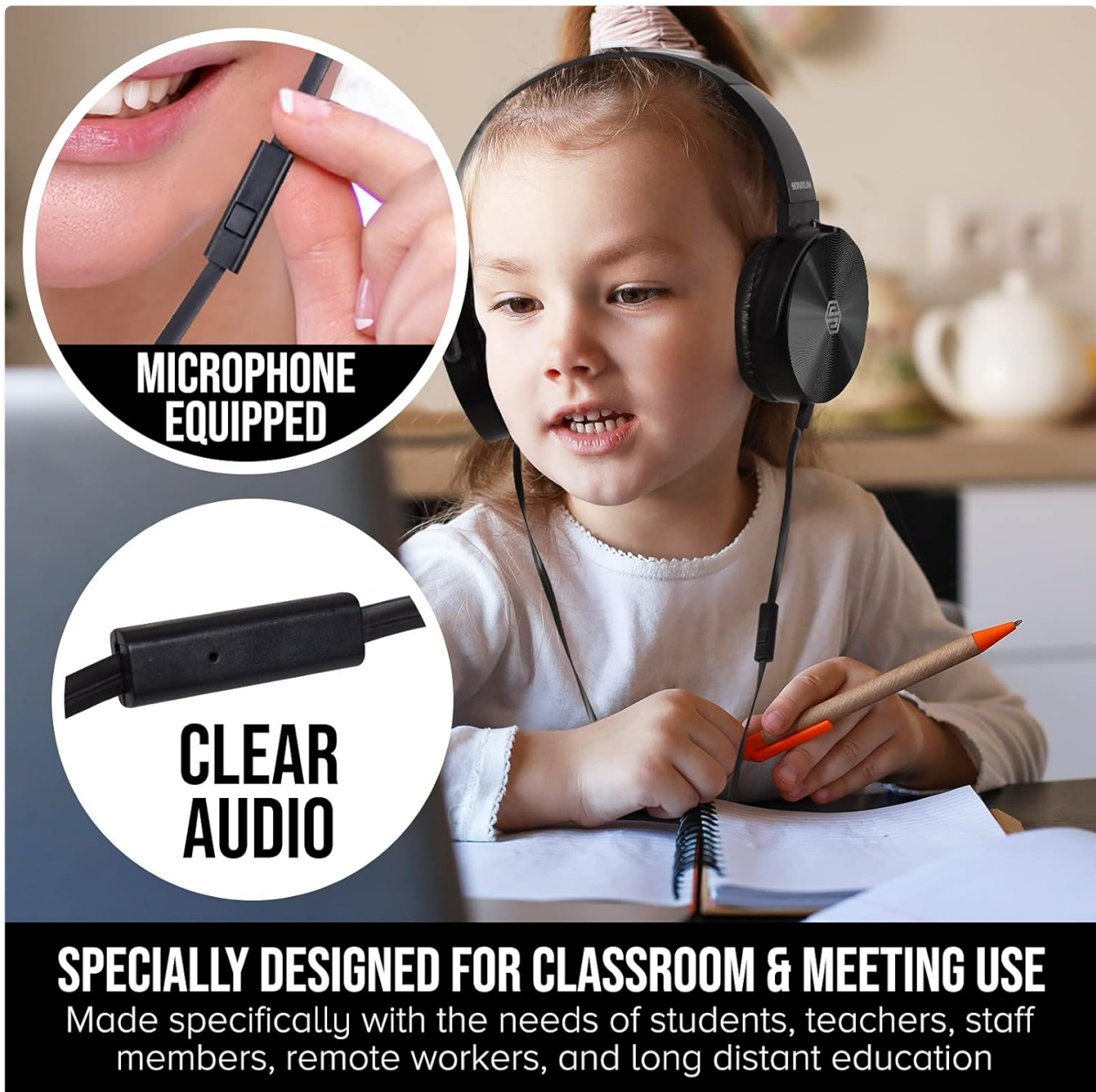
Image: A detailed view of the Sonitum headphones, illustrating the adjustable headband, swivel earcups for easy storage, and the robust 3.5mm jack with a thick cable.