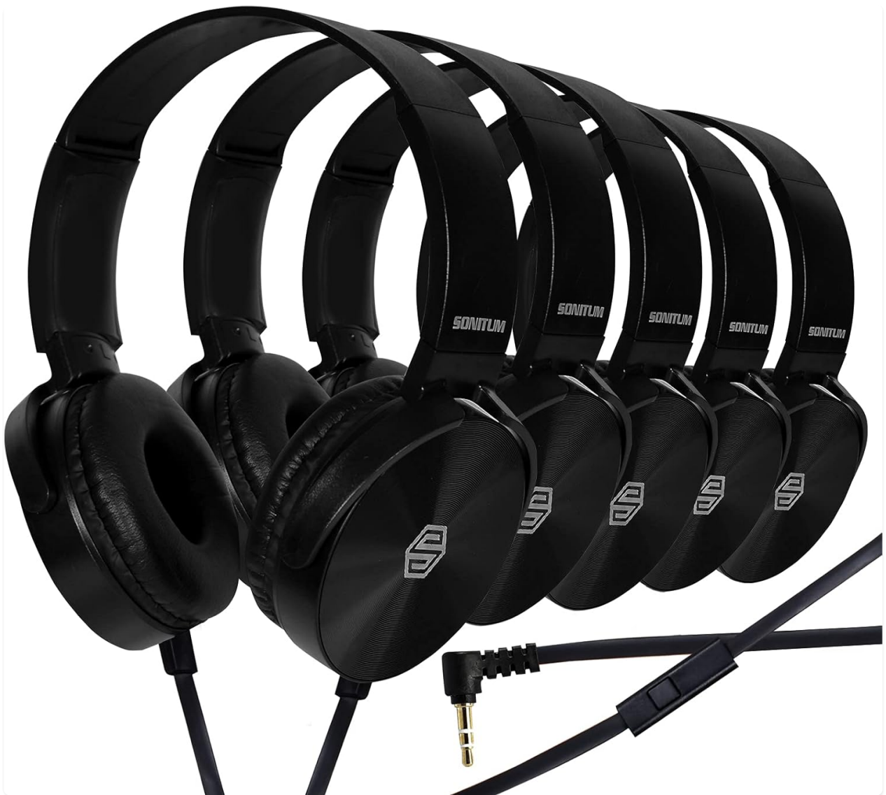
Image: A bulk pack of black Sonitum headphones, highlighting their uniform design and the 3.5mm audio jack.