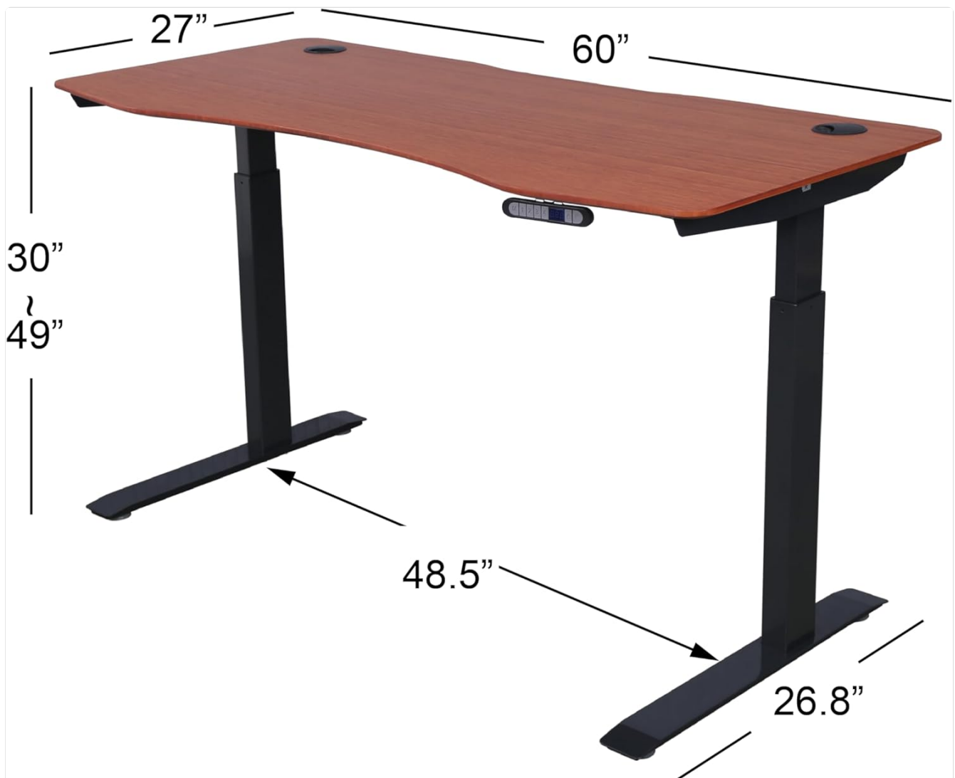
Figure 2: Desk Dimensions (60" W x 27" D, adjustable height 30"-49")