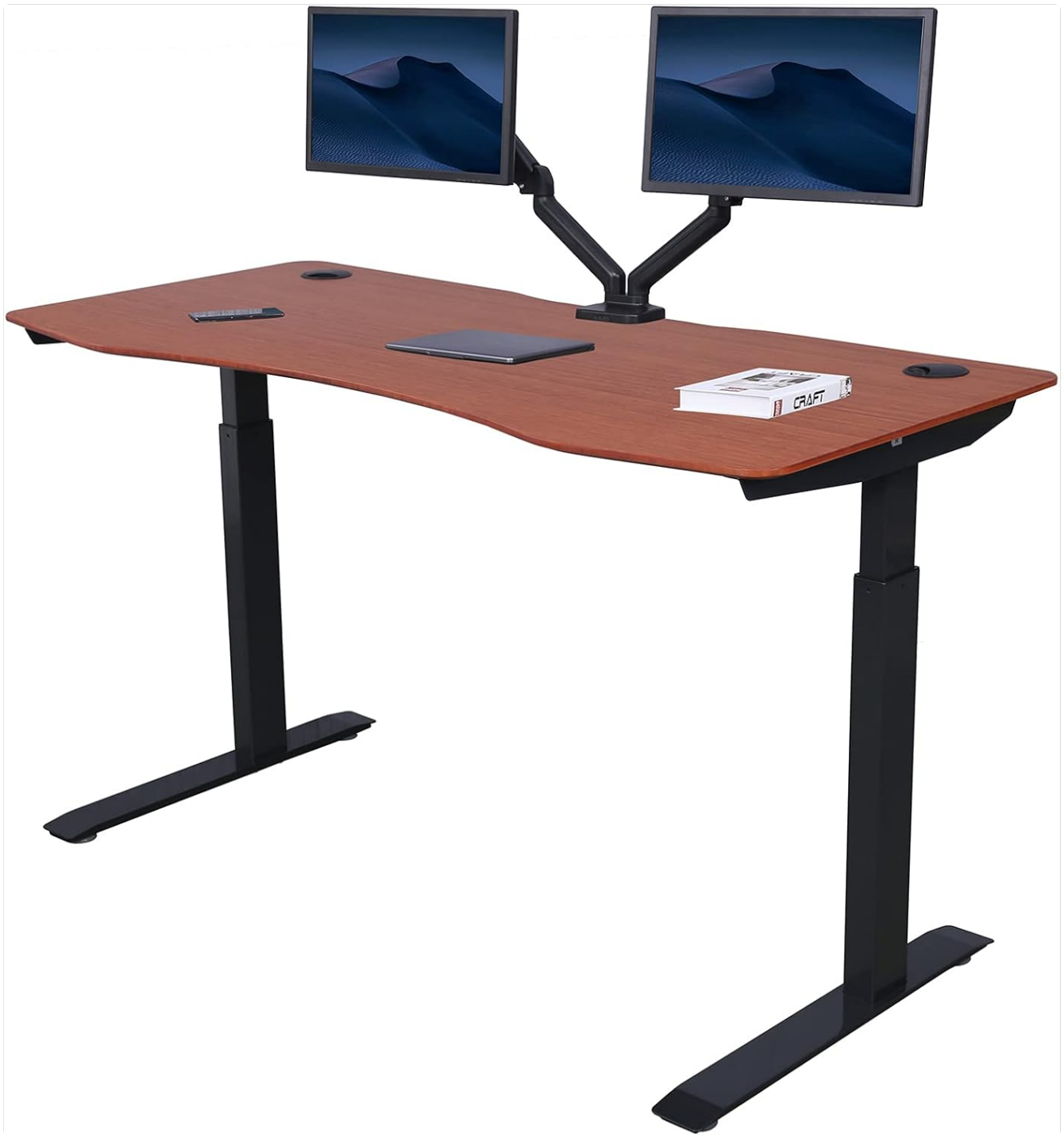
Figure 1: ApexDesk Elite Pro Series Electric Height Adjustable Standing Desk (Curved Bamboo 60")