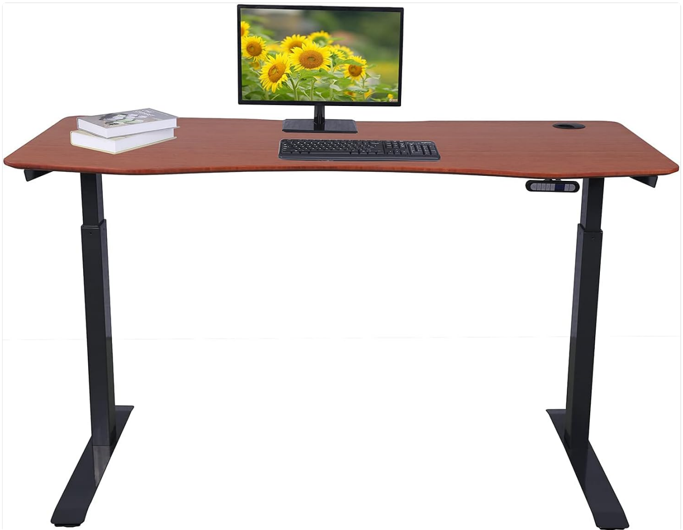
Figure 4: Programmable Height Controller