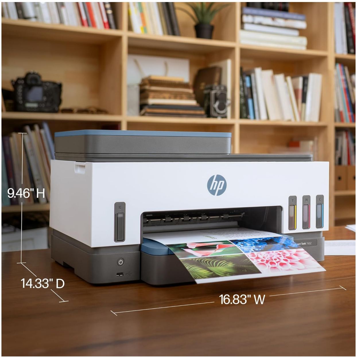
Image: The HP Smart Tank 7602 printer with its physical dimensions clearly indicated.