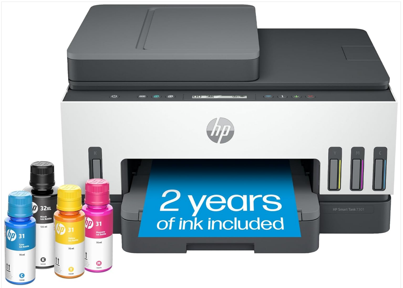
Image: The HP Smart Tank 7301 printer shown with its four included ink bottles (black, cyan, magenta, yellow), ready for initial setup.