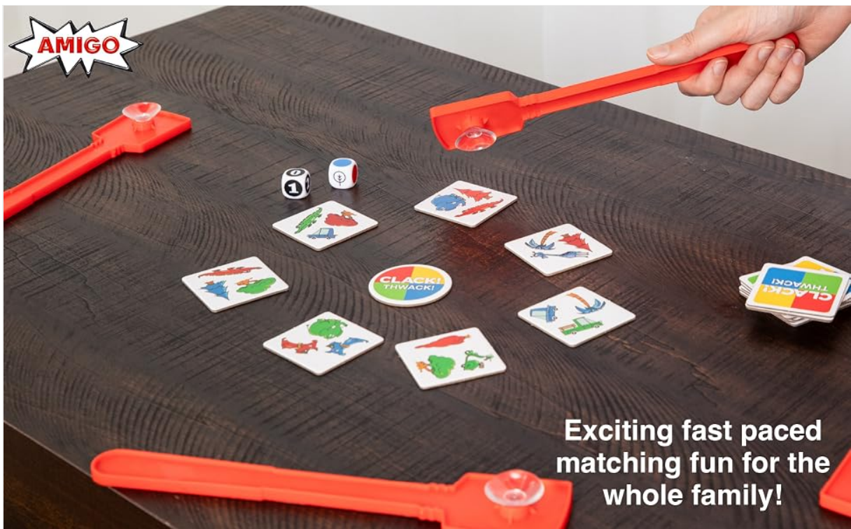
Image: Game cards and bonus disc arranged on a wooden table, with thwackers positioned around them.