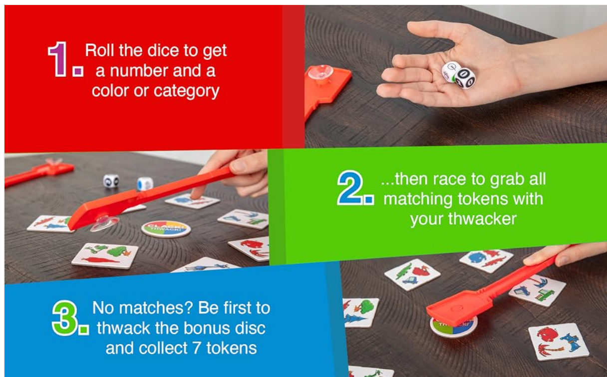
Image: Visual instructions demonstrating the game flow: rolling dice, thwacking a matching card, and thwacking the bonus disc.