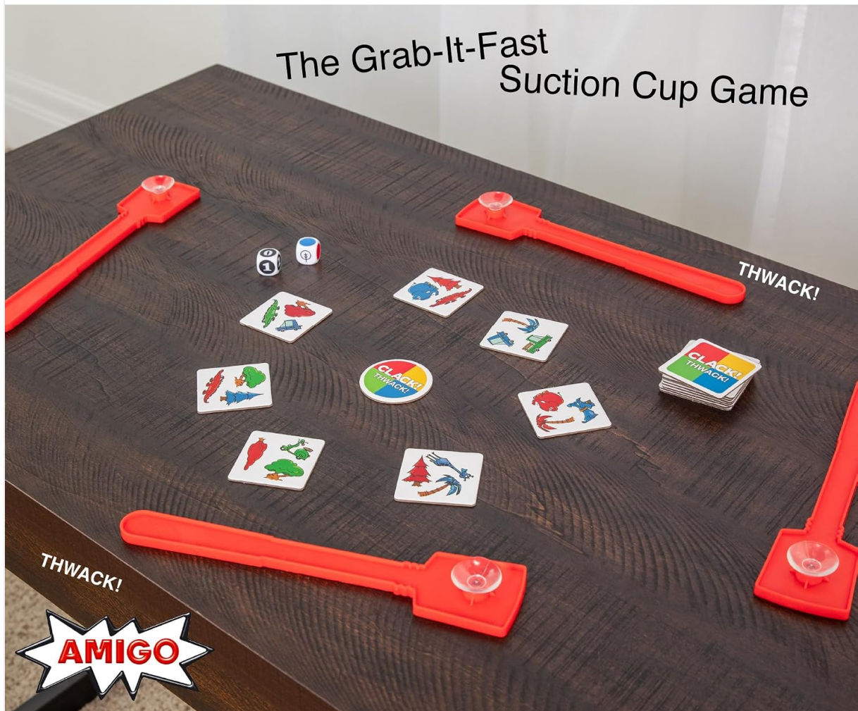
Image: All game components, including thwackers, dice, and game cards, arranged on a table.