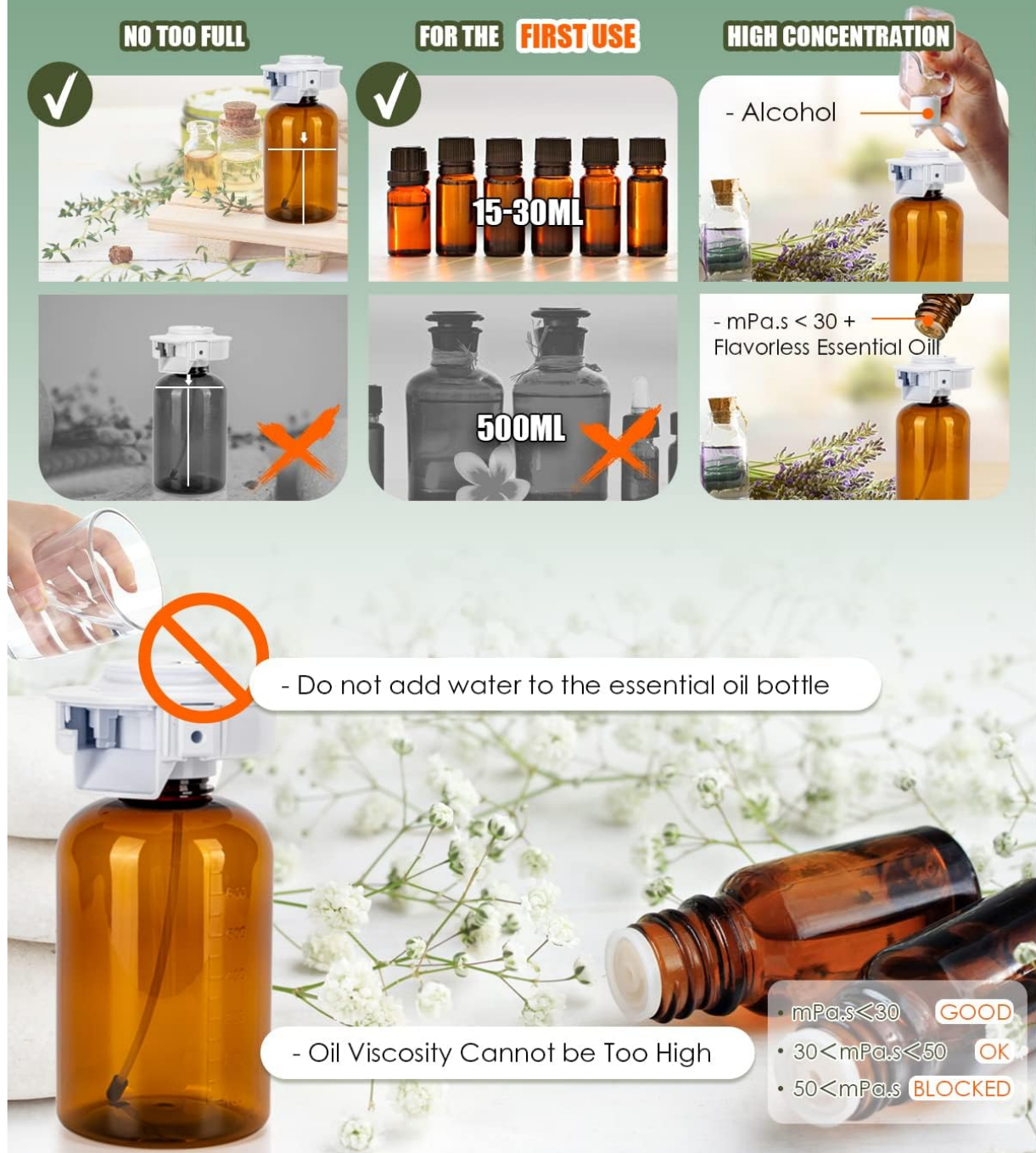
Figure 3: Guidelines for selecting and filling essential oils, emphasizing proper viscosity and avoiding overfilling or adding water.