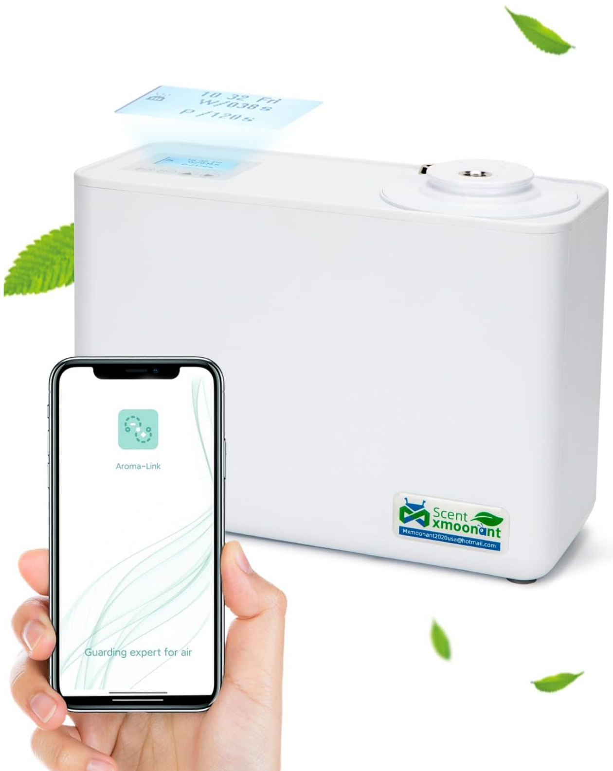
Figure 1: The Mxmoonant Scent Air Machine, a compact white device, shown with a smartphone displaying its companion Aroma-Link application, highlighting its smart control capabilities.