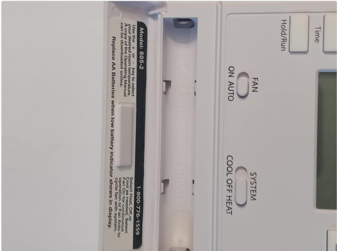
Front view of the VIVE COMFORT TP-P-605 Digital Thermostat, showing the LCD screen, program buttons, temperature adjustment buttons, and system/fan mode switches.

The VIVE COMFORT TP-P-605 is a single-stage, 5/1/1 programmable digital thermostat featuring a clear LCD display and intuitive controls.