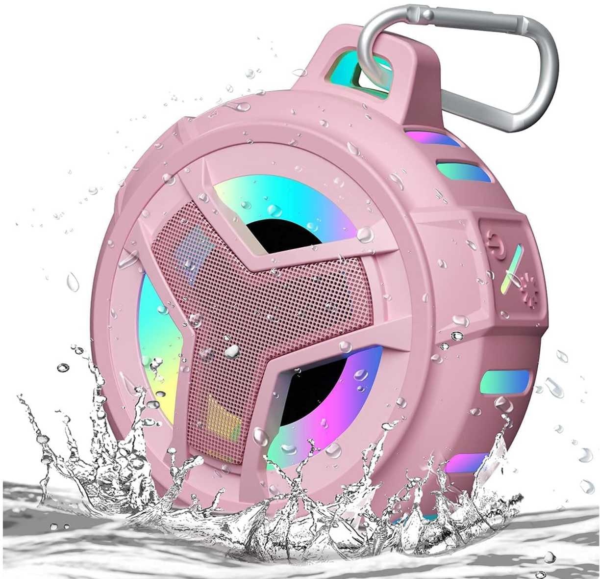
Image: A pink EBODA speaker demonstrating its waterproof capabilities, suitable for various environments.