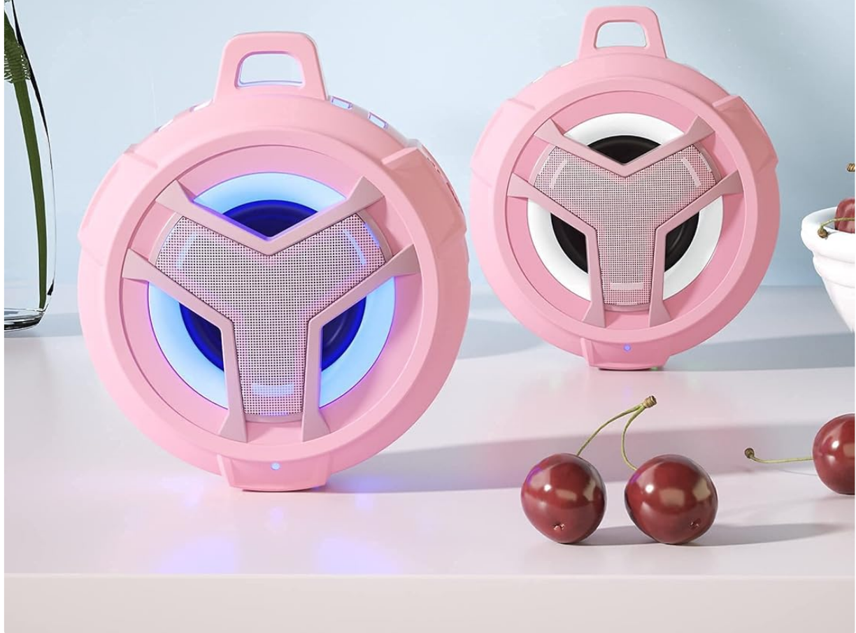
Image: Two EBODA speakers paired together, demonstrating the True Wireless Stereo functionality for enhanced audio.