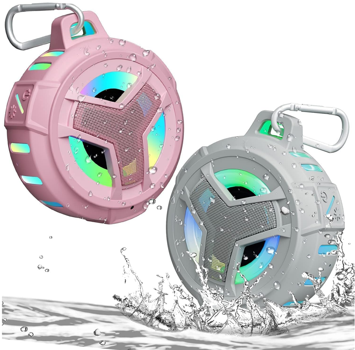
Image: Two EBODA waterproof Bluetooth speakers, one pink and one gray, demonstrating their water resistance with splashing water.