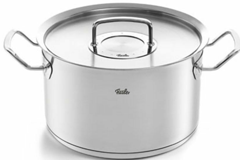
A polished stainless steel stock pot with two side handles and a matching metal lid.

The Fissler Original-Profi Collection stock pot is crafted from durable 18/10 stainless steel, designed for superior cooking performance. Key features include an extra-large pouring rim for drip-free transfer, a condensate-plus metal lid to retain moisture and flavor, interior measurement markings for precise cooking, and ergonomic side handles for comfortable handling. This cookware is oven safe up to 450°F (230°C) and suitable for all stovetops, including induction.