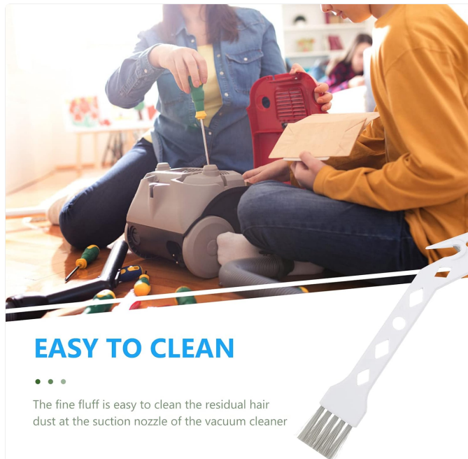
Image: Highlights the ease of cleaning the brush attachments, showing a clean brush.