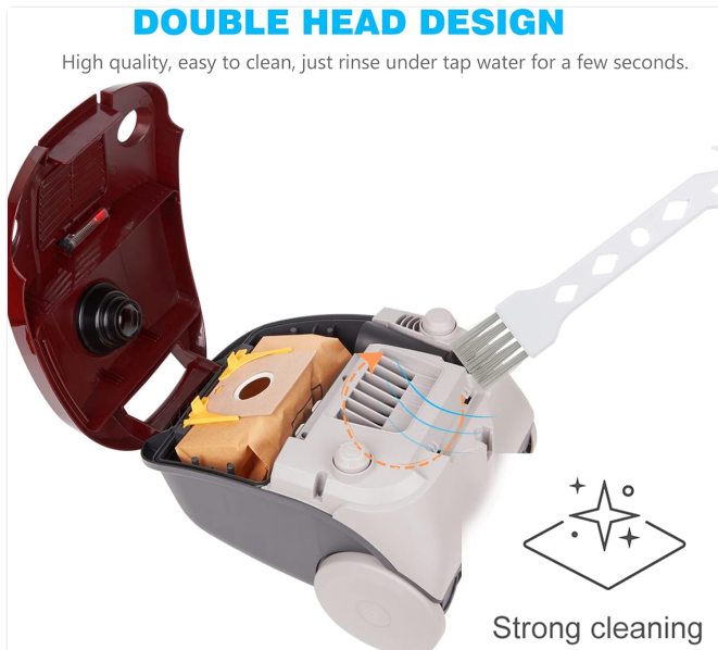
Image: Illustrates the double-head design and its application for cleaning various items, including vacuum cleaner components.

High quality, easy to clean, just rinse under tap water for a few seconds.