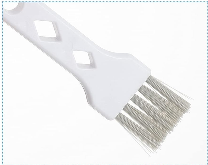
Image: Close-up view highlighting the high-quality materials and design of the brush attachment.

The small cleaning brush can also clean the dust and dirt on the sliding door, sliding window, shutter and other tracks;