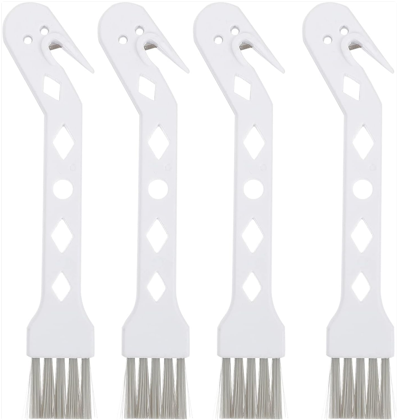
Image: The complete set of four SOLUSTRE vacuum cleaner brush attachments.