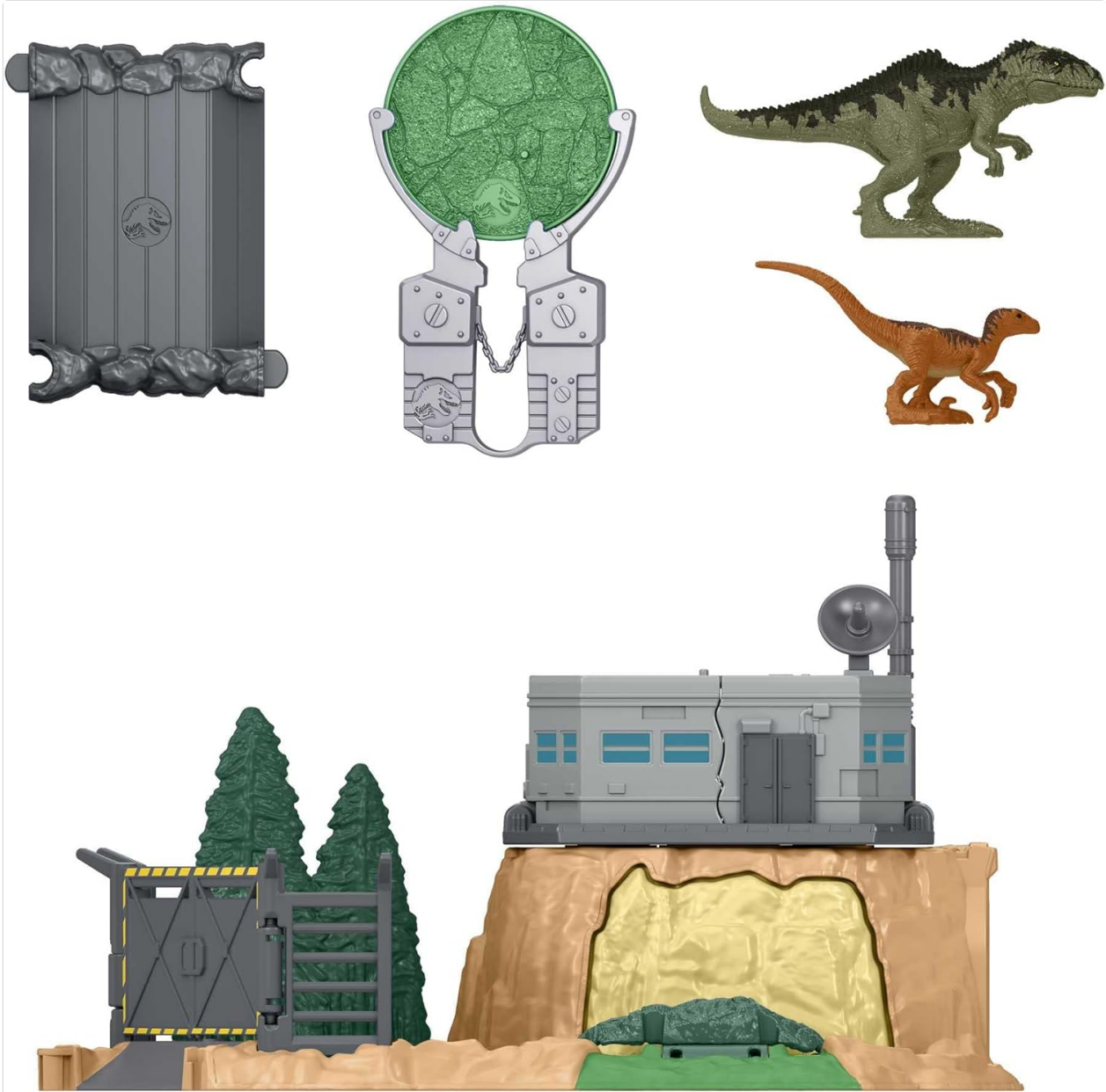
Image: All components included in the Giganotosaurus Rampage Playset.