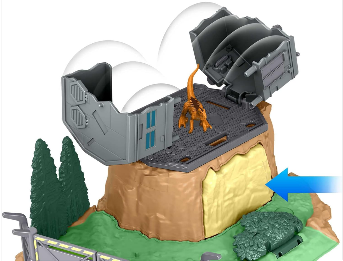
Image: The building breaking apart to reveal a hidden dinosaur.