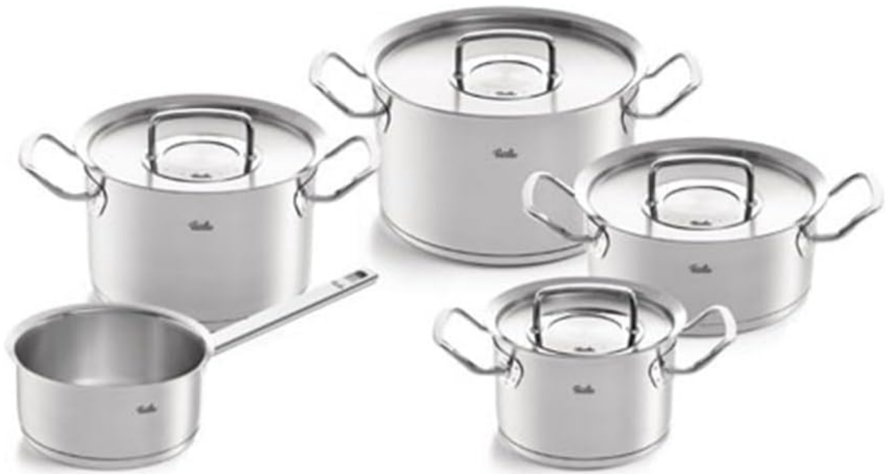
The Fissler Original-Profi Collection 9 Piece Set, showcasing the various pots and the saucepan with metal lids.