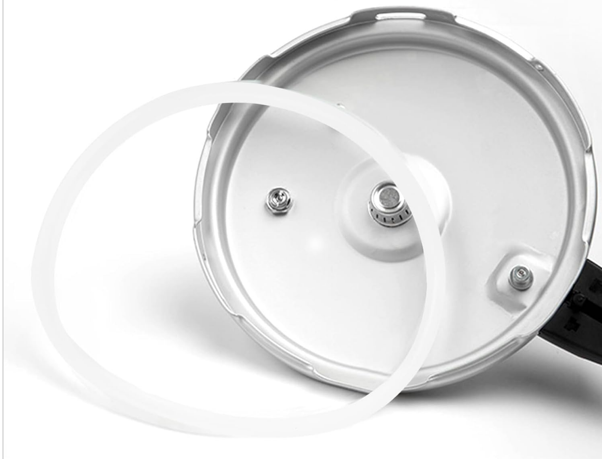
Image: A pressure cooker lid with the silicone sealing ring correctly positioned in its groove, ready for use.

Suitable for stainless steel pressure cooker, compatible model, various sizes of inner diameter available for you to choose.