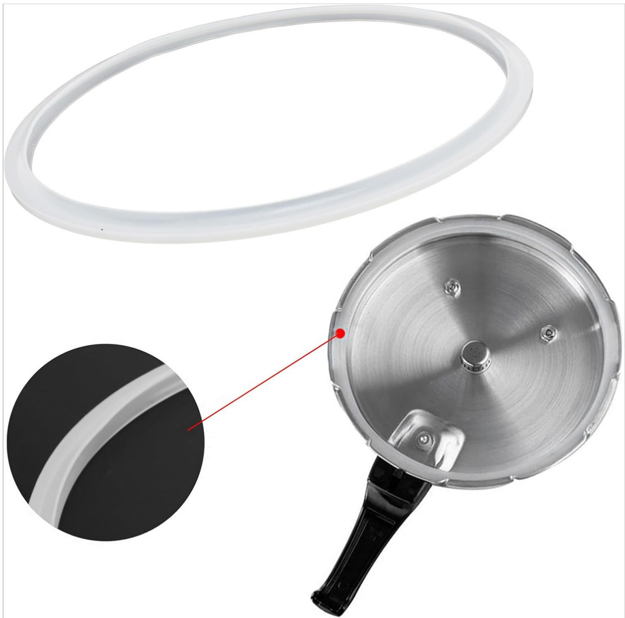
Image: The Fdit silicone sealing ring, highlighting its purpose as a pressure cooker gasket.