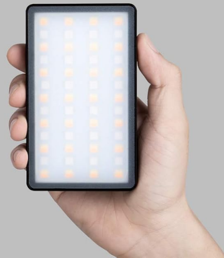
Figure 9: Key physical specifications and brightness.