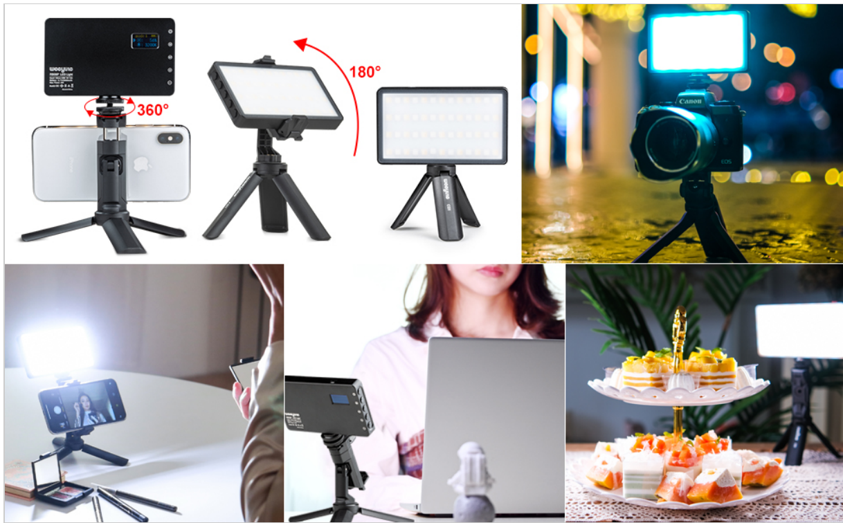
Figure 5: Examples of mounting the RB08P with a tripod and smartphone.