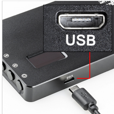
Figure 4: Micro USB charging port.