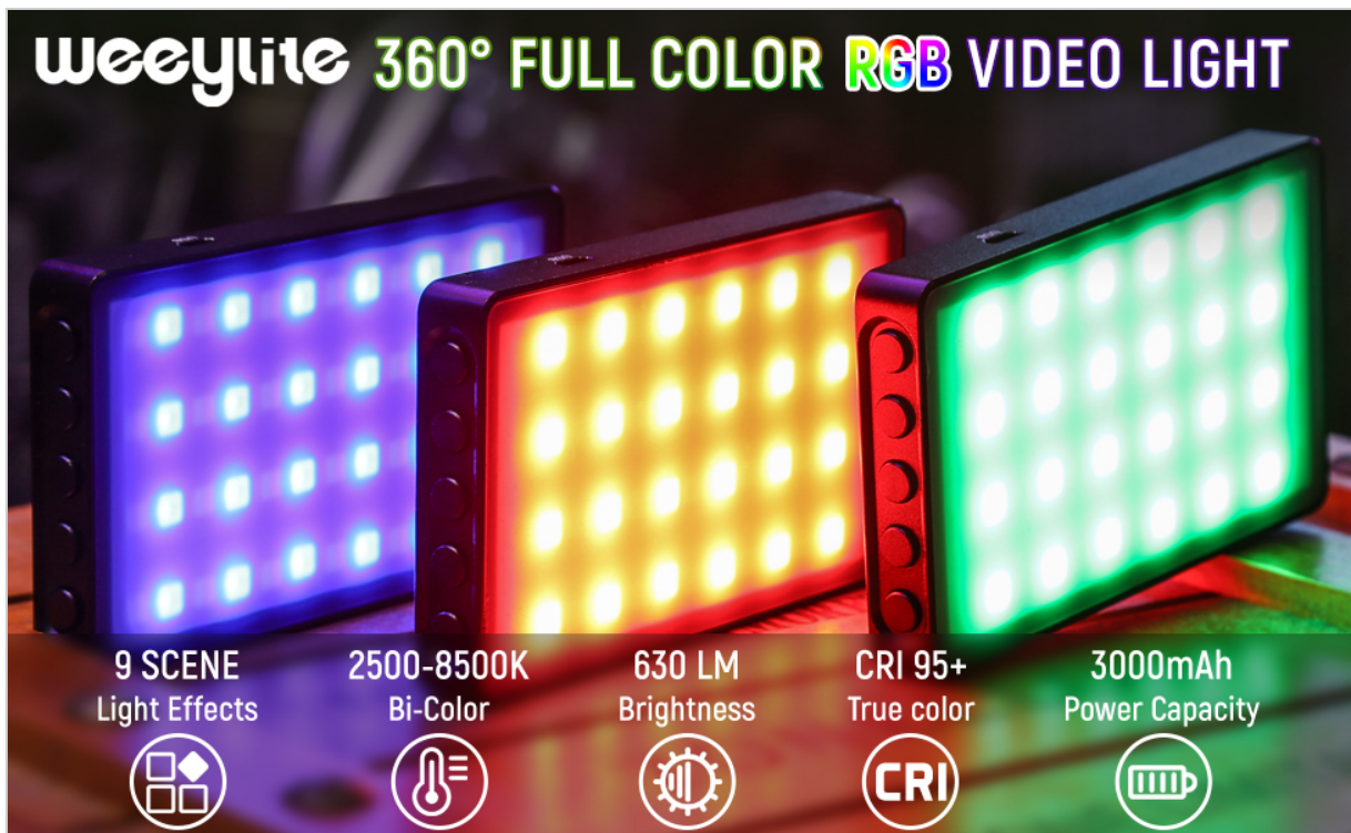
Figure 8: Overview of 9 Scene Light Effects.

Video 1: Demonstration of Weeylite RB08P Full Color RGB Video Light features and various modes.