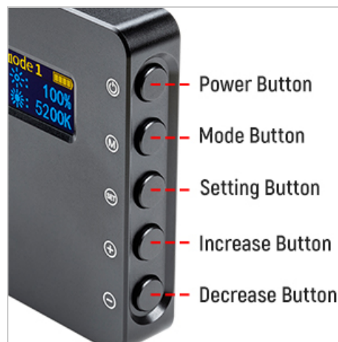
Figure 2: Detailed view of the control buttons.