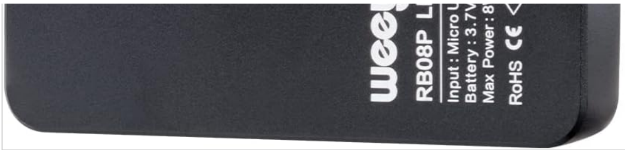
Figure 1: Back view of the WeeLite RB08P with labeled controls.