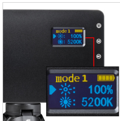
Figure 3: Close-up of the OLED display showing mode, brightness, and color temperature.