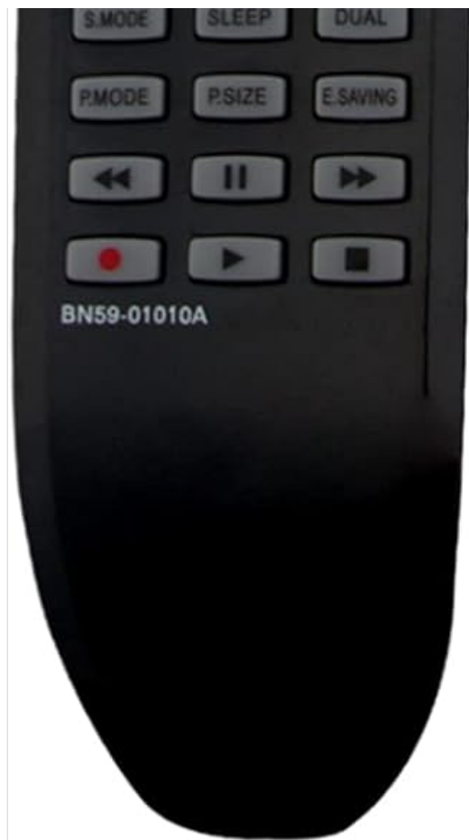
Image 3.1: Front view of the remote control, displaying the layout of all functional buttons.