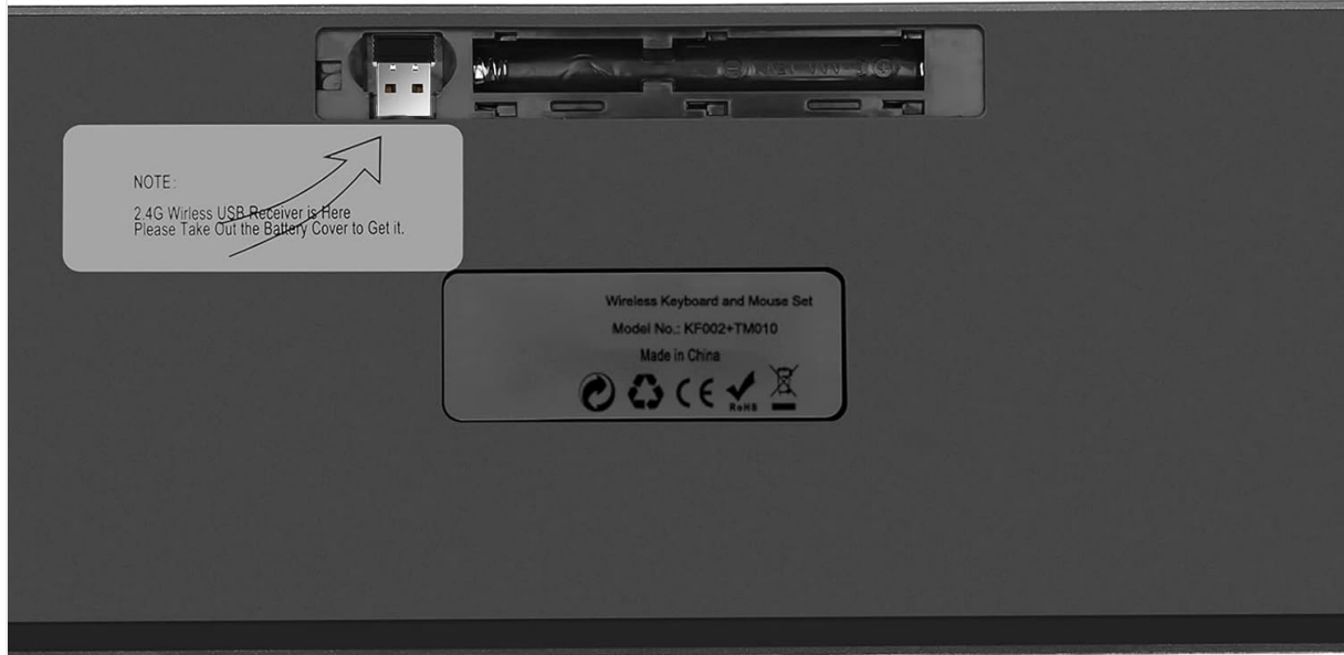
Image 3.1: The underside of the keyboard showing the battery compartment and the storage slot for the USB receiver.