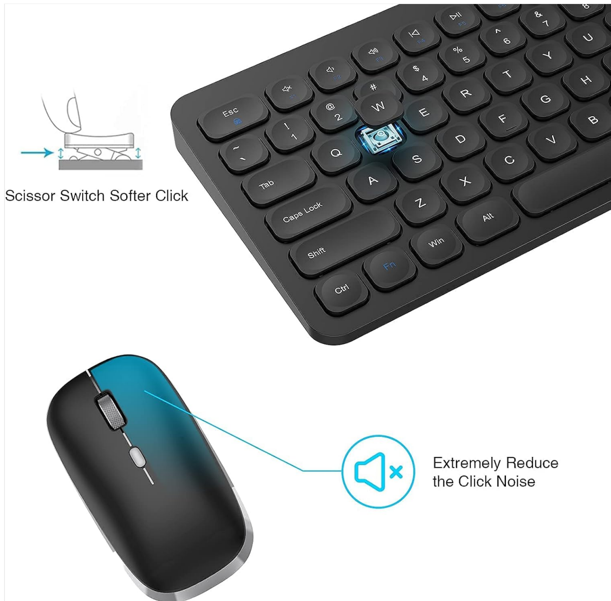
Image 4.2: Close-up view highlighting the scissor-switch mechanism of the keyboard keys and the silent click feature of the mouse.