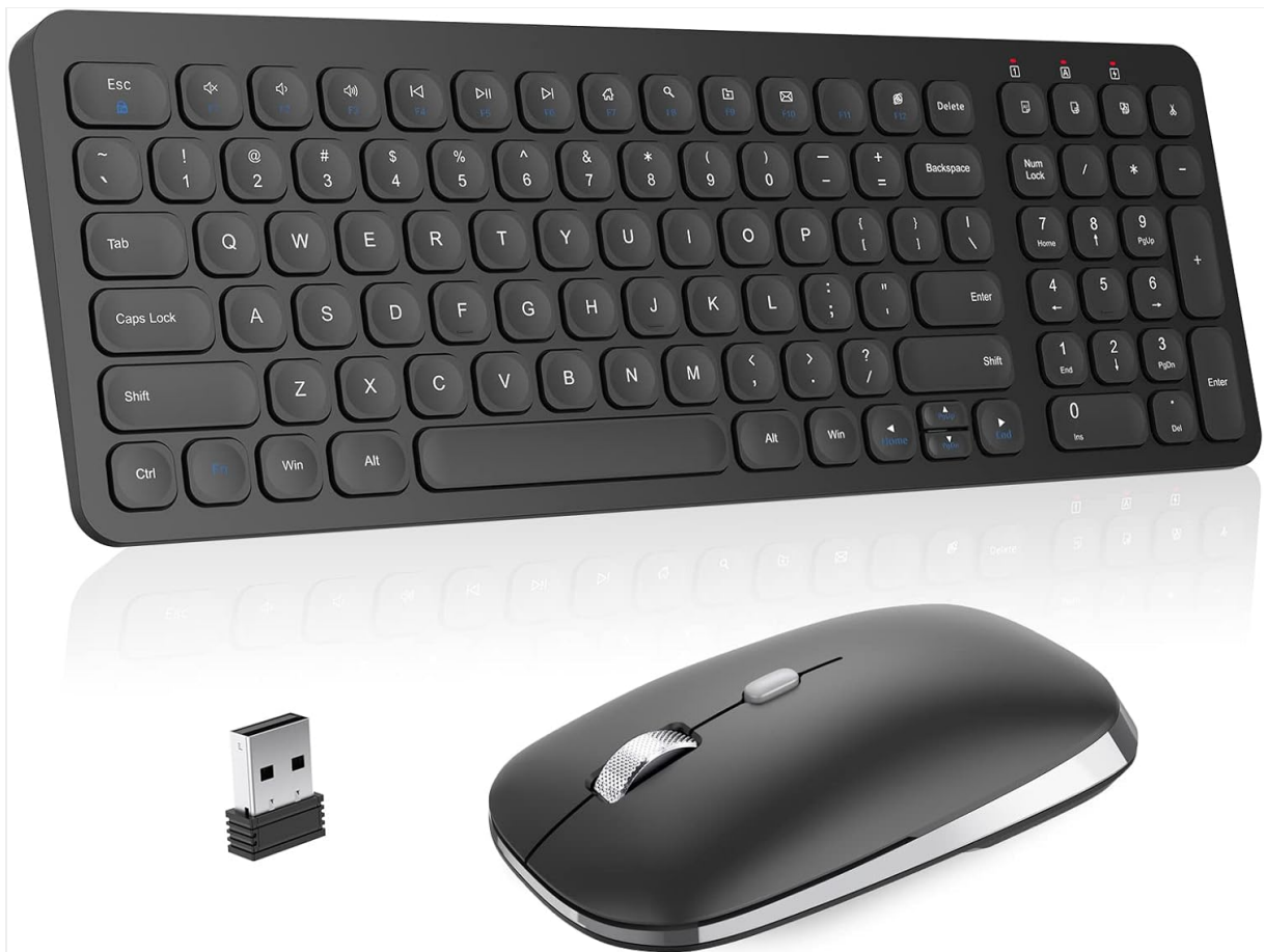
Image 1.1: The PINKCAT Wireless Keyboard and Mouse Combo, featuring the full-size keyboard, ergonomic mouse, and the compact USB receiver.