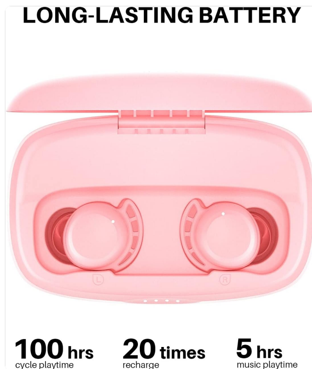
Figure 3: Long-lasting Battery. This image shows the earbuds inside the charging case, emphasizing the 100 hours of cycle playtime, 20 times recharge capability, and 5 hours of music playtime per charge.

The Tribit FlyBuds 3 offer up to 5 hours of music playback per charge, and the charging case provides an additional 100 hours of playtime, allowing for multiple recharges on the go.