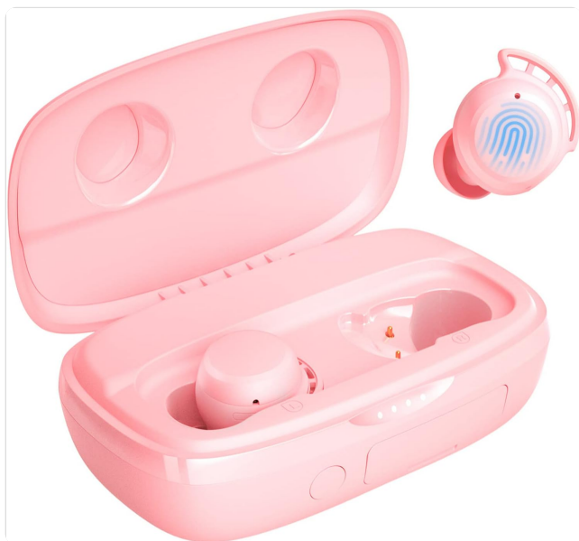
Figure 1: Tribit FlyBuds 3 Earbuds and Charging Case. This image shows the pink charging case open with one earbud inside and the other earbud outside, displaying its design.