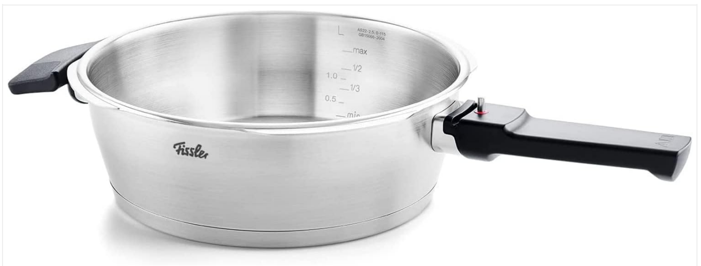
Figure 2.2: Internal view of the pressure cooker pot, showing measurement markings for liquid levels.