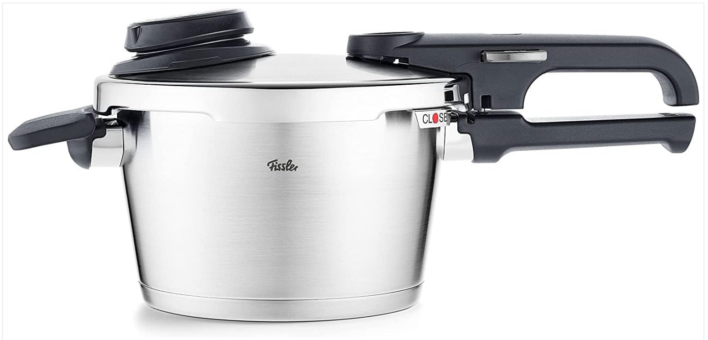
Figure 2.1: Fissler Vitavit Premium Pressure Cooker, showing the main pot, lid, and handles.