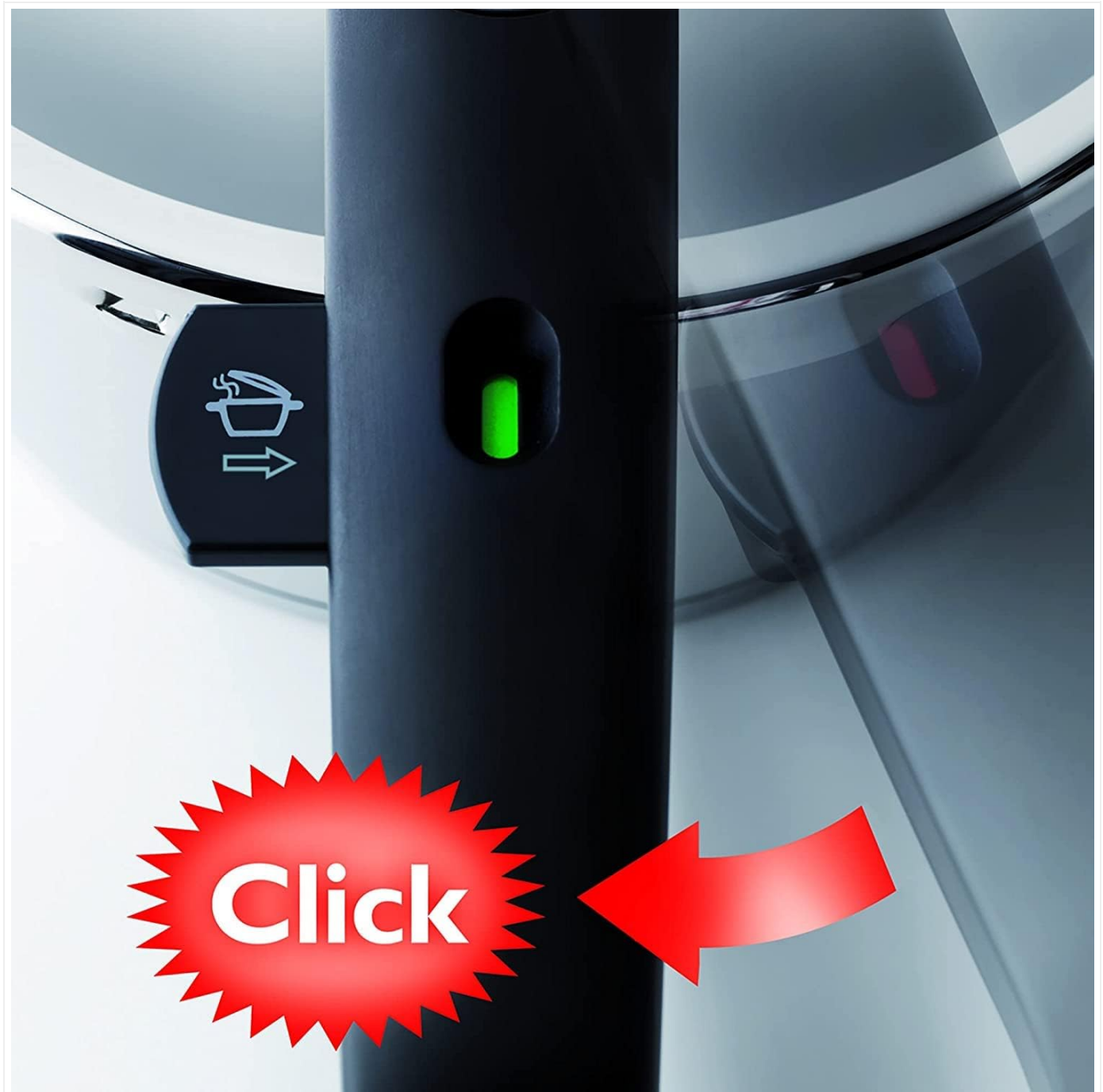
Figure 3.1: The locking indicator on the handle, which turns green and clicks when the lid is securely closed.