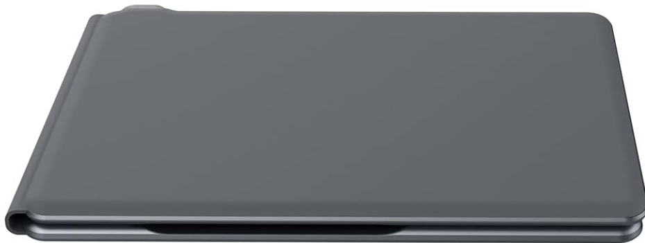
Image: The MoKo Foldable Keyboard in its open (powered on) and closed (powered off) states, illustrating the magnetism switch.

Your browser does not support the video tag.