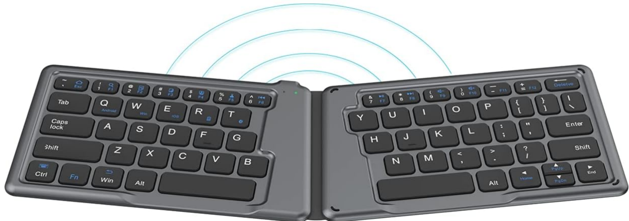
Image: Visual representation of battery life and charging time for the MoKo Foldable Keyboard.

Your browser does not support the video tag.