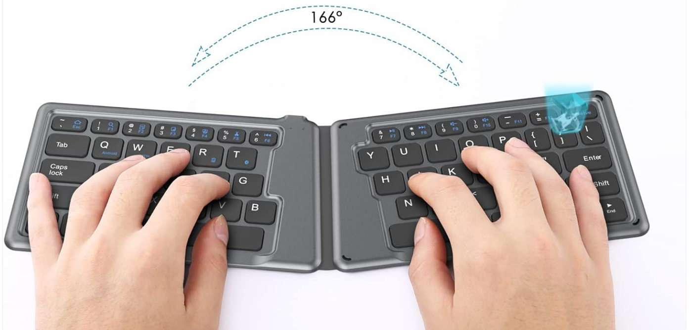
Image: Depiction of the 166-degree ergonomic design and scissor-switch mechanism for comfortable typing.

Innovative 166 °: for comfortable typing