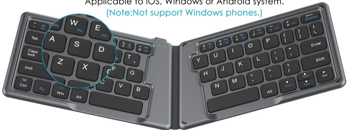
Image: Illustration of the keyboard's wide compatibility with Windows, iOS, and Android operating systems.

Applicable to iOS, Windows or Android system. (Note: Not support Windows phones.)