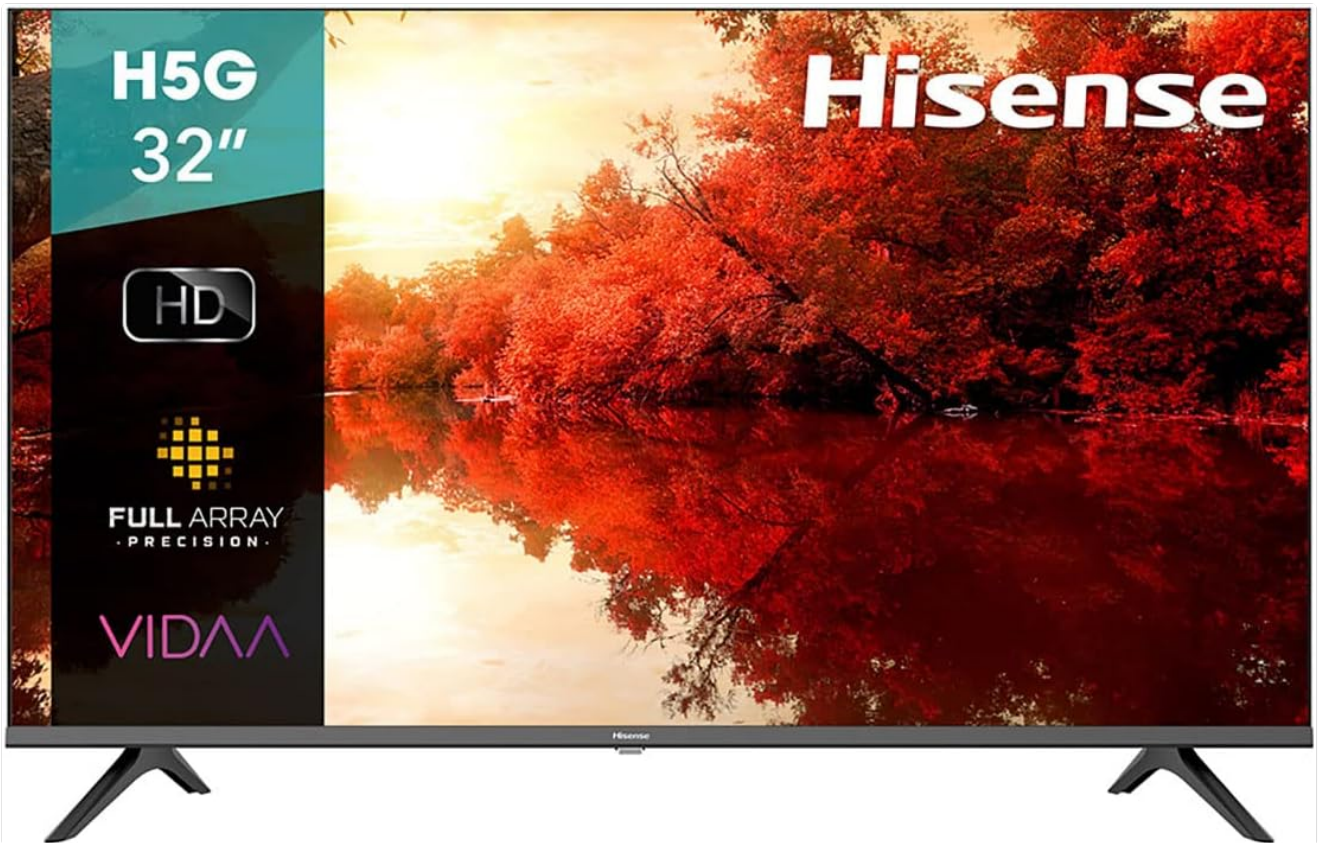
Figure 2.1: Front view of the Hisense 32H5G Smart TV, showcasing its sleek, bezel-less design and the display with vibrant colors.