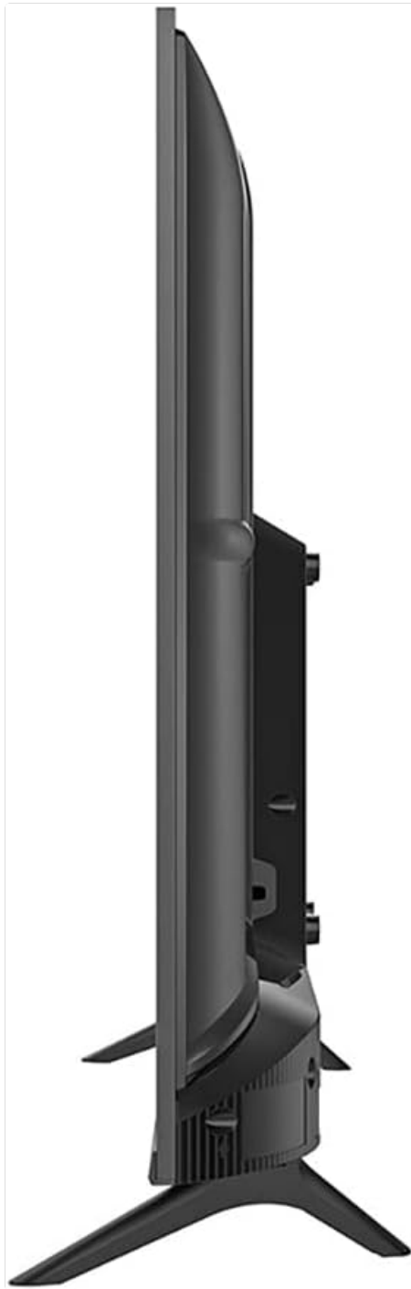
Figure 2.2: Side profile of the Hisense 32H5G Smart TV, highlighting its slim form factor.