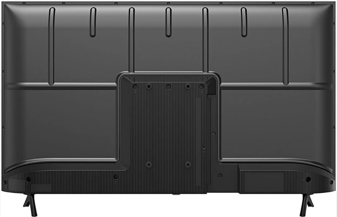
Figure 2.3: Rear view of the Hisense 32H5G Smart TV, showing the mounting points and connection panel area.