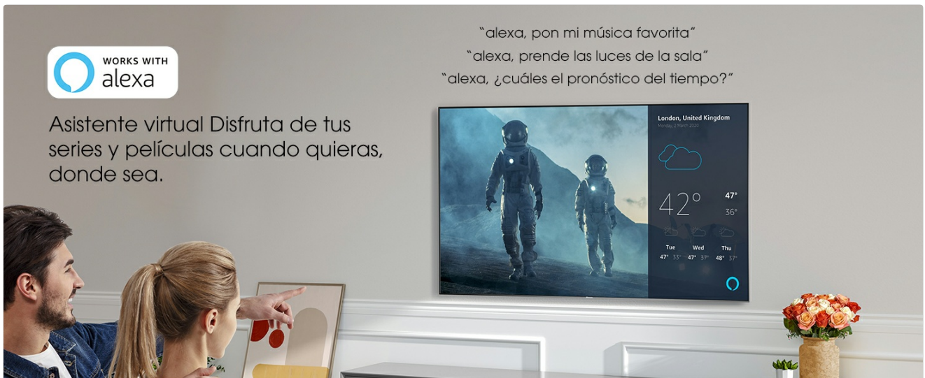
Figure 4.3: Illustration of the TV's compatibility with Alexa, allowing for voice commands to control functions like turning on the TV or playing music.

Your Hisense TV can be controlled using voice commands via a compatible Alexa device.