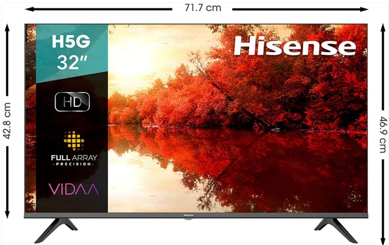
Figure 2.4: Diagram illustrating the physical dimensions of the Hisense 32H5G Smart TV, including width and height measurements.