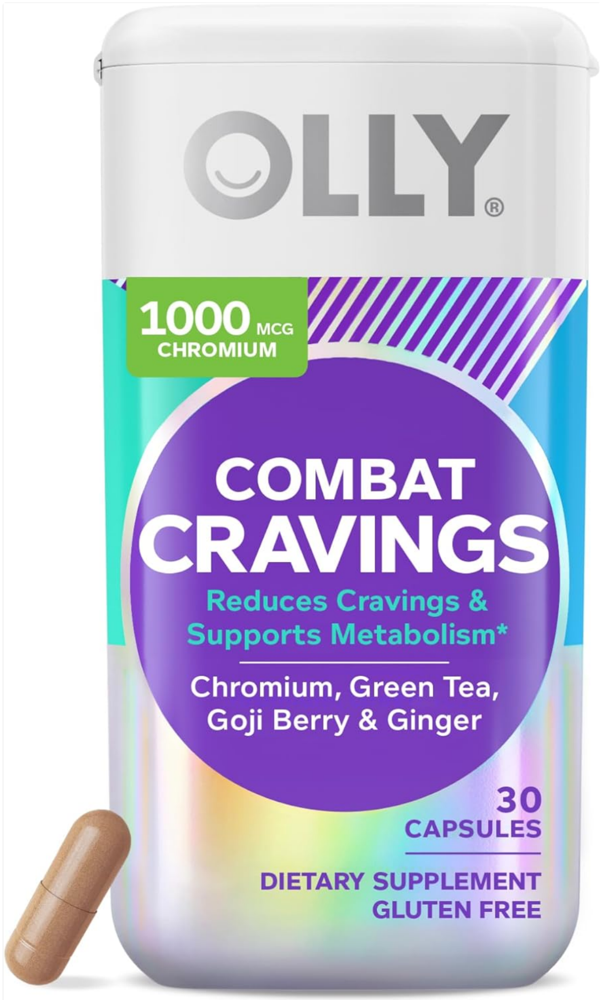
Image 1.1: Front view of the OLLY Combat Cravings supplement bottle, showing the label with "1000 mcg Chromium" and