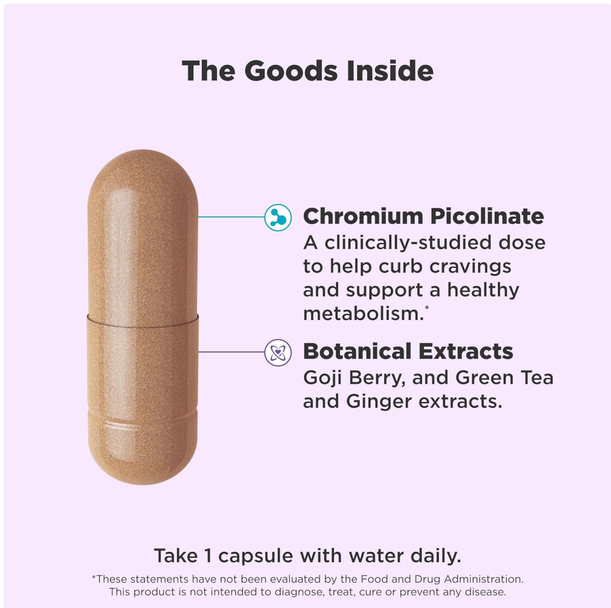
Image 3.2: Visual representation of a capsule highlighting Chromium Picolinate and Botanical Extracts (Goji Berry, Green Tea, Ginger) as key ingredients.