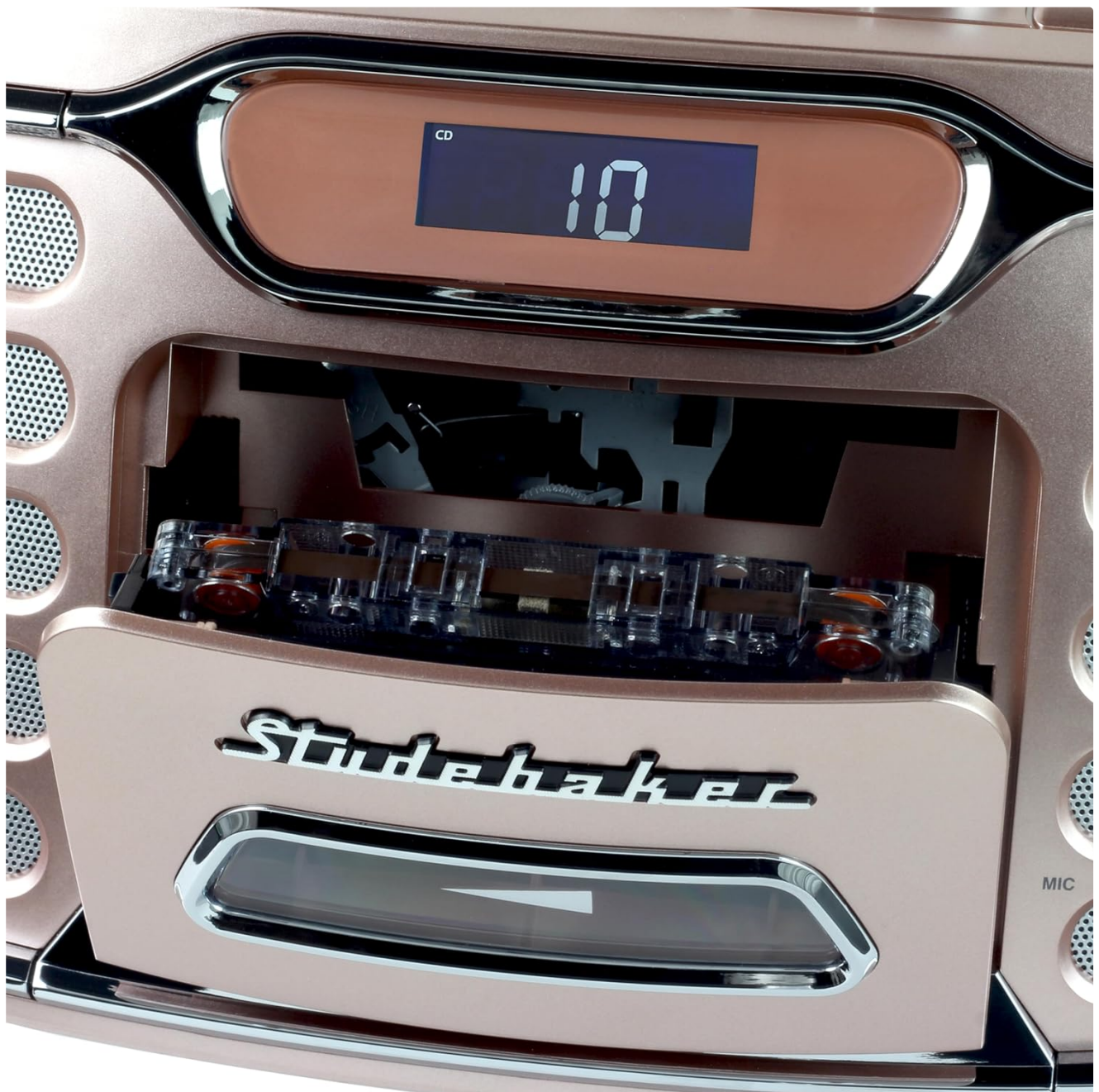
Figure 3: The cassette player compartment shown open, ready for tape insertion. Note the clear cover and tape mechanism.