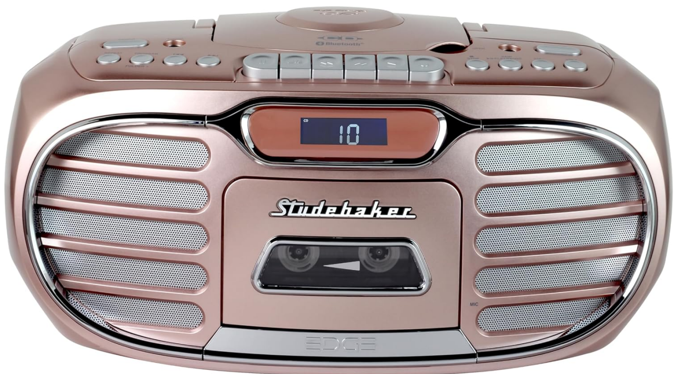
Figure 2: Detailed front view of the boombox, highlighting the dual speakers, cassette player compartment, and the central LCD display.