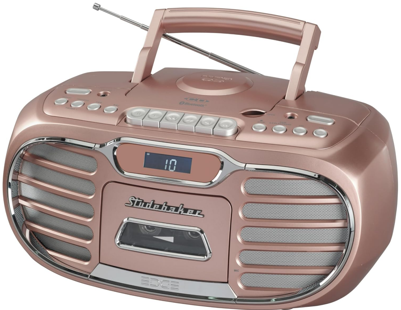
Figure 1: Front and top view of the Studebaker Retro Edge Boombox in Rose Gold, showing the telescopic antenna extended and control panel.