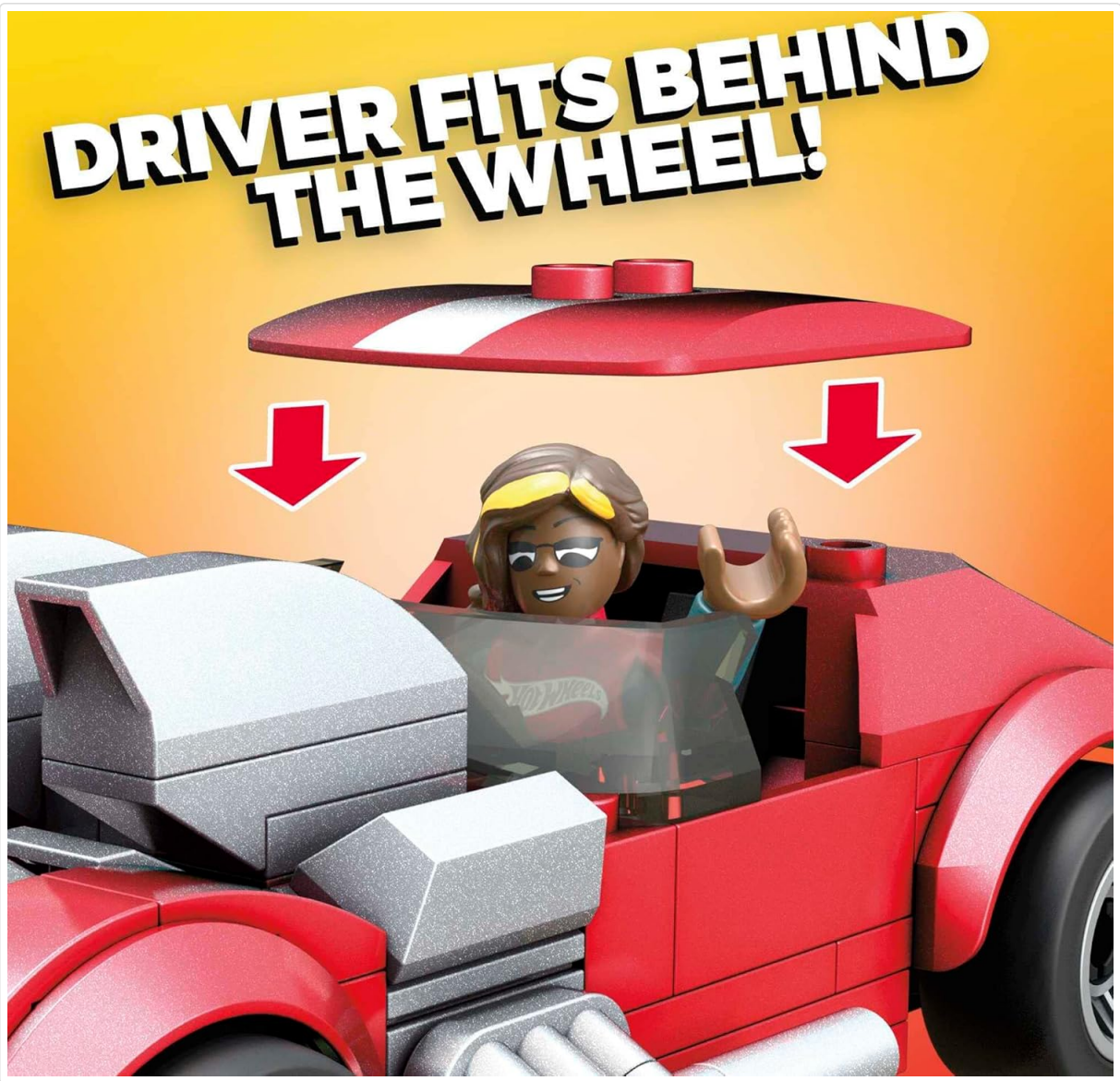
Image: The micro action figure is shown being lowered into the driver's seat of the Twin Mill racecar, with arrows indicating the placement.