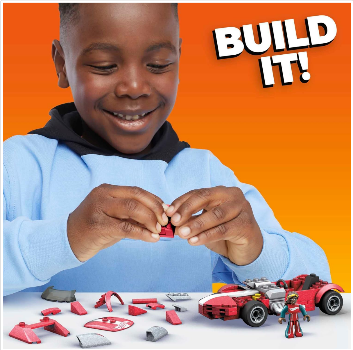
Image: A child's hands are shown carefully connecting building blocks to construct the Twin Mill racecar.