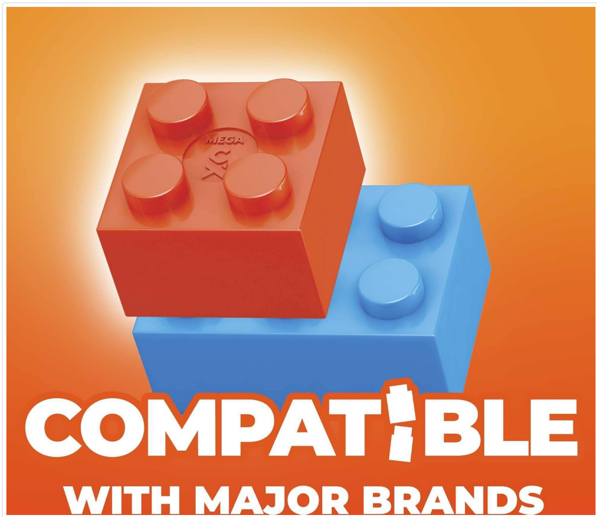
Image: An orange and a blue building block are shown, illustrating the compatibility of the pieces with other major building block brands.