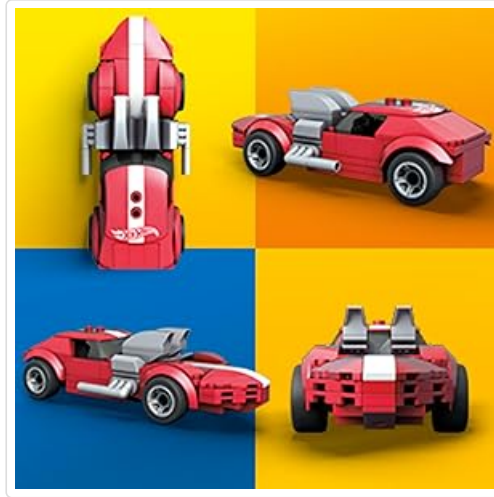
Image: A composite image showing top, side, three-quarter, and rear views of the assembled Twin Mill racecar.

Image: The assembled Twin Mill racecar with an arrow indicating its length, specified as 5.34 inches (13.58 cm).