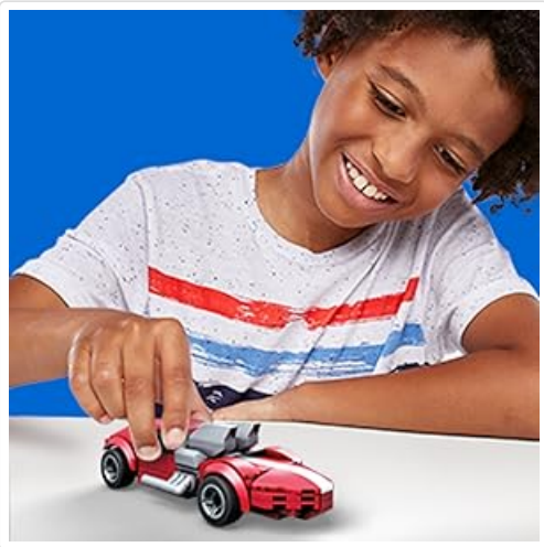
Image: A child is shown smiling and pushing the assembled Twin Mill racecar across a surface, demonstrating play.