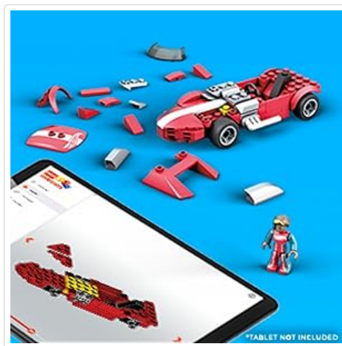
Image: Various building pieces for the Twin Mill racecar are laid out, with a tablet in the foreground showing digital assembly instructions.

The building pieces are designed to be compatible with other MEGA Construx building sets and major building block brands, allowing for expanded creative possibilities and custom model creation.