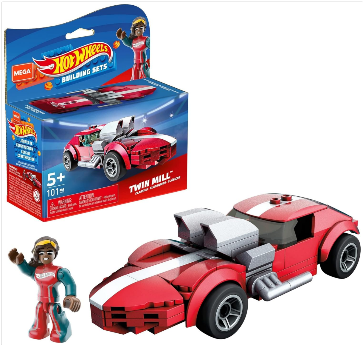
Image: The Mega Hot Wheels Twin Mill building set packaging, showing the assembled red racecar and the included micro action figure.