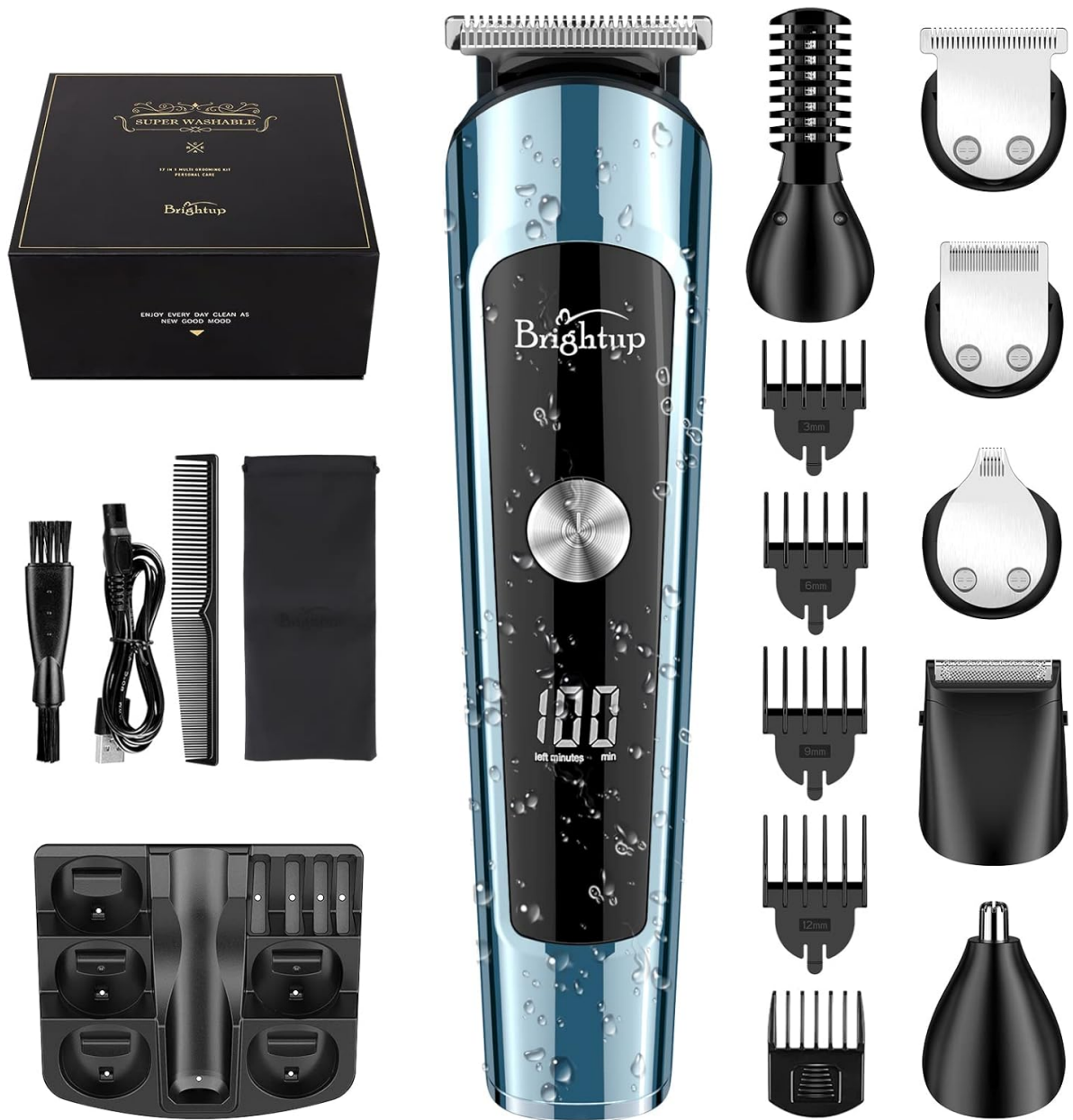
Image: The trimmer being cleaned under running water, highlighting its waterproof feature.