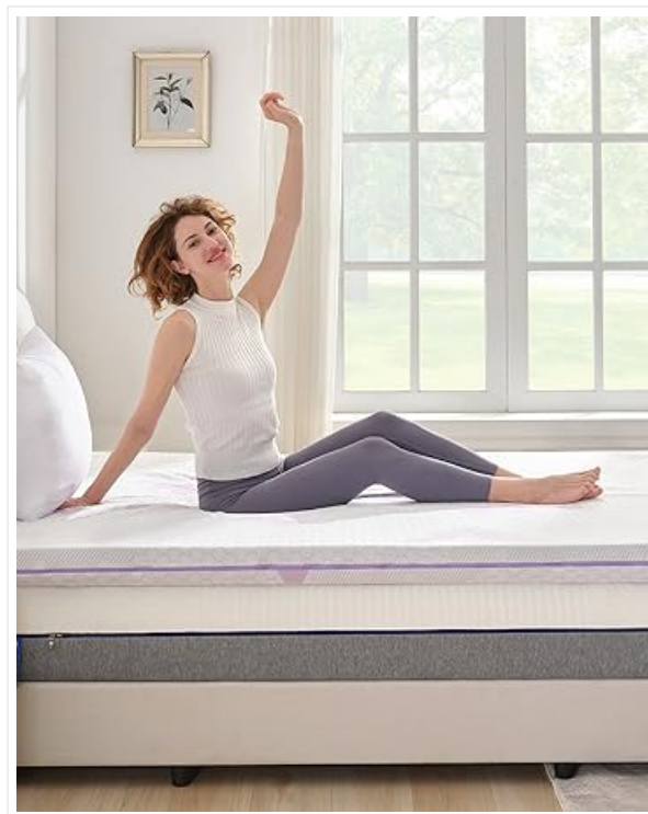
Experience optimal spinal alignment and comfort with the 5-zone design.

Once fully expanded, simply place the SINWEEK mattress topper directly on top of your existing mattress. The 5-zone design will naturally align with your body's contours, providing targeted support and pressure relief for a restful night's sleep.