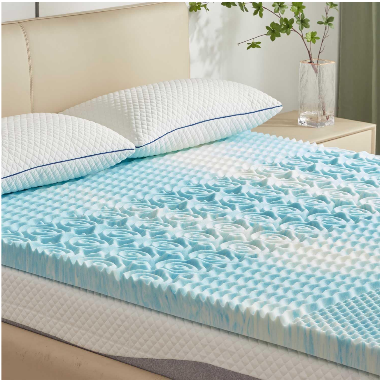
The SINWEEK 2 Inch Memory Foam Mattress Topper, designed for enhanced sleep comfort.