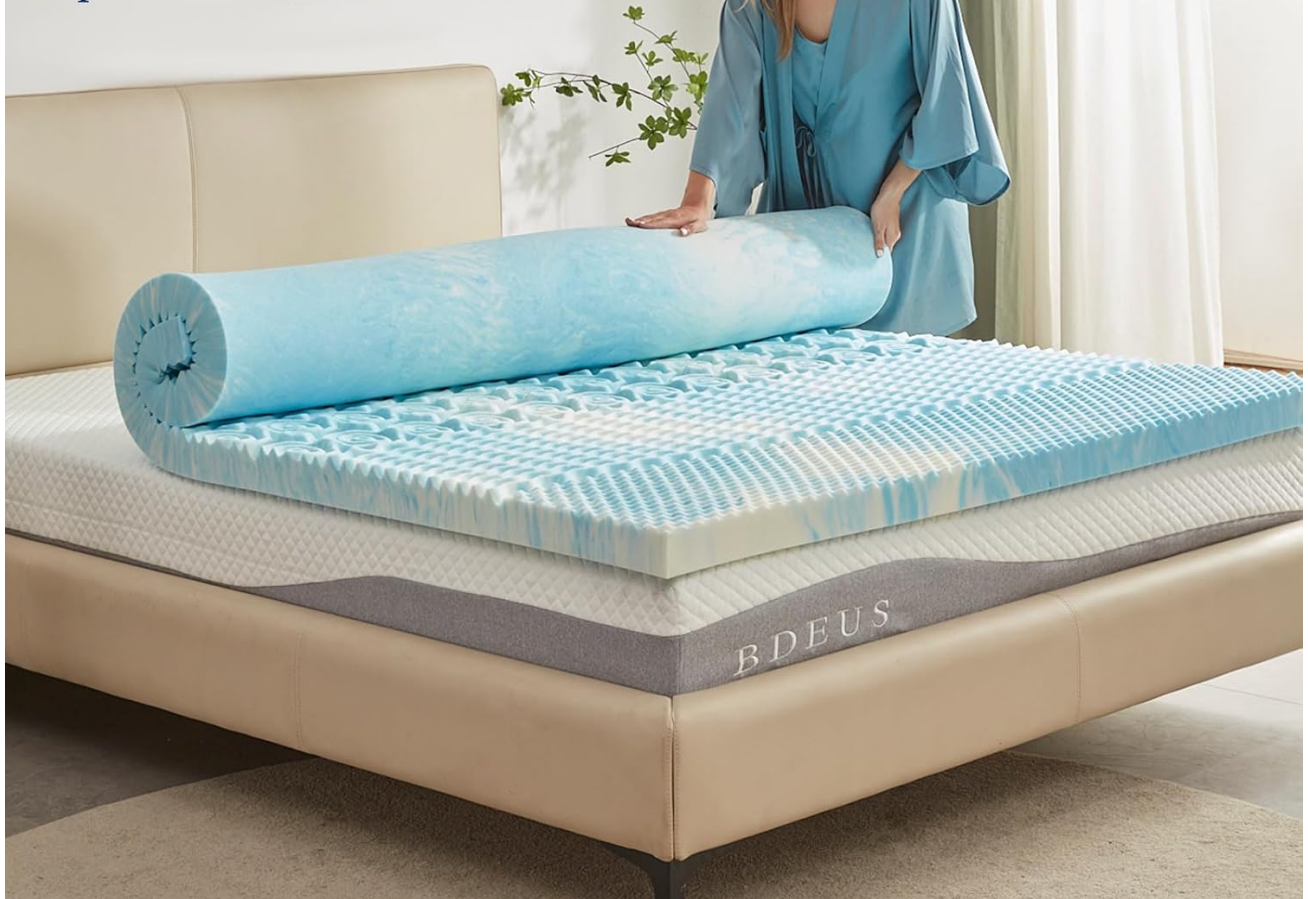
Visual guide for unpacking and unrolling the mattress topper.