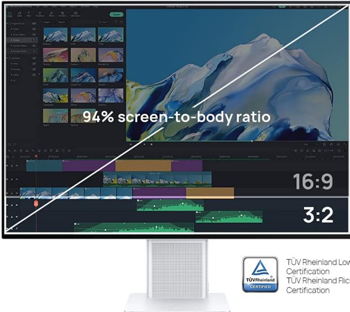
Figure 8.4: Illustration of the 3:2 aspect ratio compared to traditional 16:9, highlighting more vertical screen space.