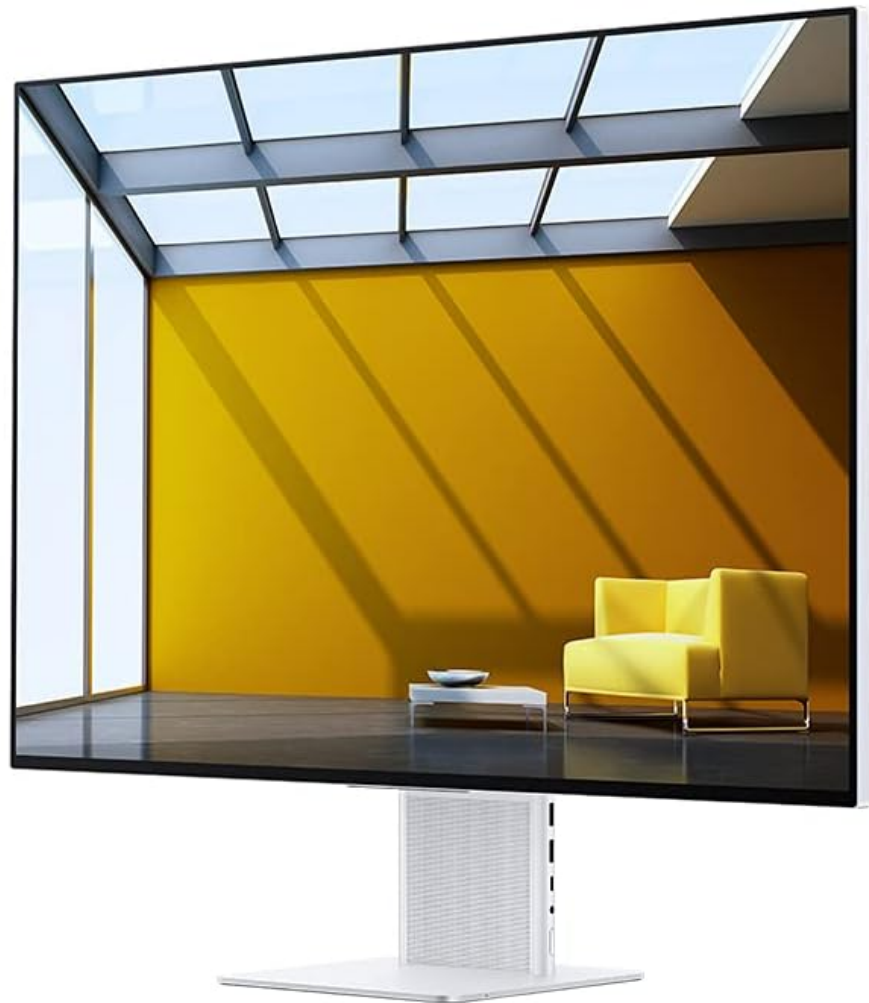
Figure 8.2: Details on the monitor's color reproduction capabilities, including 1.07 billion colors and 98% DCI-P3.