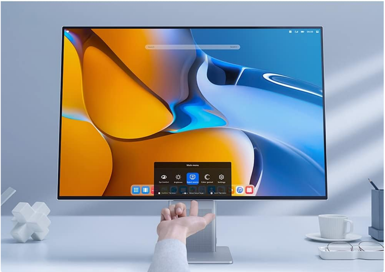
Figure 5.1: The Smart Bar interface on the HUAWEI MateView Monitor, showing touch controls for settings.

Intuitive touch controls for easy interactions