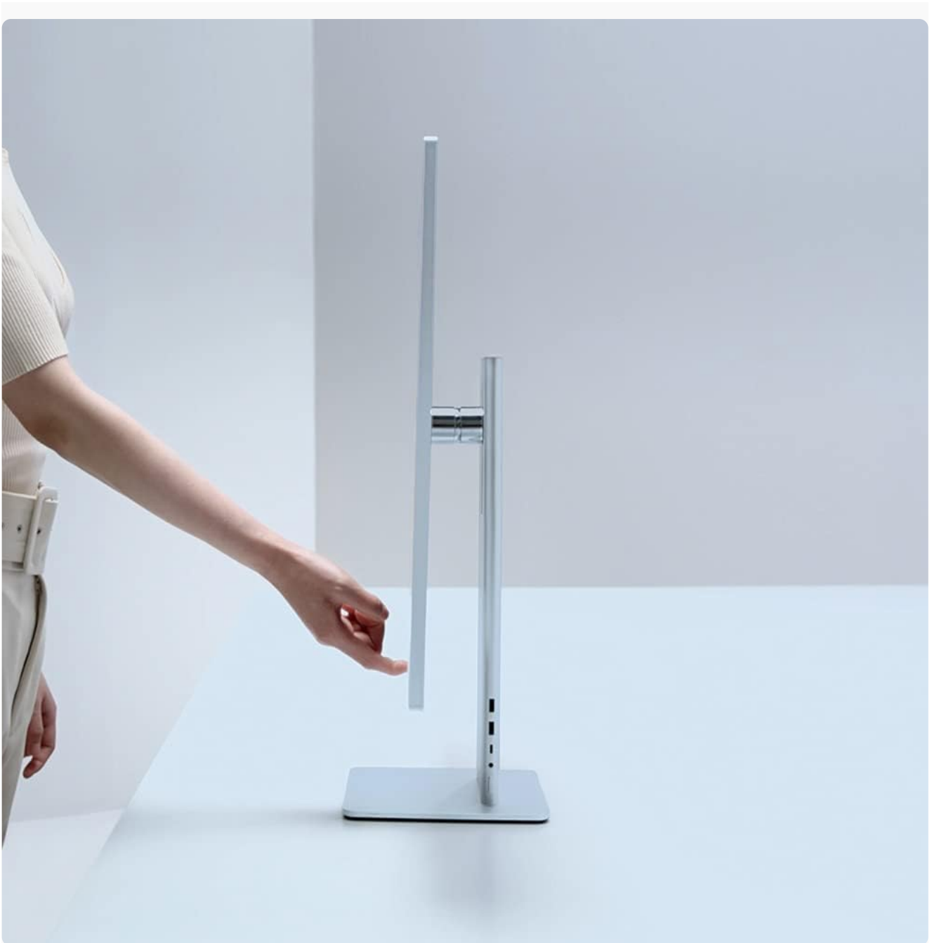
Figure 4.2: A hand demonstrating the height adjustment feature of the HUAWEI MateView Monitor.