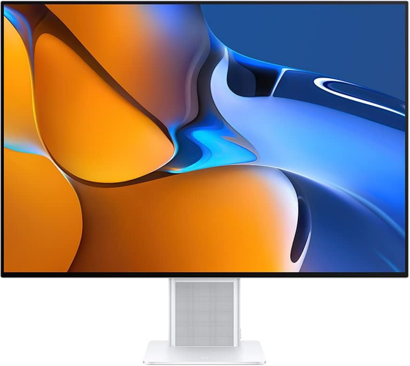
Figure 1.1: Front view of the HUAWEI MateView Monitor.