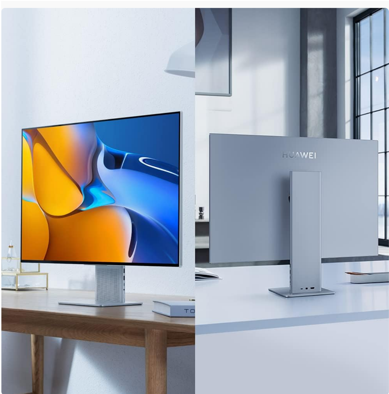
Figure 4.1: Side view of the monitor stand showing the various input and output ports.