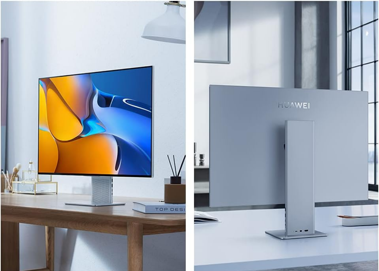
Figure 1.2: The elegant and minimalist design of the HUAWEI MateView Monitor, shown from front and back.