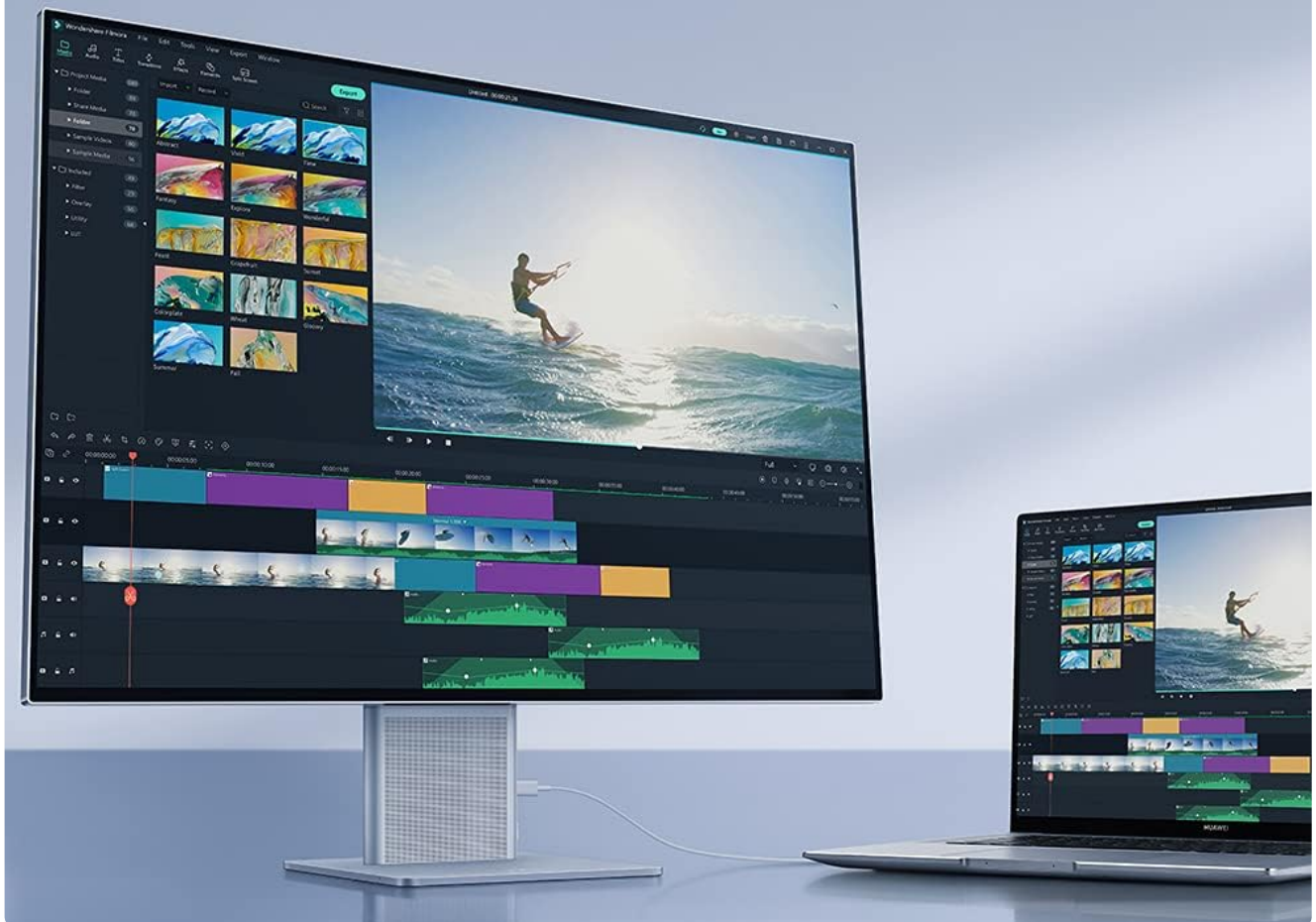
Figure 5.2: The monitor displaying content wirelessly projected from a laptop, showcasing enhanced efficiency.