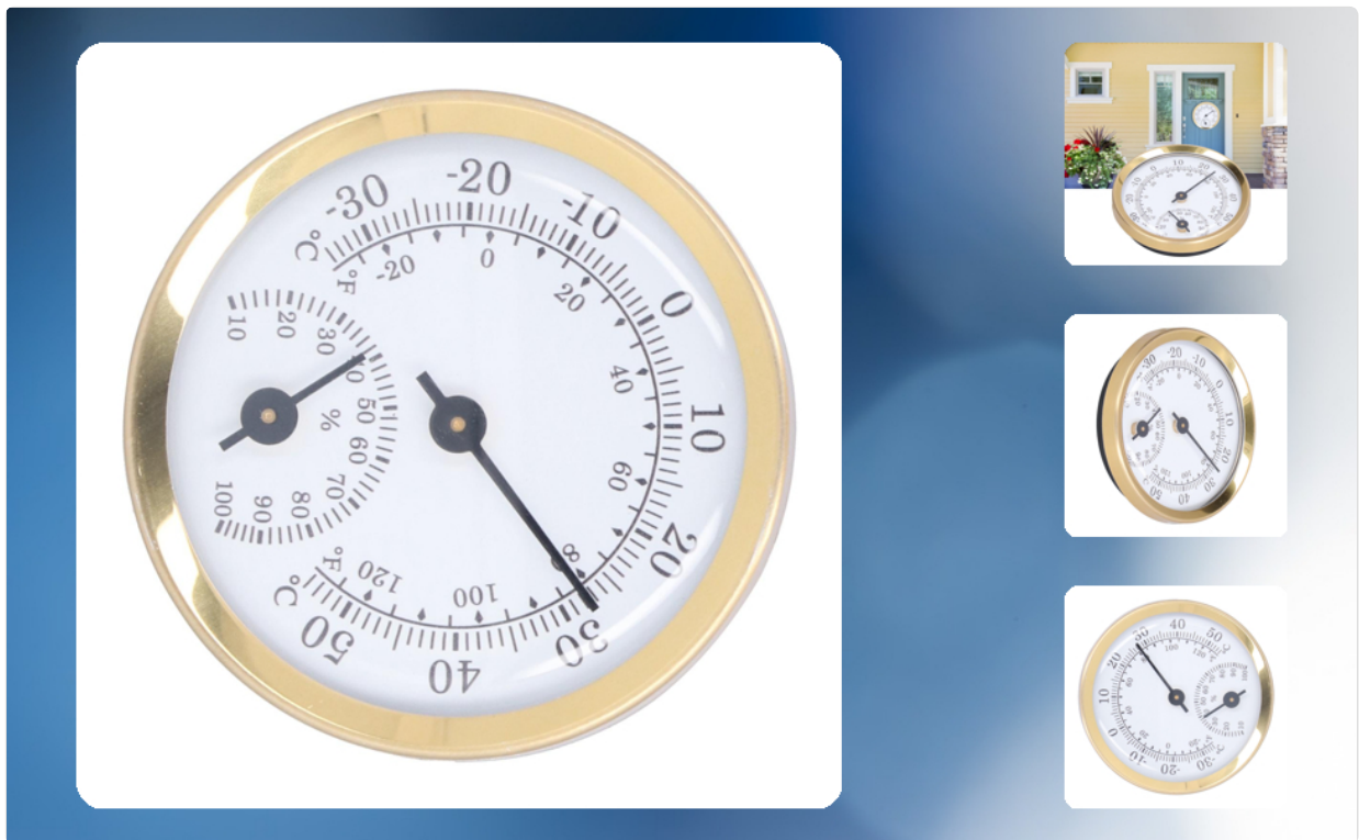
Image: Examples of wall-mounted and desktop placement options for the thermohygrometer.

For accurate readings, place the thermohygrometer away from direct sunlight, heat sources, air conditioning vents, or areas with strong drafts.