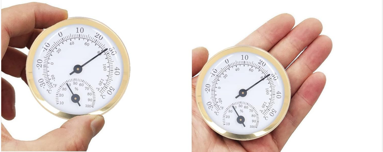
Image: Close-up of the dial face, illustrating how to read temperature and humidity.

Mini size, the wall hole design makes this thermometer hygrometer fit the wall, and it can also be placed directly on the table is also excellent.