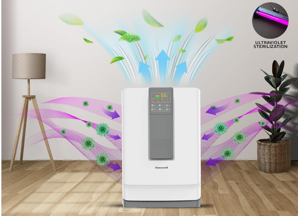
Image: An illustration demonstrating the UV LED and Ionizer functions of the Honeywell Air Purifier, showing how it helps to kill harmful bacteria and purify the air.