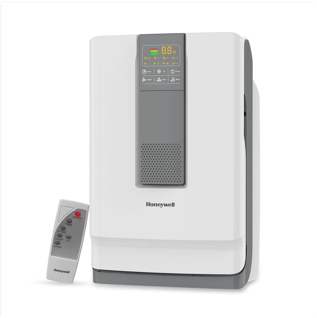
Image: The Honeywell Air Purifier Air touch V4, a white rectangular unit with a control panel, shown alongside its remote control.