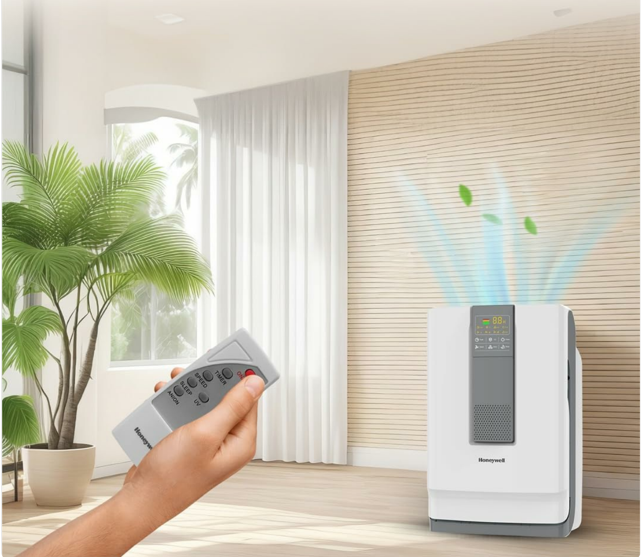
Image: A hand holding the remote control for the Honeywell Air Purifier, showing its various buttons for power, timer, speed, sleep, UV, and ionizer functions.