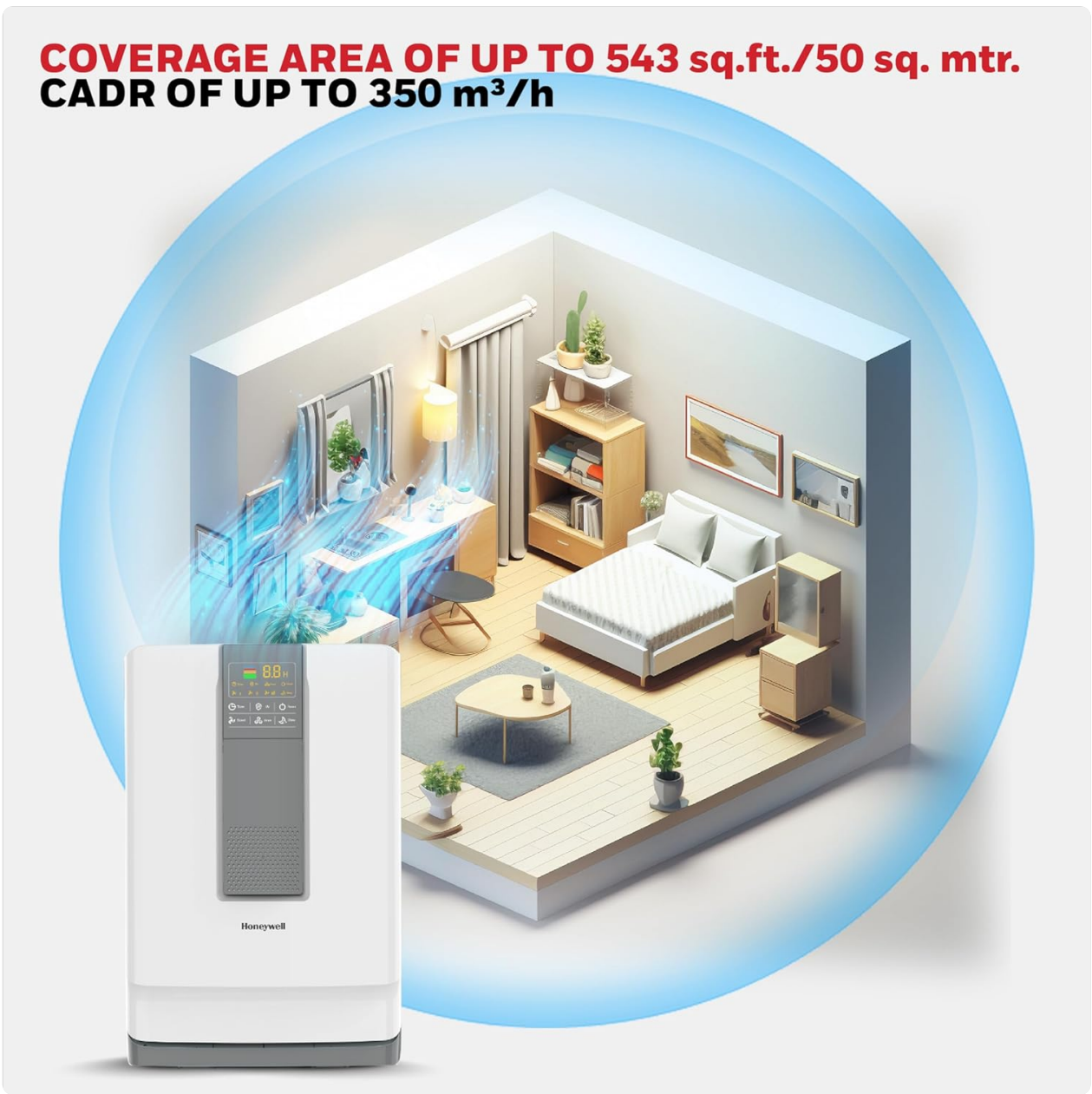
Image: An illustration showing the Honeywell Air Purifier placed in a living space, demonstrating its coverage area of up to 543 sq.ft. and 3D airflow.

COVERAGE AREA OF UP TO 543 sq.ft./50 sq. mtr. CADR OF UP TO 350 m 3 /h