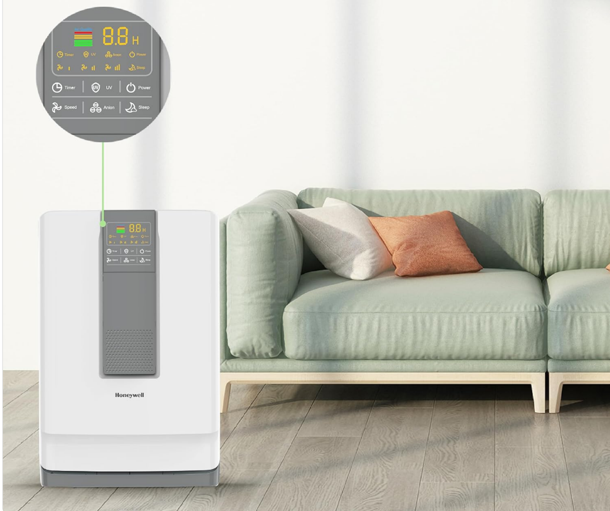
Image: The Honeywell Air Purifier with an arrow pointing to the control panel, highlighting the filter reset indicator light.