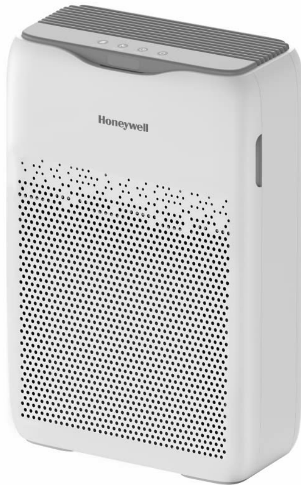
Honeywell Air Touch V2 Air Purifier, front view.