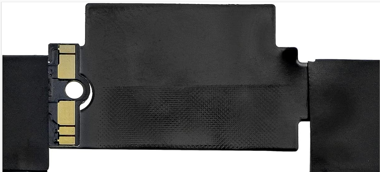
Image 3: Close-up view of the battery's flex cable and connector, highlighting the contact points for connection to the device's logic board.