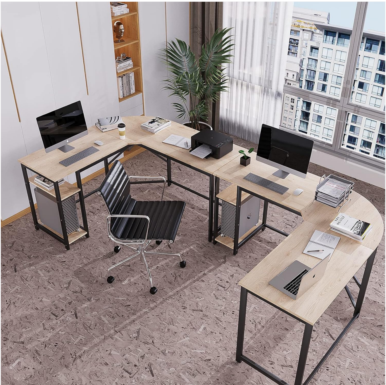
Figure 4: An example of the desk supporting a multi-monitor computer setup, demonstrating ample space.