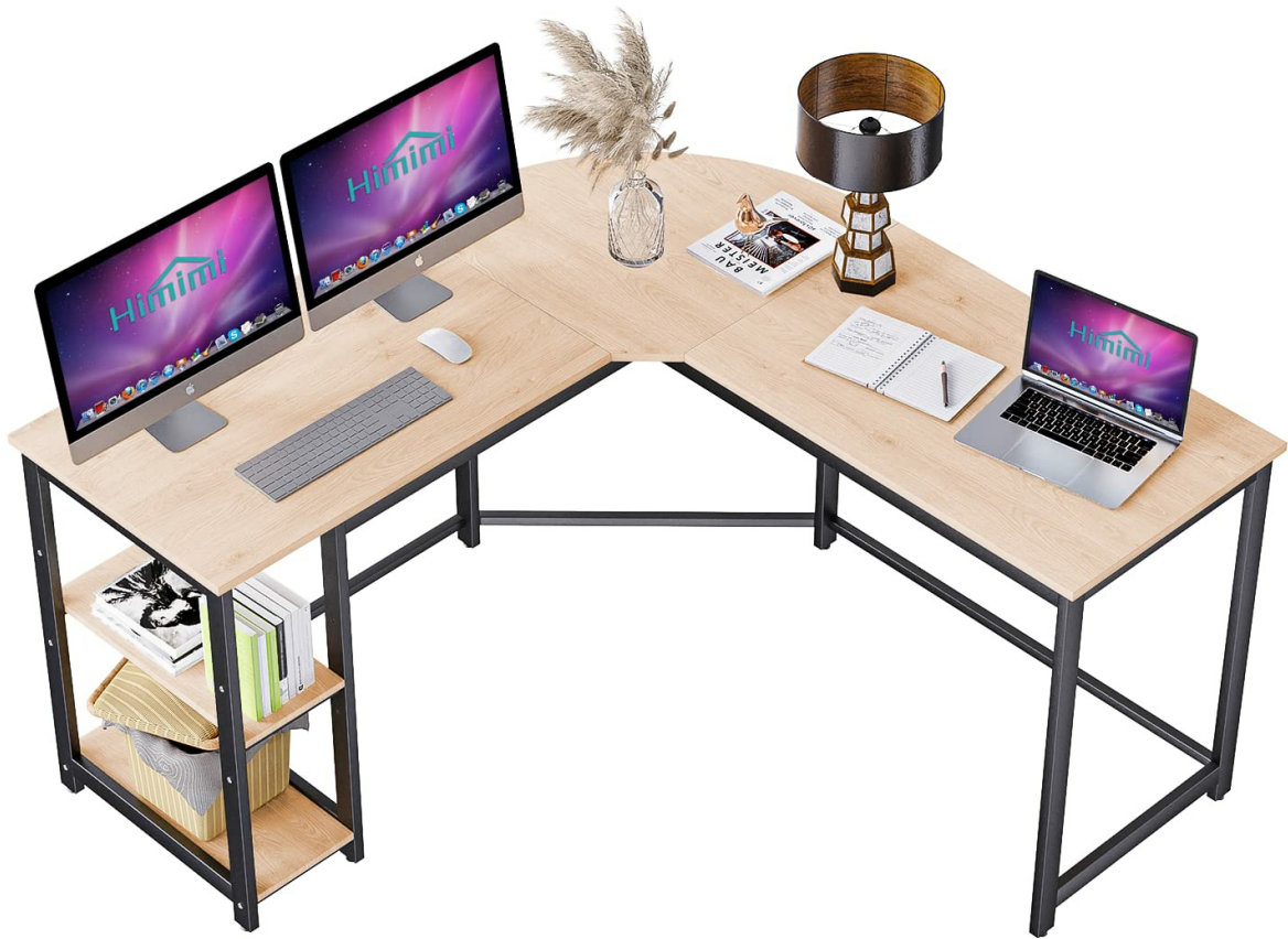
Figure 3: The Himimi L-Shaped Desk in a typical home office setup, showcasing its spacious design.

The integrated storage shelves offer convenient access to your essentials. These shelves can be adjusted or removed to suit your specific storage needs, whether for books, office supplies, or a computer tower.