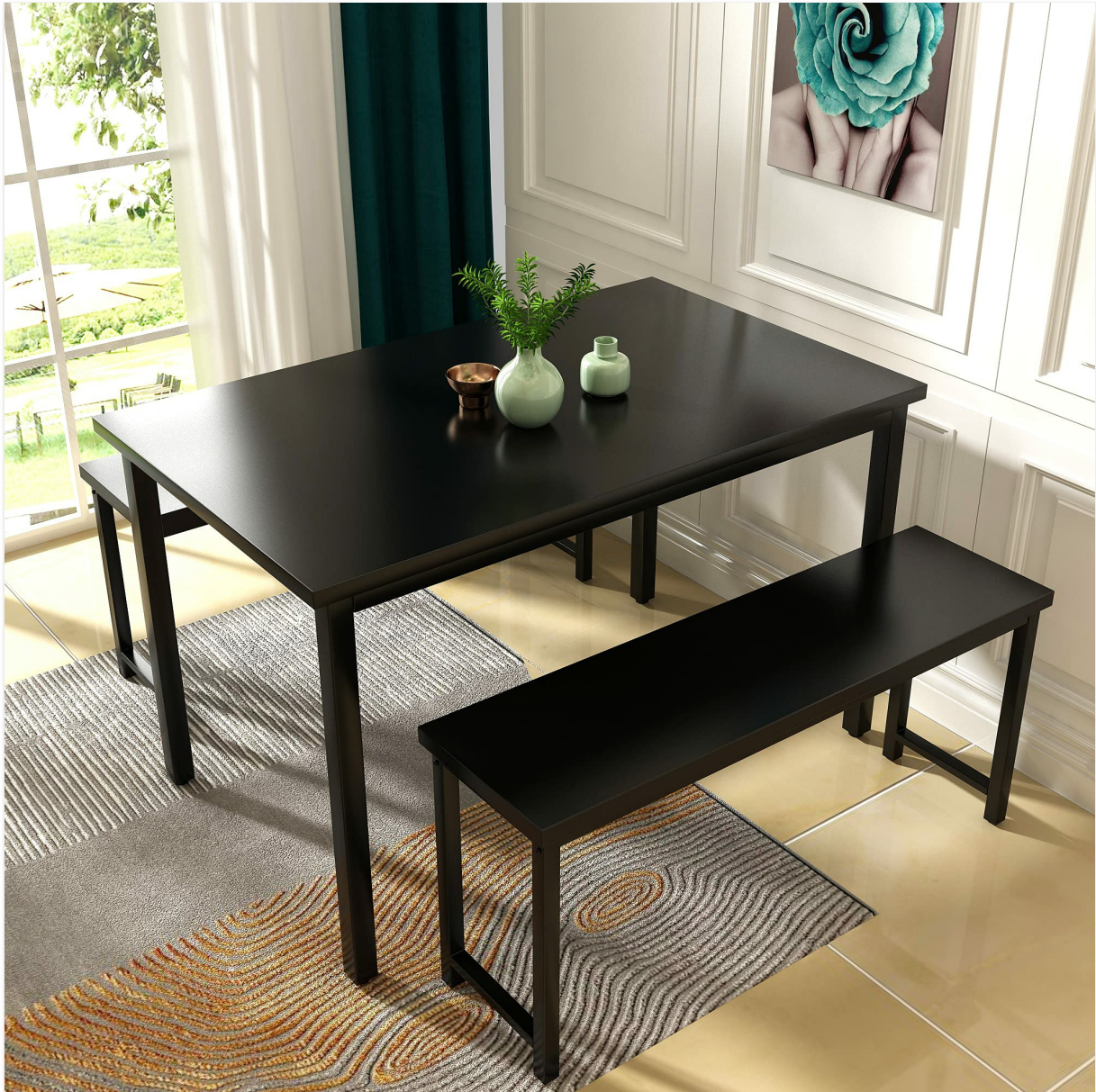
Figure 4.1: Fully assembled AWQM Dining Table Set with two benches.

The AWQM Dining Table Set is designed for straightforward assembly. Please refer to the included detailed installation manual for step-by-step instructions and diagrams. Ensure you have adequate space and the necessary tools before starting. It is recommended to assemble the furniture on a soft, clean surface to prevent scratches.