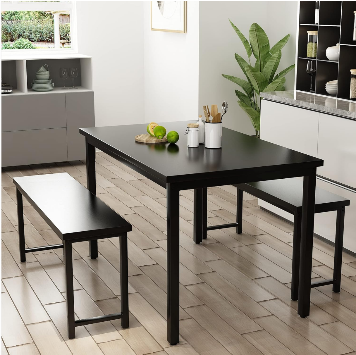
Figure 4.2: The dining set integrated into a kitchen space.