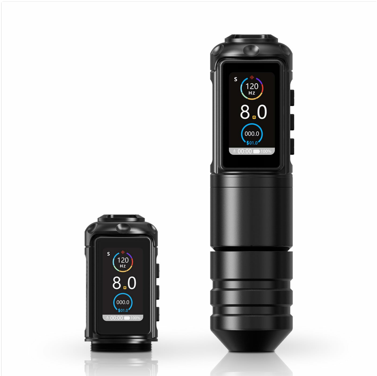
Image showing the Ambition Ninja Pro Tattoo Machine with its integrated battery display, indicating voltage and charge level.

Important: Do not completely drain the battery before charging, as this can damage the battery.