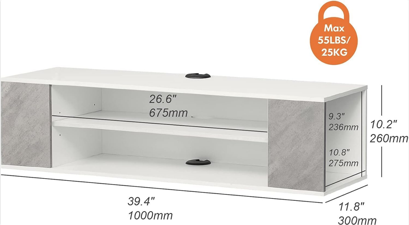
Image: Product dimensions and maximum load capacity.