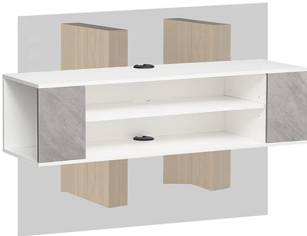
Wood Studs 16"

Image: Wall mounting options for concrete walls and wood stud walls (16-inch spacing).