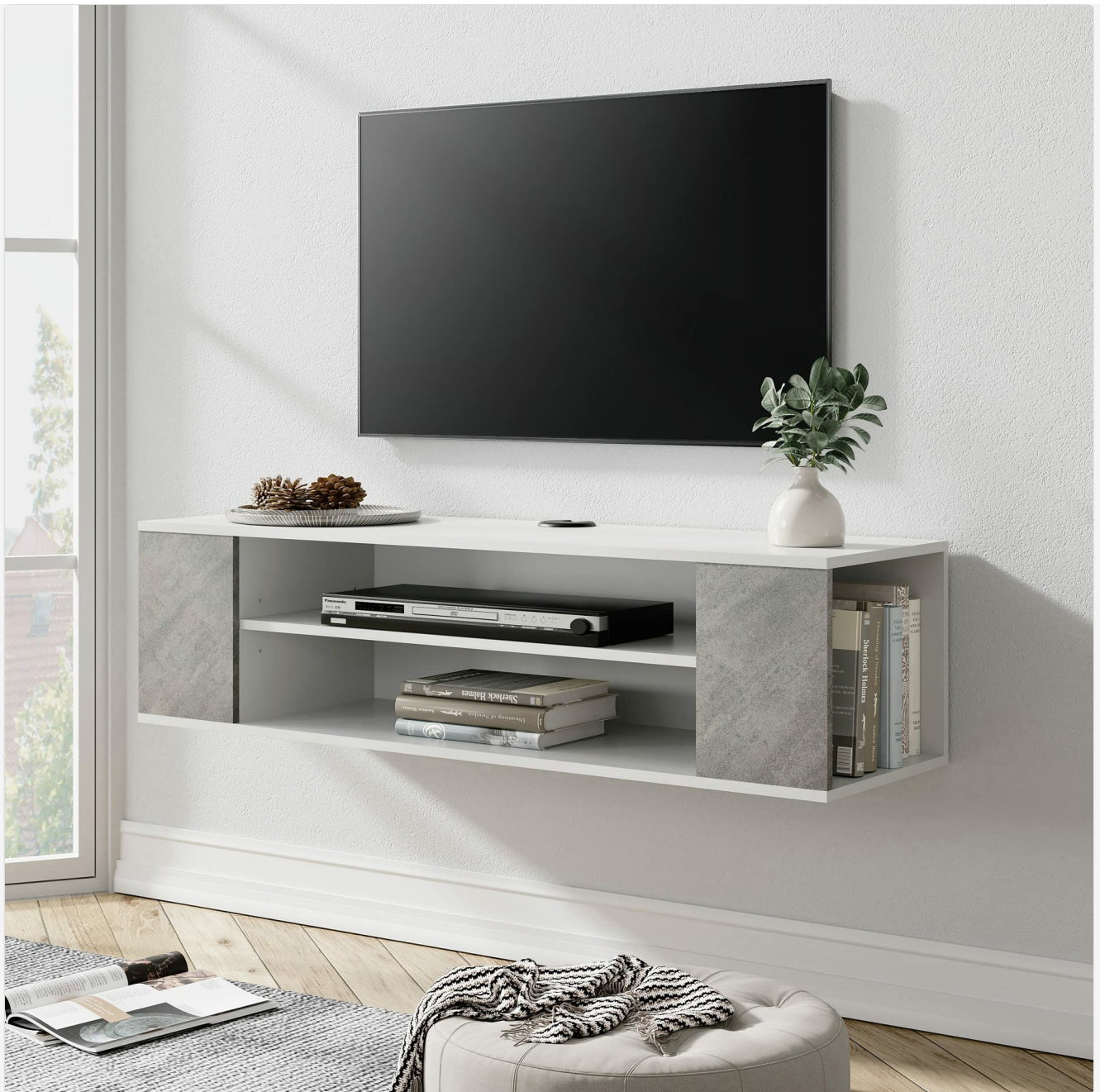
Image: The WAMPAT Floating TV Stand, Model 31ba1642-6e67-4e57-adda-5d630f0c891a, mounted on a wall.