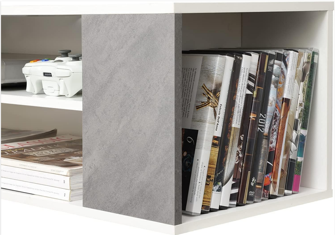
Image: Example of storage in the side compartments, holding DVDs and books.