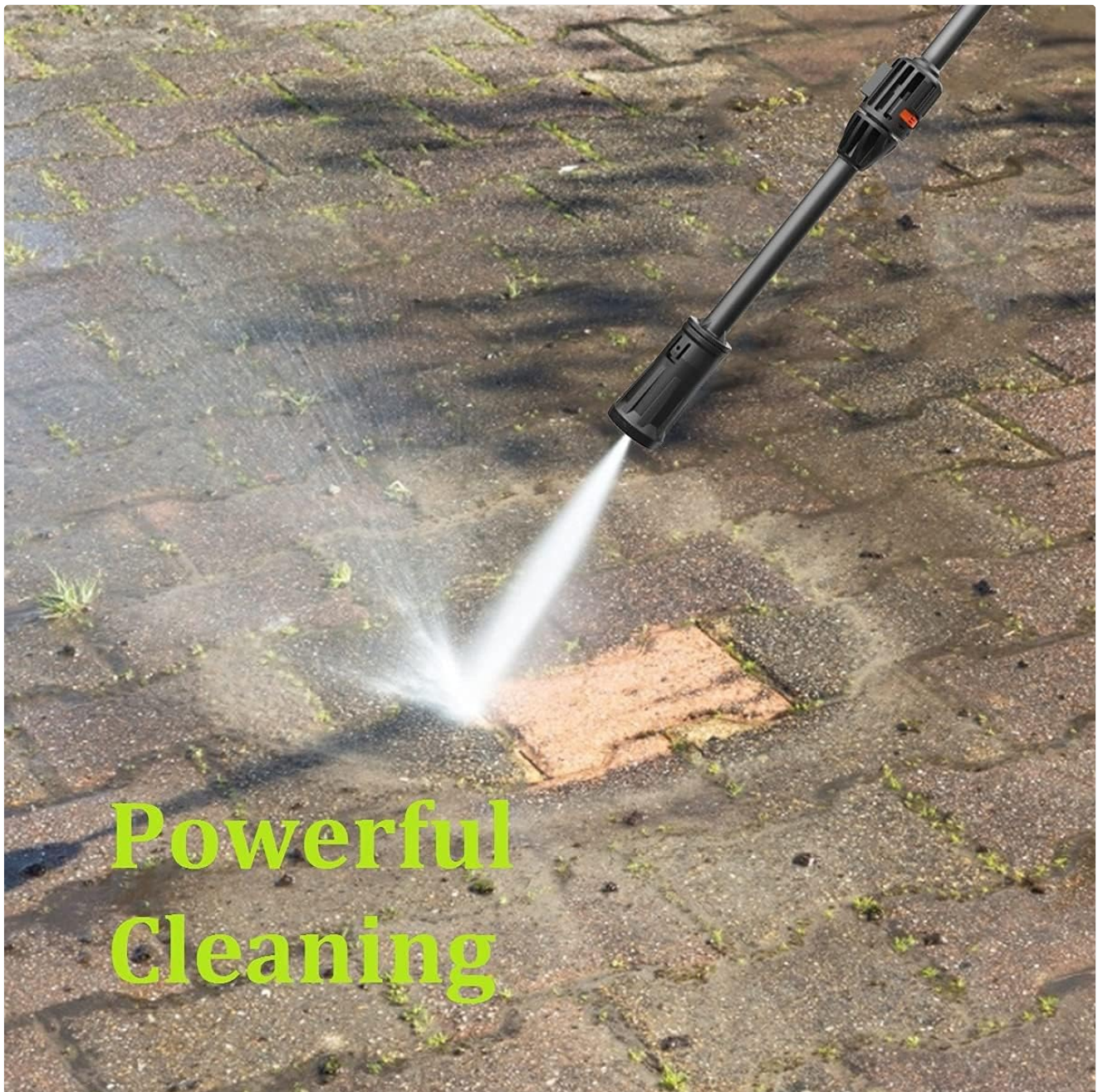
Image: A close-up shot of the high-pressure stream effectively cleaning a stained patio surface, highlighting its powerful cleaning capability.