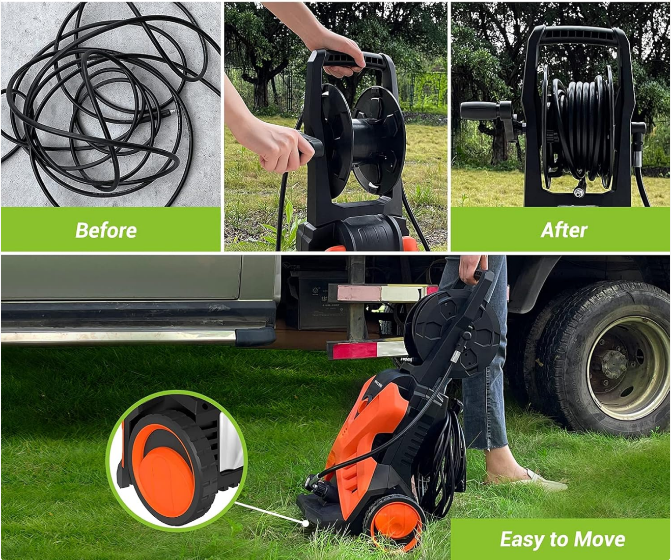
Image: A visual guide demonstrating the ease of storing the high-pressure hose using the integrated hose reel, and the mobility provided by the unit's wheels.