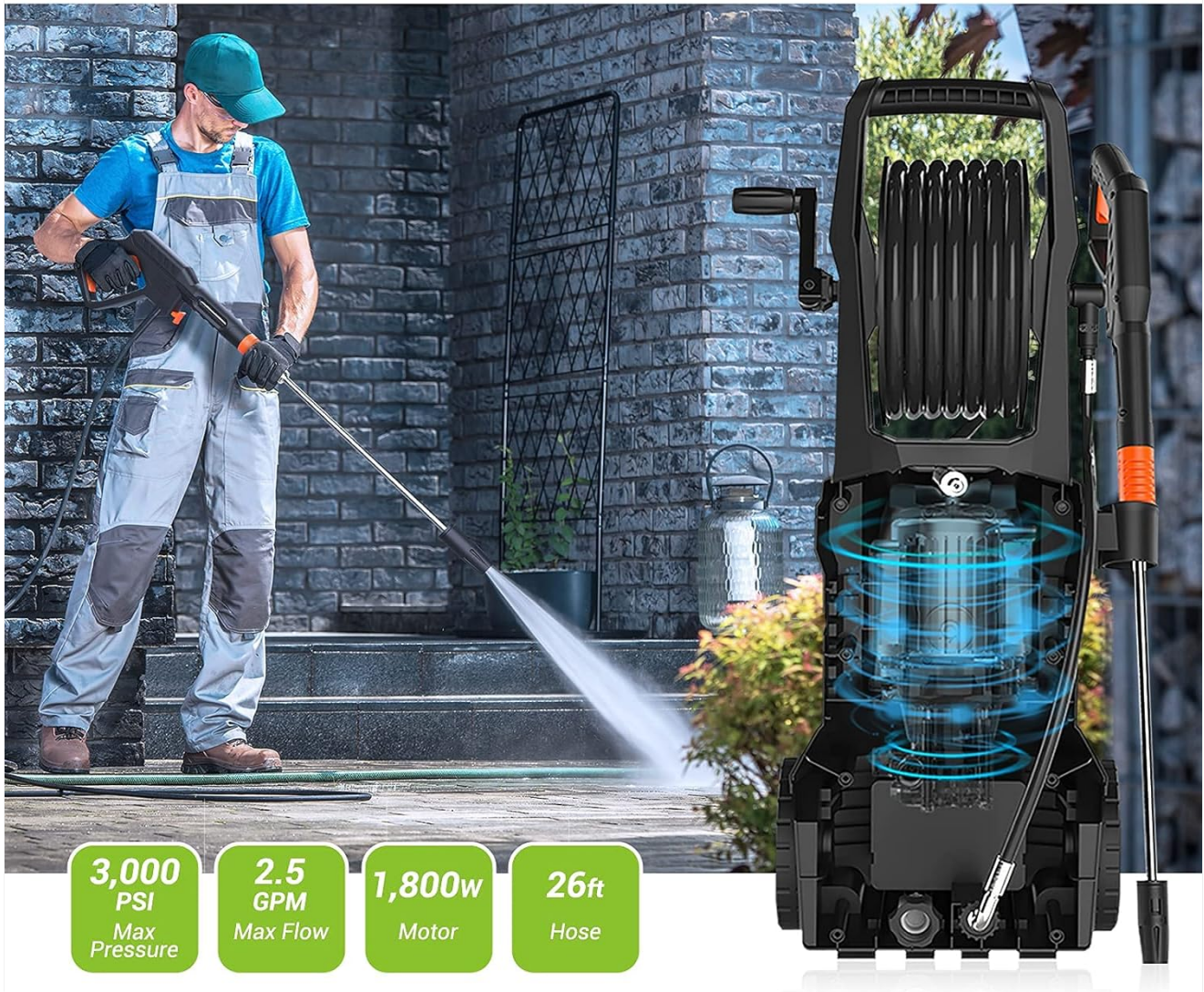
Image: A person operating the pressure washer to clean a paved surface, illustrating its powerful cleaning capability and key performance metrics.

Great for Cleaning Cars, Houses Driveways, Decks, Siding