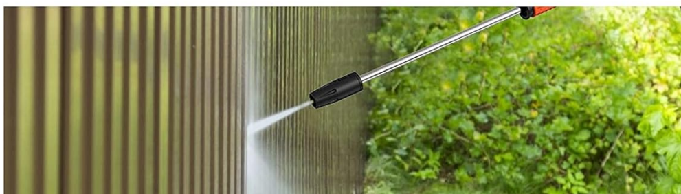
Image: A detailed view of the adjustable nozzle, illustrating its three primary modes: Soap Mode (low pressure with detergent), Fan Mode (low pressure wide spray), and Jet Line Mode (high pressure concentrated stream).