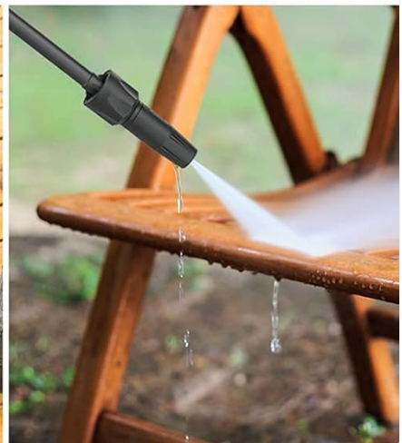
Image: A collage demonstrating the pressure washer's versatility, showing its effective use on vehicles, wooden decks, and outdoor furniture.