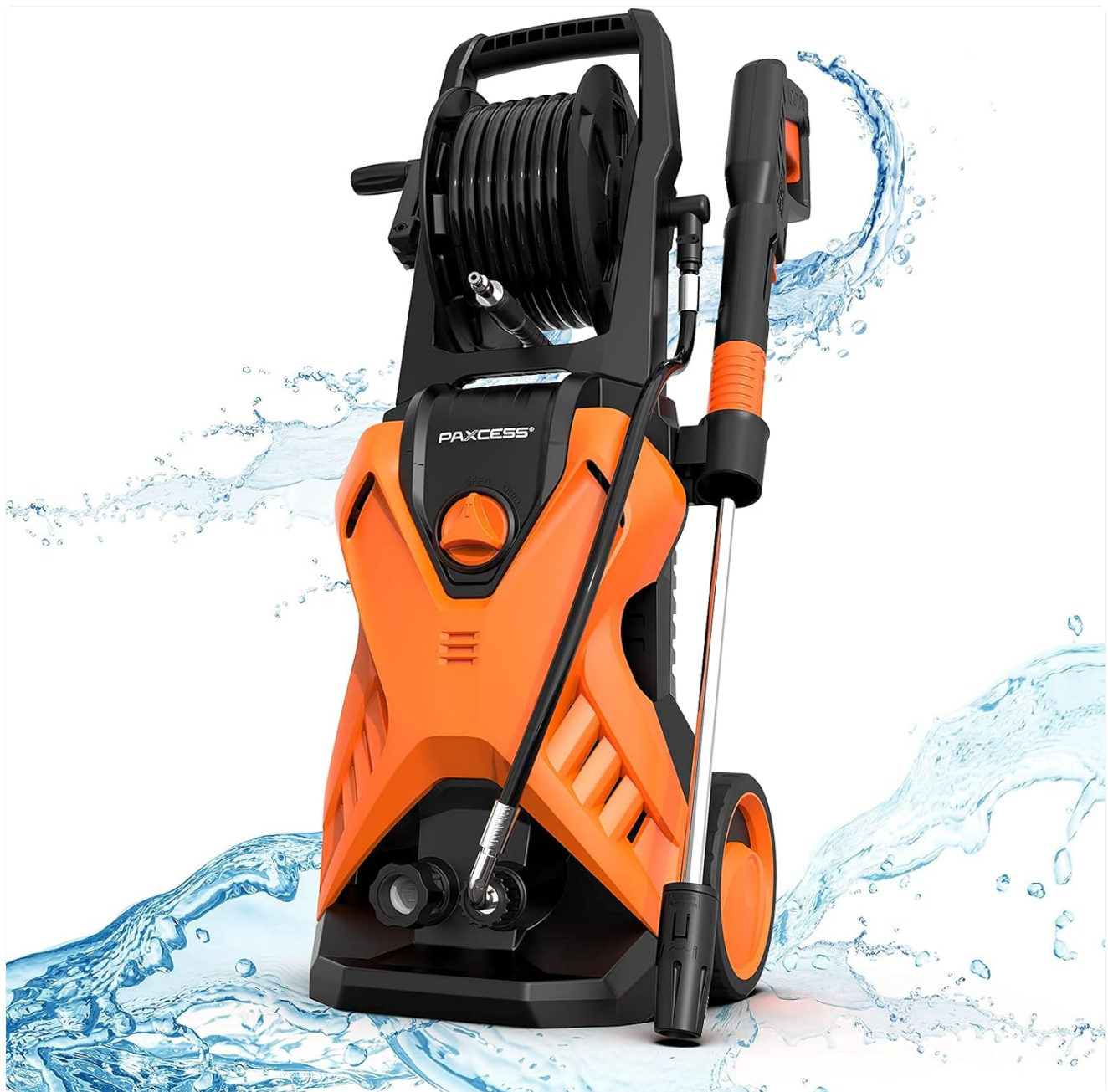
Image: The main PAXCESS Electric Pressure Washer unit, showcasing its integrated hose reel, spray gun, and overall compact design.