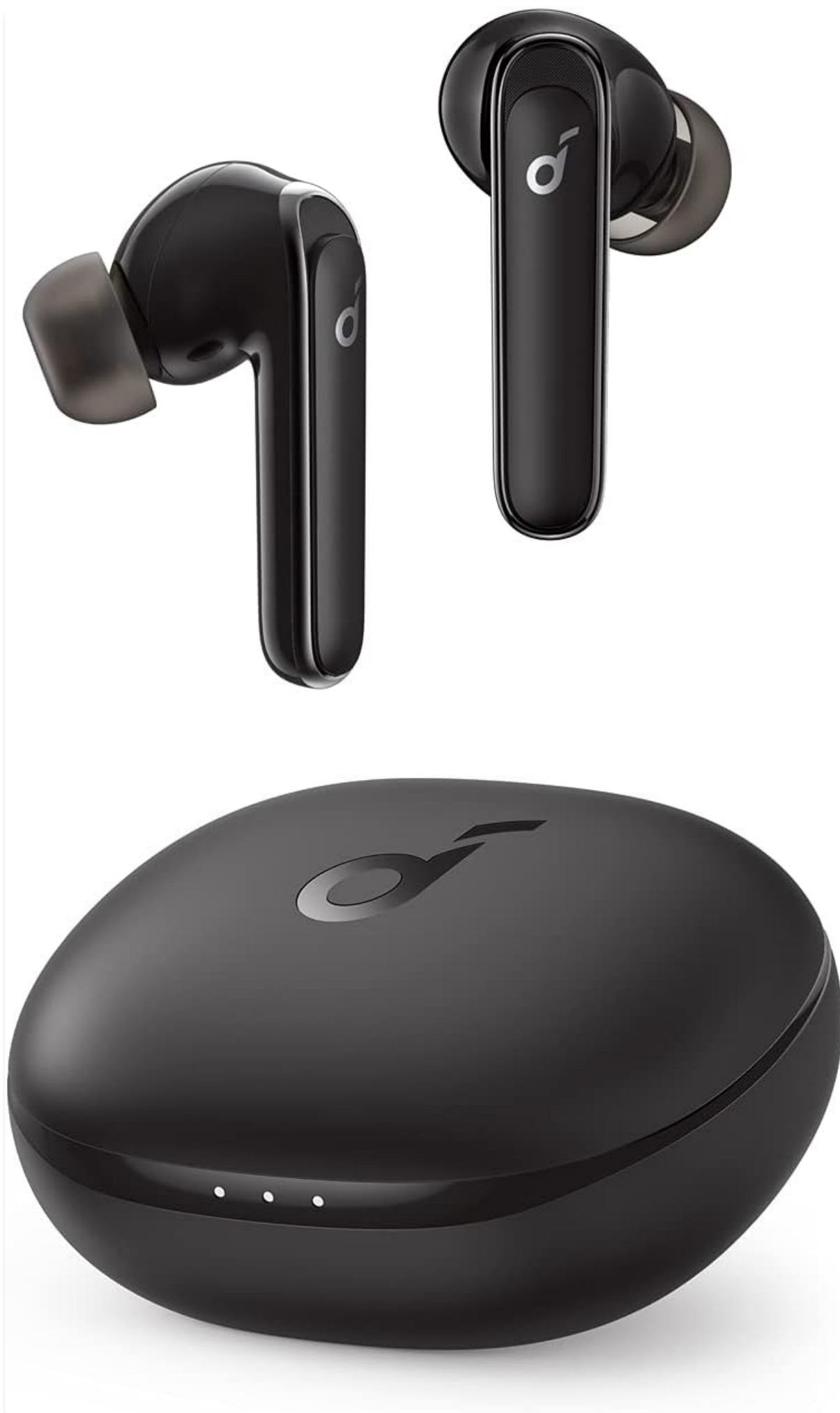
Image: Soundcore Life P3 Earbuds in black, shown with their compact charging case.