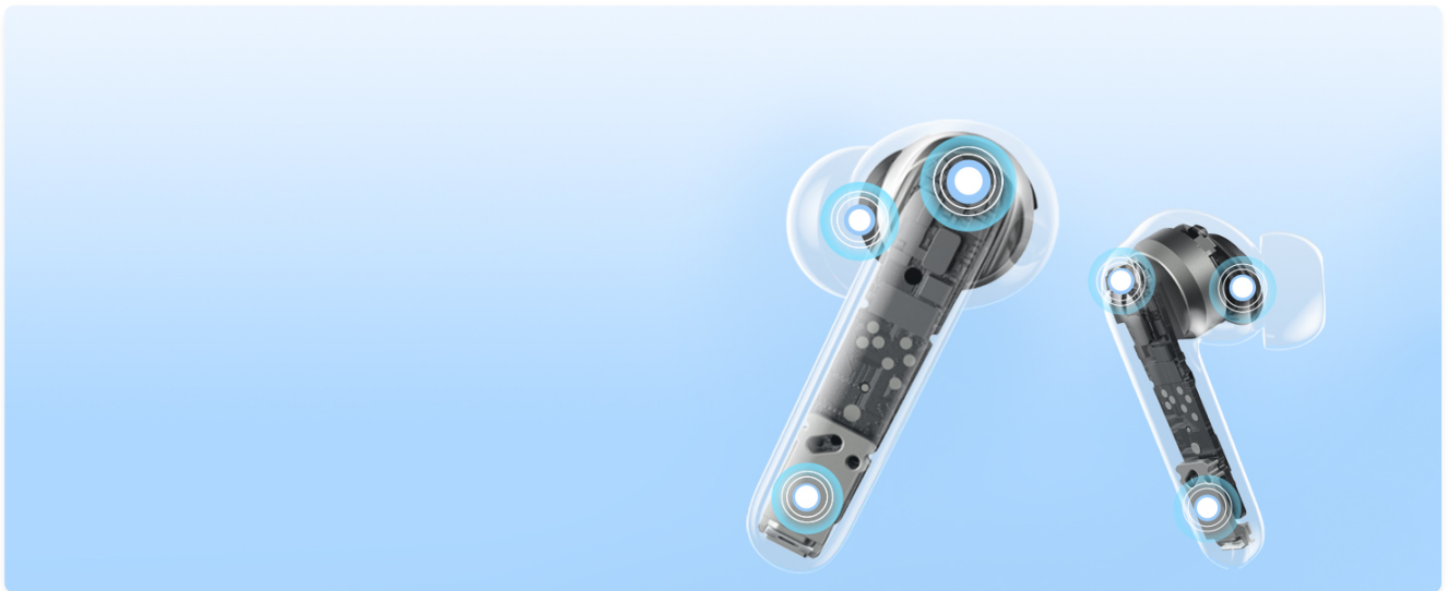
Image: Diagram illustrating the internal components of the Soundcore Life P3 earbuds, highlighting the drivers and microphones.

Your browser does not support the video tag.