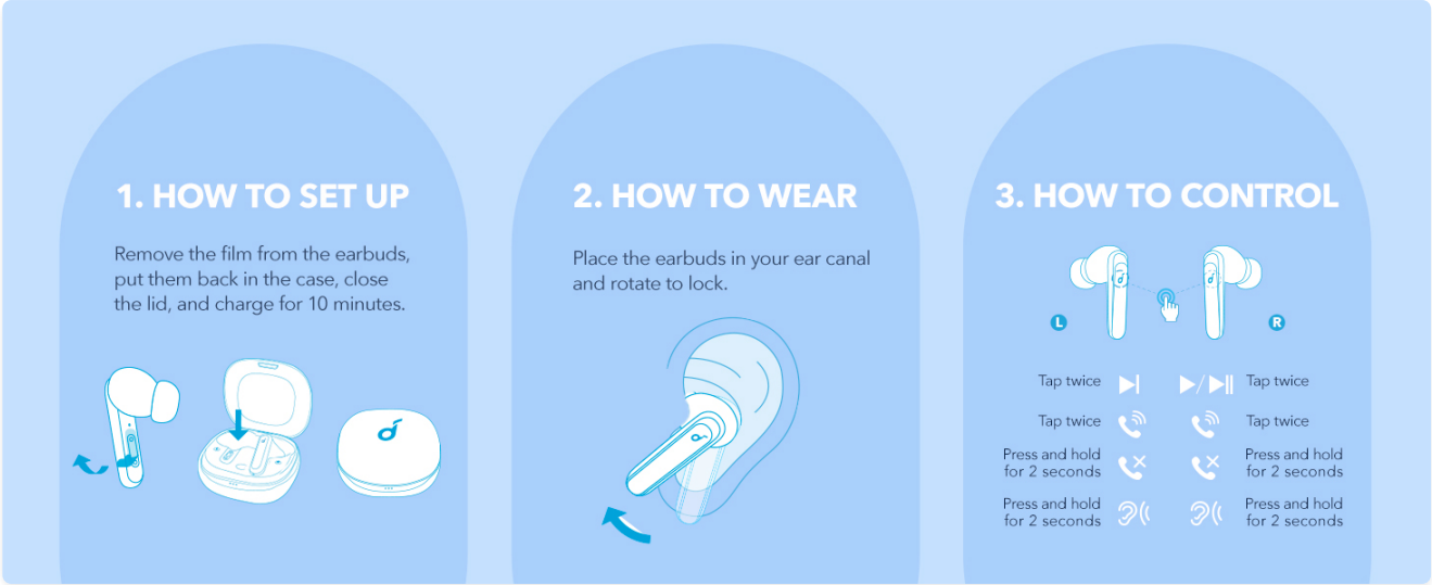
Image: Visual guide for initial setup, proper wearing technique, and touch controls of the earbuds.