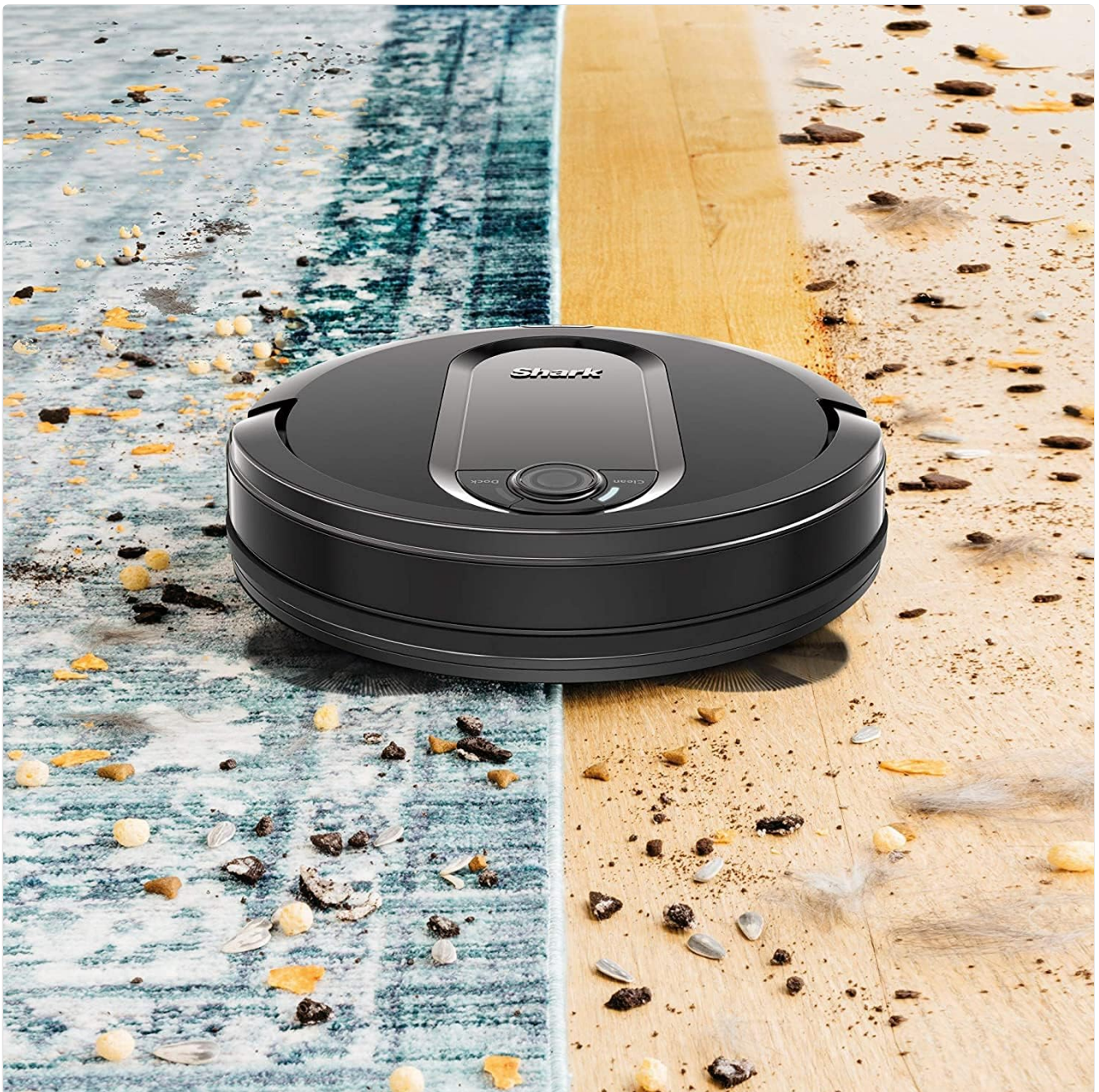
Figure 5: The robot vacuum effectively cleans various floor types, demonstrating its strong suction.