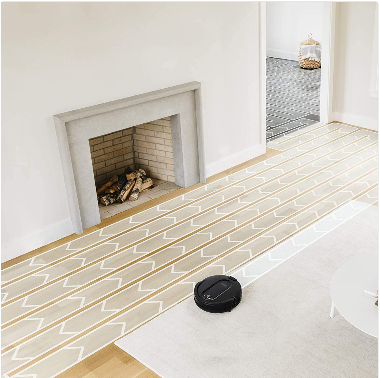
Figure 4: The robot vacuum employs a systematic cleaning pattern for thorough coverage.