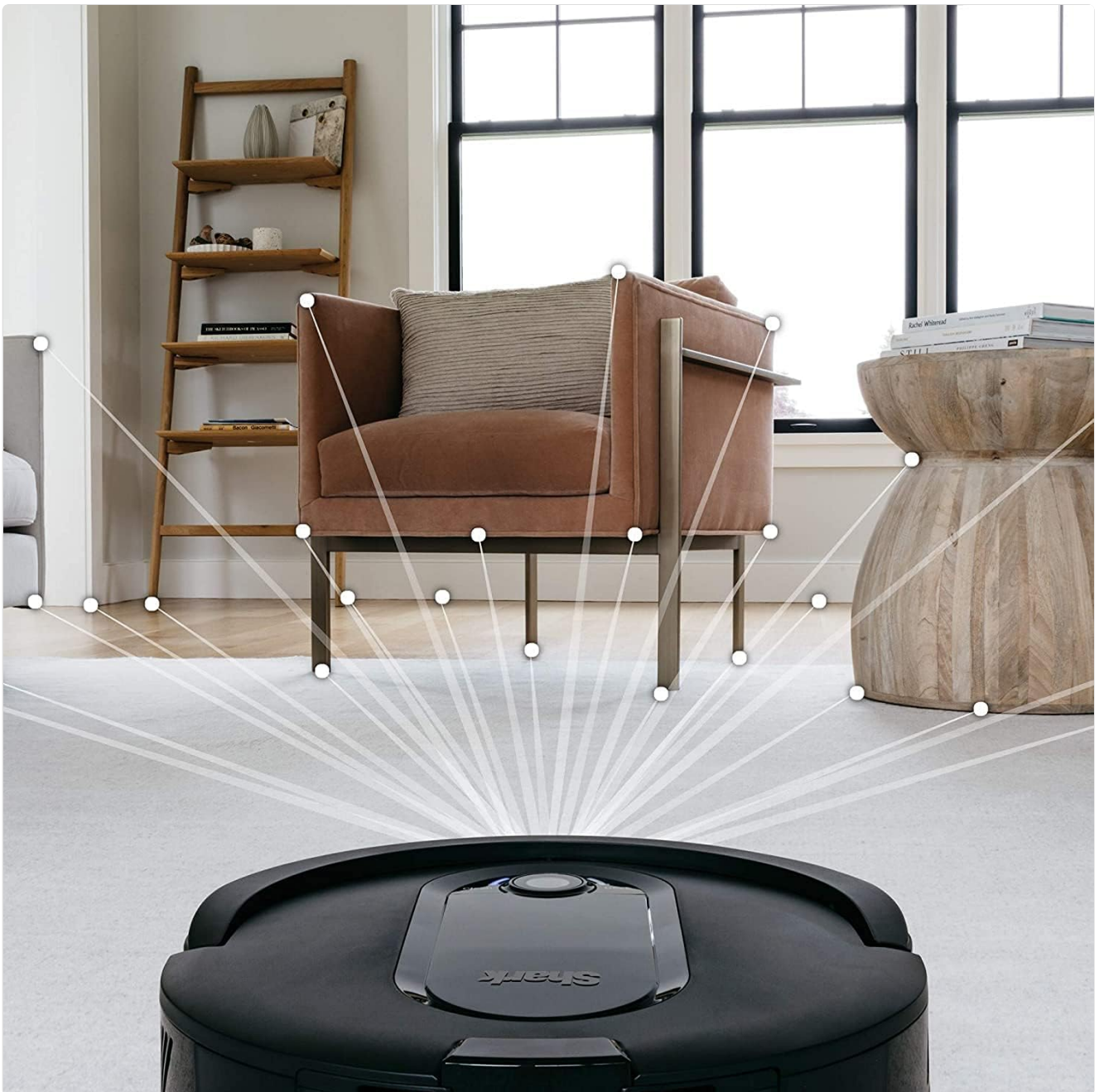
Figure 2: The robot vacuum actively mapping the floor plan during a cleaning cycle.