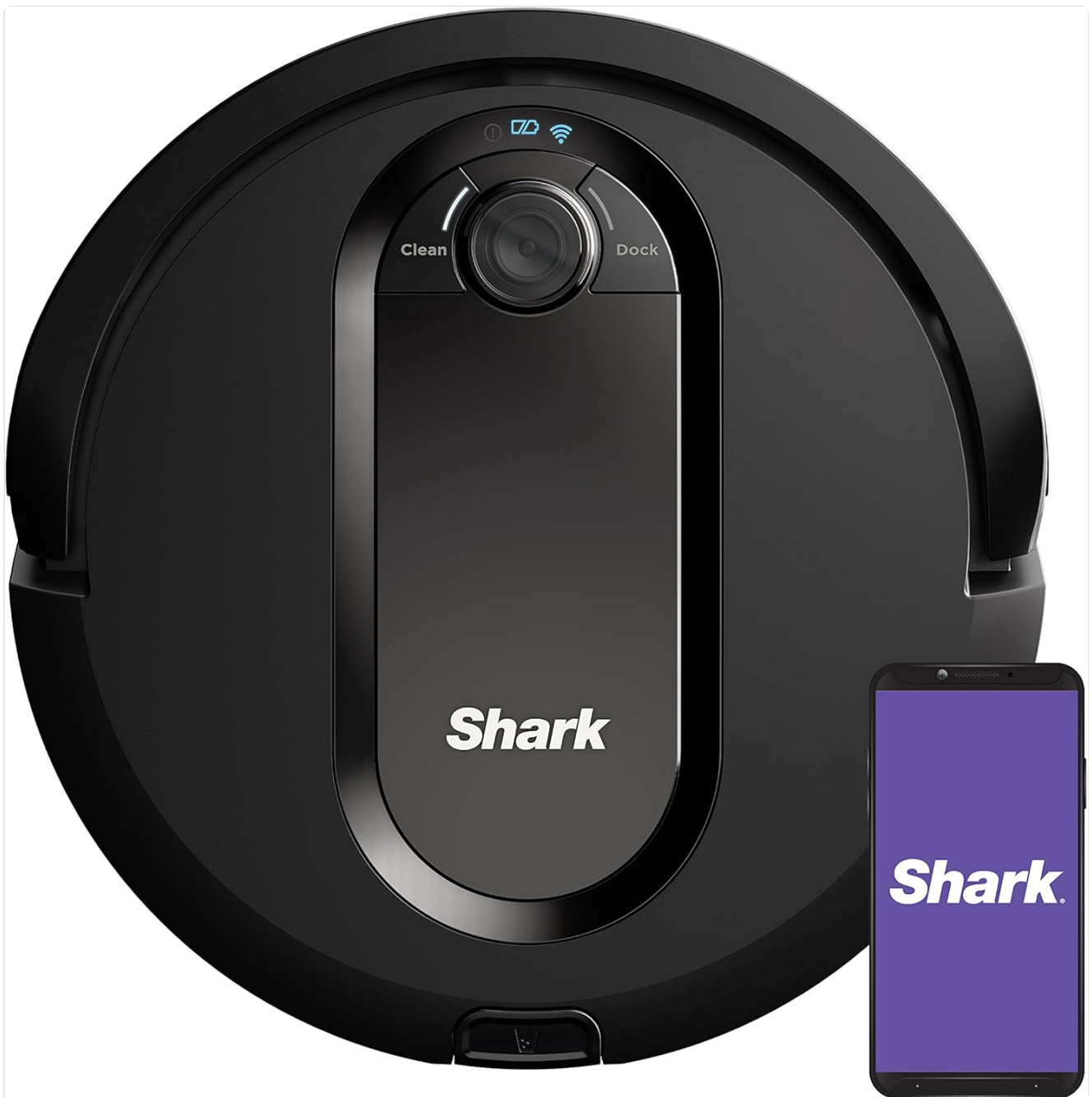
Figure 1: The Shark IQ Robot RV1100 and its accompanying mobile application.