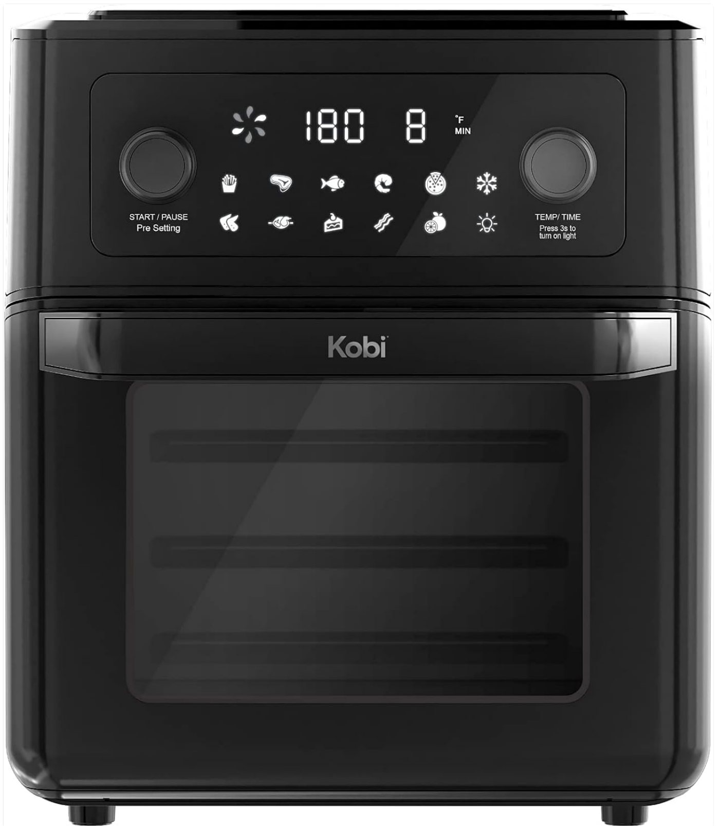
Image: Front view of the Kobi 12.7 Liter Electric Air Fryer Oven, showcasing the digital control panel and viewing window.