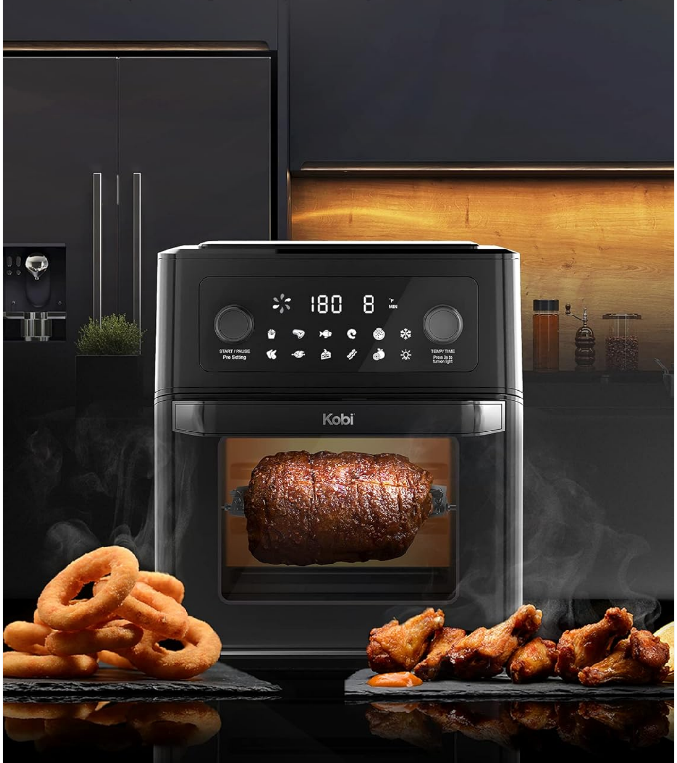
Image: The Kobi Air Fryer Oven with a rotisserie roast cooking inside, demonstrating the rotisserie function.

Modern square design frees up counterspace without sacrificing capacity.