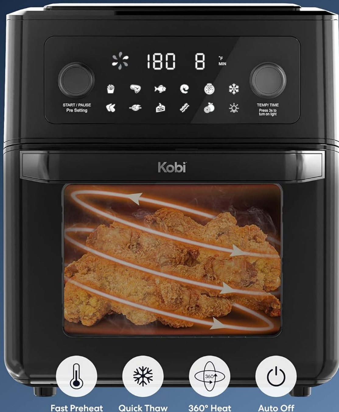
Image: Illustration showing rapid 360-degree heat circulation within the Kobi Air Fryer Oven, indicating efficient cooking.

Innovative convection technology ensures food cooks evenly, quickly, and to perfection.