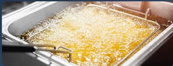
Traditional Deep Fry