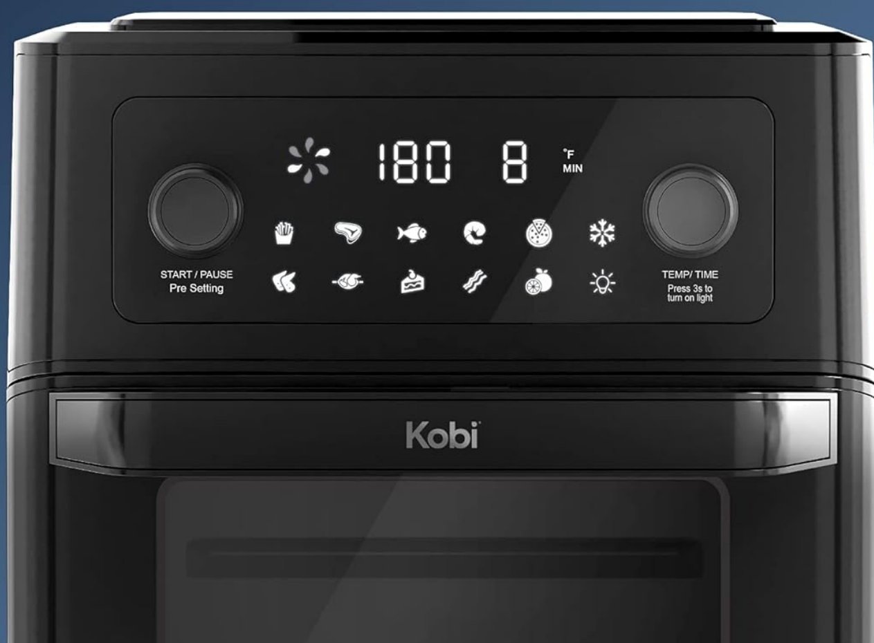
Image: Close-up of the Kobi Air Fryer's digital control panel, highlighting the 11 preset cooking functions.