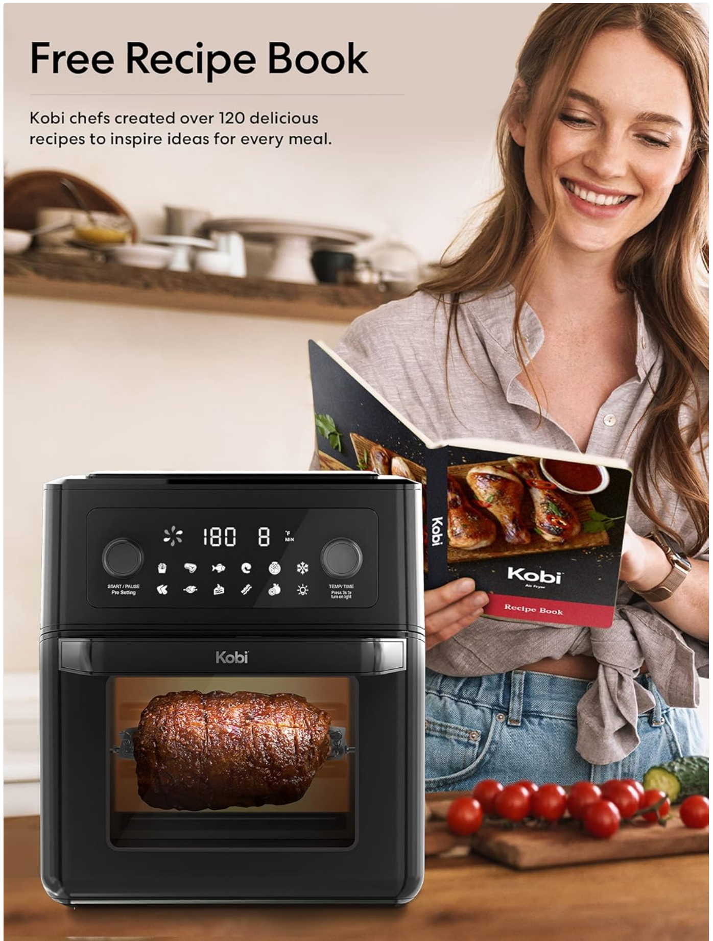
Image: A person holding a Kobi recipe book next to the air fryer oven and various cooked dishes, suggesting culinary inspiration.

Kobi chefs created over 120 delicious recipes to inspire ideas for every meal.